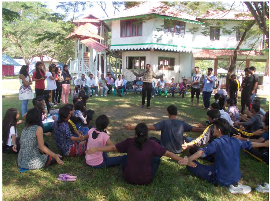
Rhino outdoor education programme at Gorumara National Park

In this session the description of all five species of Rhino was covered along with the differences, characteristics and patterns. The taxonomy was taught to them without much difficulty. The students as well the teachers showed keen interest to know more about Rhino. It was an interesting interactive programme.