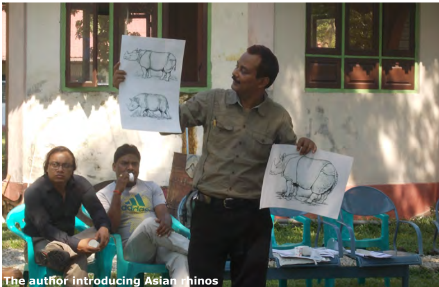
The author introducing Asian rhinos