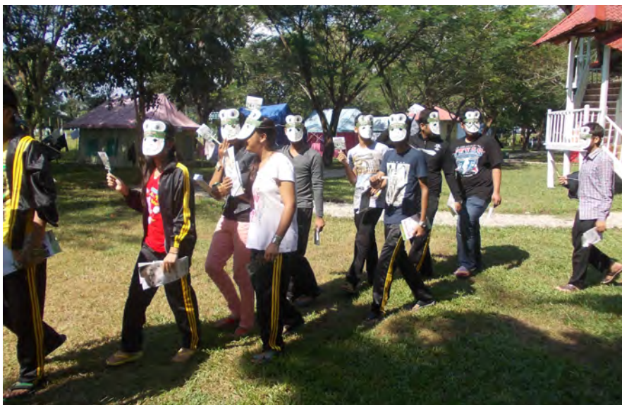
Rally to save Rhino