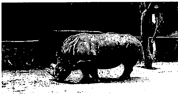
Fig. 135. San Diego, 1990.