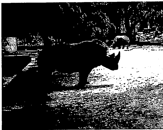
Fig. 134. A pair white rhinos in Mysore, October 1993.