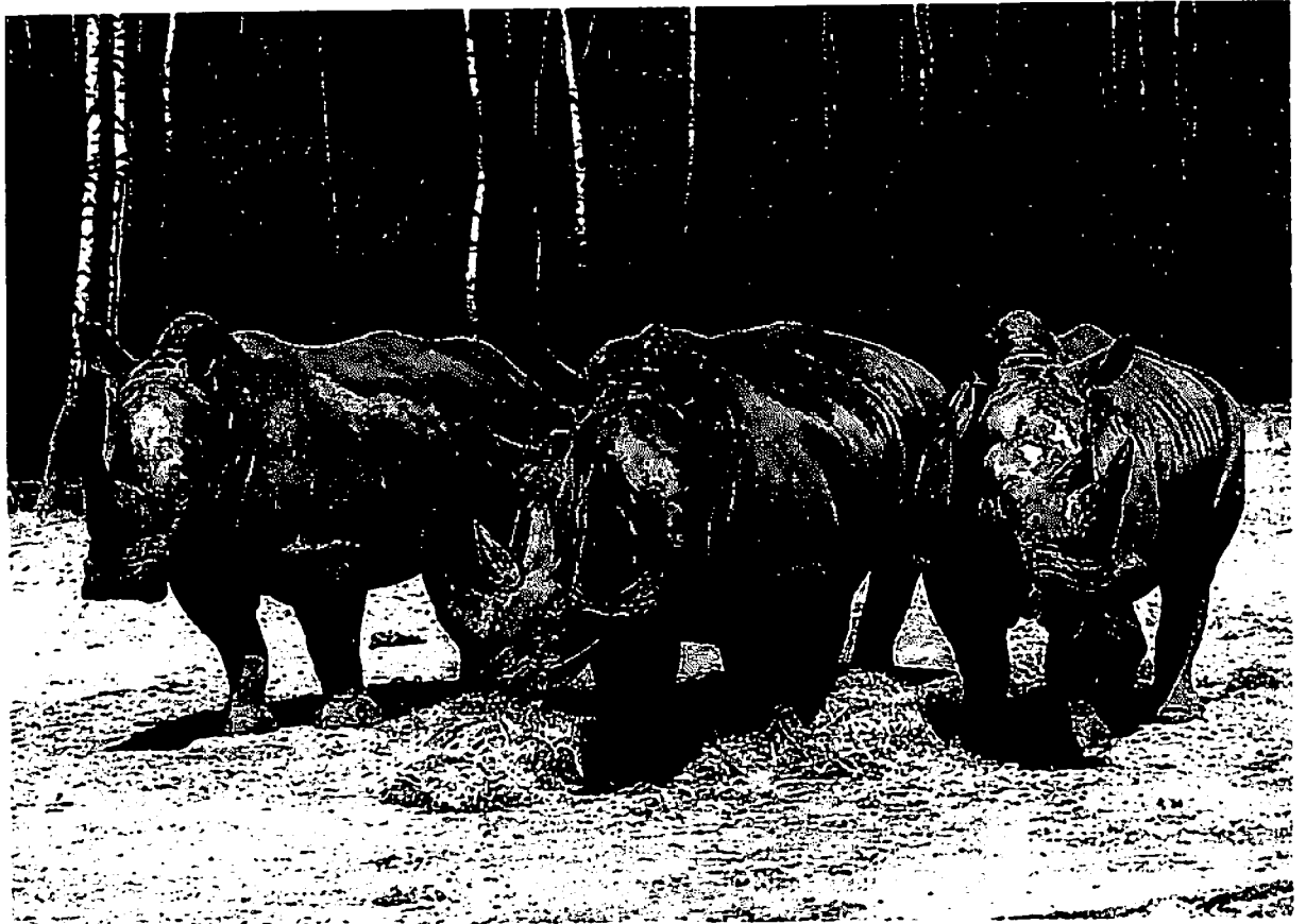
Fig. 132. White rhinoceros in Arnhem, from a postcard.