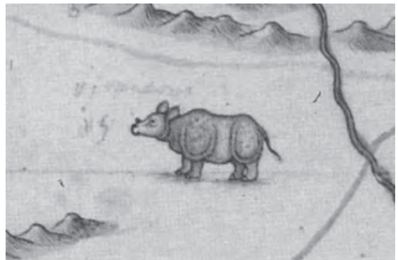
Figure 2. Rhinoceros on the map of 'Bear' (Bihar, India) in Gentil's Atlas.

which would now be in the area between Balrampur and Gorakhpur.