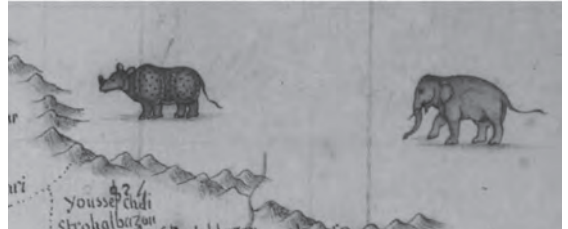
Figure 1. Rhinoceros and elephant on the map of 'Bengale' in the Atlas produced for Jean-Baptiste-Joseph Gentil in Faizabad in 1770. British Library, London.

The three images of a rhinoceros are found on the maps of 'Bengale' (Bengal; Figure 1), 'Bear' (Bihar; Figure 2) and 'Avadh' (Oudh, Uttar Pradesh; Figure 3). It might be argued that the little figures on the maps were entirely decorative. At the same time it is remarkable that the animals appear only on maps of regions where at one time the rhinoceros would have occurred, maybe even were still present when Gentil was in the country (Rookmaaker 1984). In the map of Bengal the rhinoceros is seen just outside the north-eastern border of the state, in Bihar near the Himalayan foothills, and in Oudh in the northern parts