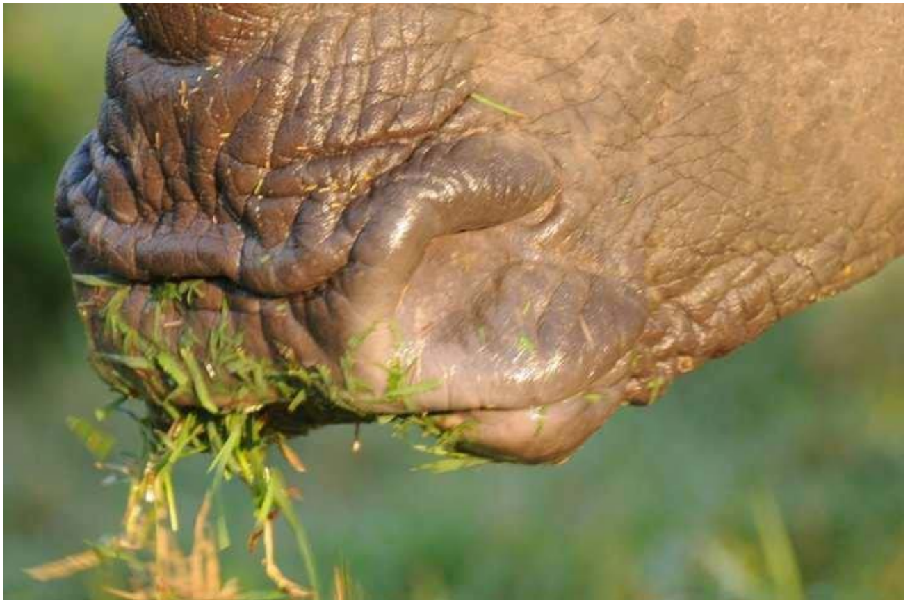
Zi wa Rhino Sanctuary, Uganda