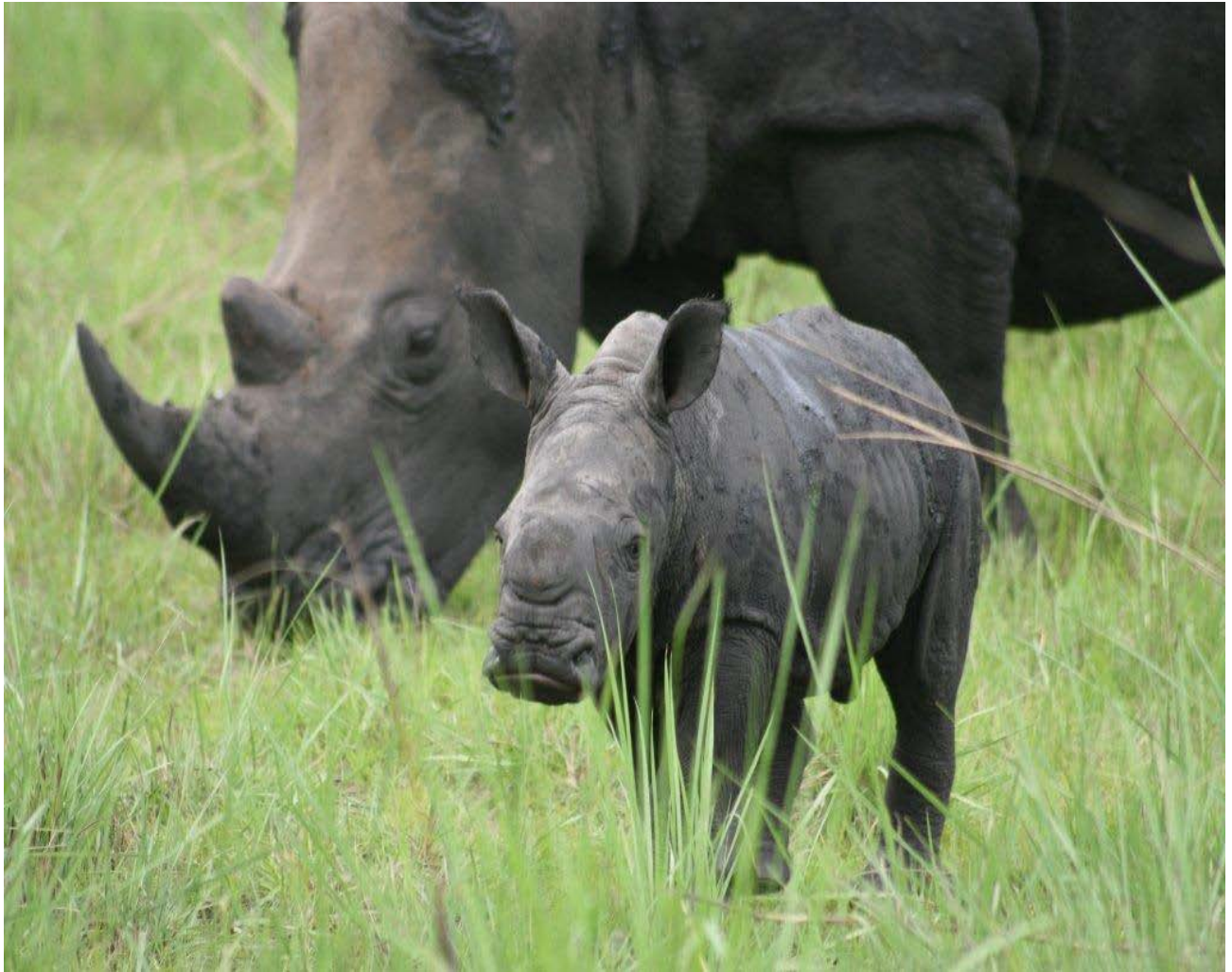
Zi wa Rhino Sanctuary, Uganda