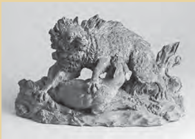
FIGURE A Anonymous (after Oudry), Hyena Attacked by Dogs , 1739. Terra-cotta, 18 × 23 cm (7 1 / 8 × 9 in.). Sèvres, Musée Nationale de céramique, inv. MNC 23462.

EXHIBITIONS: Paris 1739 and 1746; Schwerin 2000, no. 53; Fontainebleau–Versailles 2003–4, no. 67; Amsterdam–Pittsburgh 2006, p. 35.