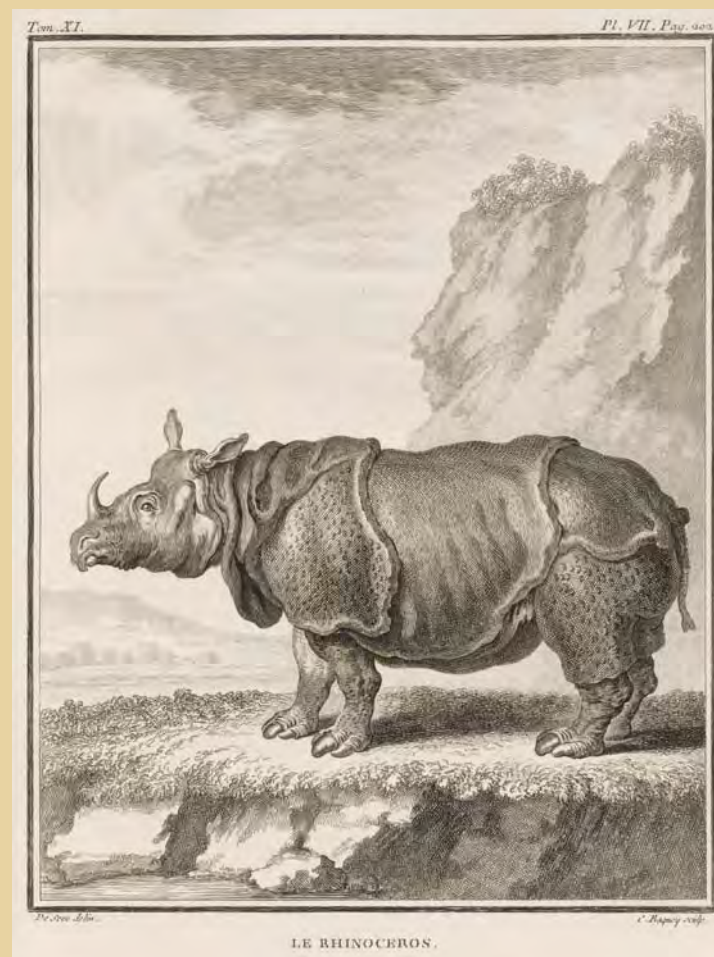
FIGURE B Jean-Charles Baquoy (French, 1721–1777), Rhinoceros , 1764. Engraving after Jacques Eustache de Sève (French, d. 1795), 22 × 17.5 cm (8 7/8 × 6 7/8 in.). Research Library, The Getty Research Institute, Los Angeles, 84–B8203.