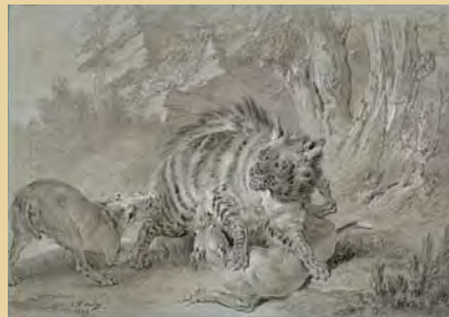
FIGURE B Jean-Baptiste Oudry, Hyena Attacked by Two Dogs , 1743. Black chalk on blue paper, 32 × 45.8 cm (12 1 / 2 × 18 in.). Paris, Musée du Louvre, Département des arts graphiques, inv. 31.495.