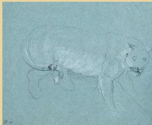
FIGURE B Jean-Baptiste Oudry, Study for Female Leopard , 1740. Black chalk on blue paper, 28.5 × 33.5 cm (11¼ × 13½ in.). Schwerin, Staatliches Museum, inv. 1174 Hz.