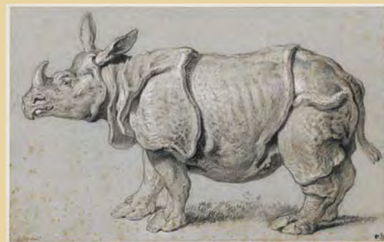
FIGURE A Jean-Baptiste Oudry, Study of the "Dutch" Rhinoceros , ca. 1749. Black chalk on blue paper, 27.6 × 44.4 cm (10⅞ × 17½ in.). London, The British Museum, inv. 1918.6–15.7.

In the seventeenth century, rhinos were known in the Western world mainly through artists' depictions, drawn from either hearsay or memory and generally embellished by fantastic, exotic, or mythical notions.