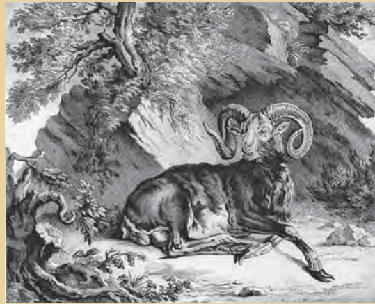
FIGURE A Pierre-François Basan (French, 1723–1797), Barbary Sheep , ca. 1745–50. Engraving, 30.7 × 38.1 cm (12½ × 15 in.) (plate: 32.5 × 39 cm [12¾ × 15⅜ in.]). Paris, Bibliothèque nationale, cabinet des estampes, inv. DB-23 FOLT2.

THIS PAINTING WAS EXHIBITED at the Salon of 1739 as a “bouquetin de Barbarie” (Barbary ibex), a term which refers to a sheep native to what were then known as the Barbary States: present-day Morocco, Algiers, Tunisia, and Libya. In fact, the animal is not a Barbary sheep but a wild ancestor of domestic sheep known as a mufflon, which inhabited the cold, dry desert areas and mountain peaks of Asia Minor, Europe, Corsica, Sardinia, and Cyprus. 1 Gracefully arranged on the ground against a rocky outcropping, which stretches up behind him in dark and light jags, the ram is pictured with an almost human dignity, attentively responsive to an unseen presence. The multiple rings on his monumental horns signify a very mature male. 2