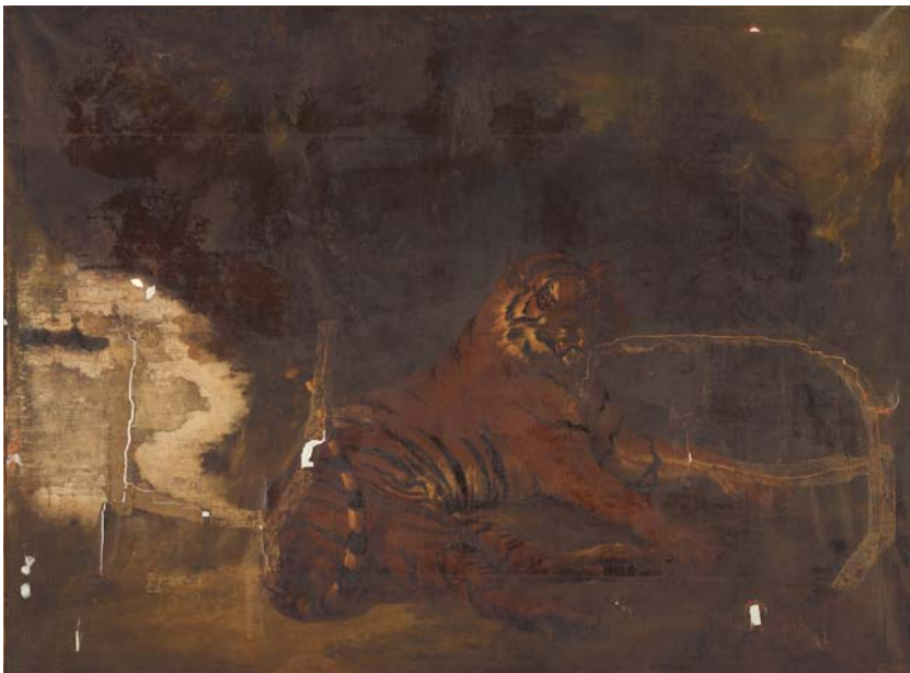
FIGURE 2 Jean-Baptiste Oudry, Tiger , 1740. Oil on canvas (pre-conservation), 158 × 191 cm (62¼ × 75¼ in.). Schwerin, Staatliches Museum.

THE PLATE SECTION THAT FOLLOWS is introduced by Oudry's portrait of Christian Ludwig's son Friedrich, who in the last third of the duke's life played such an important role in expanding the ducal art collection. The prince's portrait is followed by ten of the thirteen paintings listed in Oudry's March 1750 letter to the duke: nine portraits of animals from the Versailles menagerie, plus the portrait of Clara (see Christoph Frank's essay, pp. 52–53). The final plate illustrates Oudry's painting of one of the Versailles lions, completed and sold in 1752 to the duke. Missing is the first painting on Oudry's list, "un léopard" (now titled Tiger ), also from the Schwerin collection, which is currently undergoing treatment in the Getty Museum's conservation studio (fig. 2). Also missing from Oudry's original list are "le chat-cervier" and "le guide-lion." Both these paintings of lynxes went to Schwerin with the suite of menagerie paintings, but in the tumultuous history of the Schwerin collection, they are no longer accounted for. 26 ♦