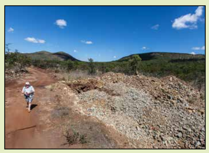
According to a Zimbabwe Government report (the portfolio committee on mines and energy October 2013). There are eight Chinese companies mining chromium in Zimbabwe at the moment, but only one could produce documentation to substantiate mining rights.

The Sebakwe Conservation Education Centre is a focus in the conservancy to educate and inform about the value and importance of looking after the environment and the flora and fauna that exists in the countryside. It also works with the schools to educate the children who are the custodians of the future and it will be their job to manage the awkward balance between commercial interests and conservation in the future.