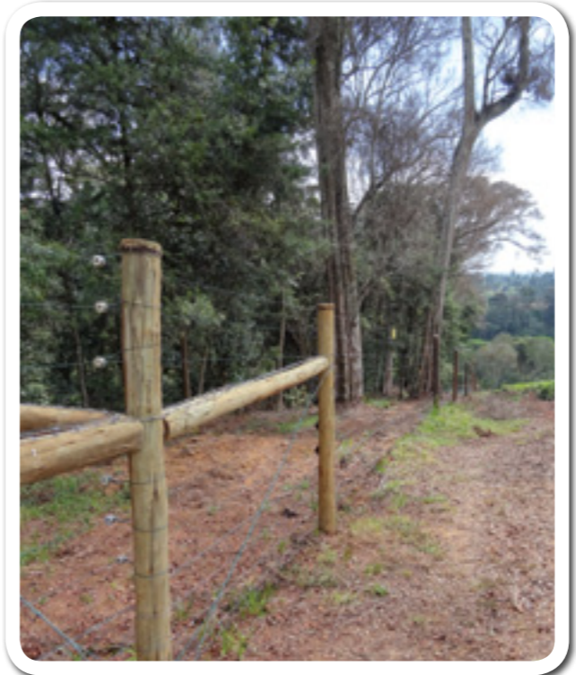
Mt. Kenya Electric Fence between Thambana and Irangi

Preparation for the building of Phase Two is well underway and Procurement of fence material has been done.