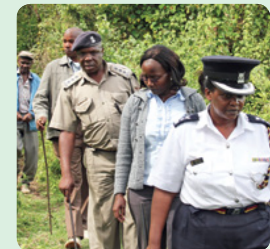
Walking through the forest