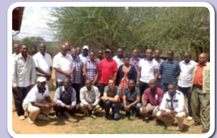
Training of KWS wardens in the administration of justice, Mpala Research Centre, 10 th - 12 th April 2014