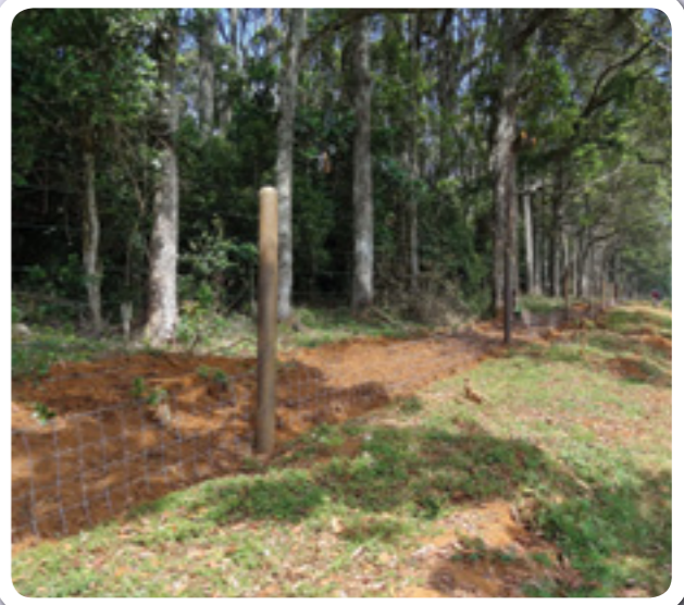
Old plantation of camphor trees protected by the newly built fence near Irangi Forest Station

The Mt. Kenya Electric Fence is now protecting some 20,000 camphor trees ( Ocotea usambarensis ) planted in the late 1940's near Irangi Forest Station. Over the past decades, illegal logging has been the main threat to this plantation of hardwood indigenous trees. The newly erected electric fence will assist KFS and KWS in addressing this menace.