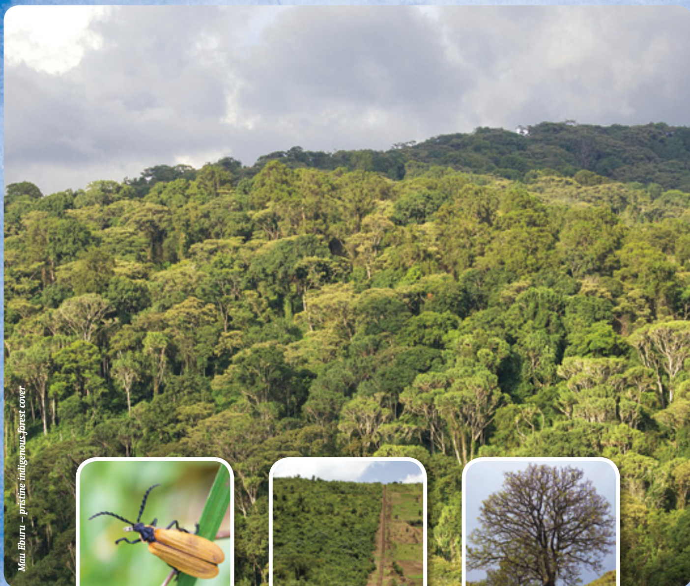
Mau Eburu – pristine indigenous forest cover