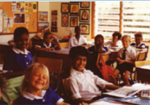
Primary School Students 1986