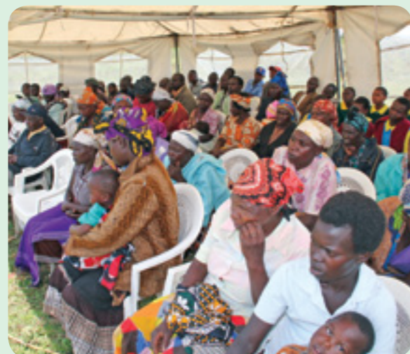
Local community members keenly follow proceedings at the event

The field visit provided a good foundation for enhanced future collaboration between law enforcement officers, administration officers and the project team.