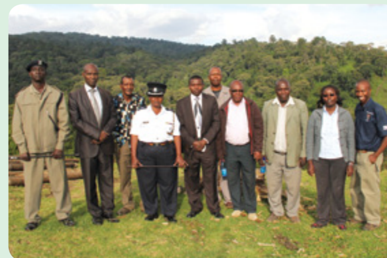
Group at Centre One in Ndadibi Location