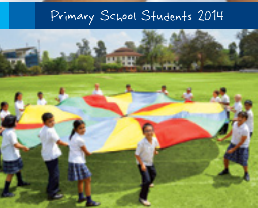
Primary School Students 2014