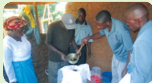
Filtering honey during semi-processing