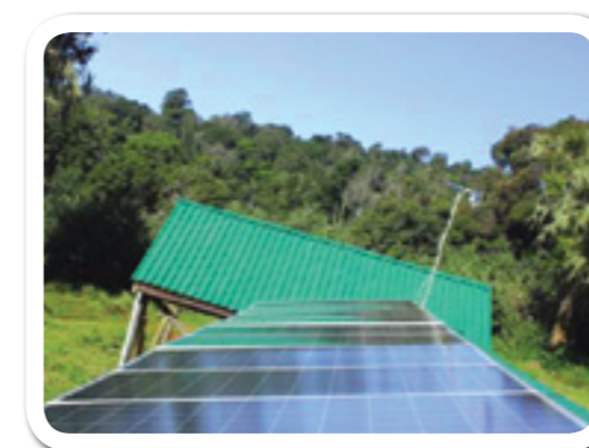
Solar panels recently installed on the roof of the Rhino Retreat

As part of the greening of its operations, Rhino Ark has installed a solar power system in its operation base in the Aberdare National Park, known as the "Rhino Retreat". Nine solar panels of 250 watts each are now powering the base, together with a state-of-the-art charger-inverter. The system was installed by Chloride Exide Kenya Ltd.