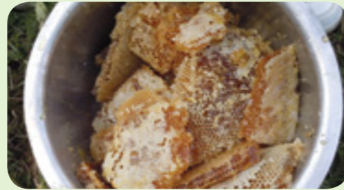
Honey comb freshly extracted