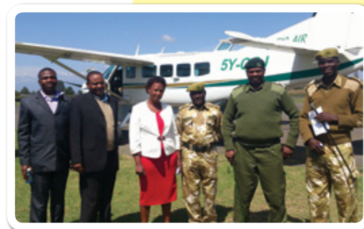
Joint team that participated in the surveillance flight of 24 th March 2014