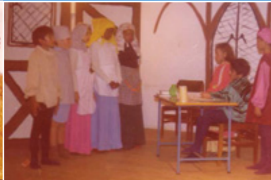
School Drama 1980