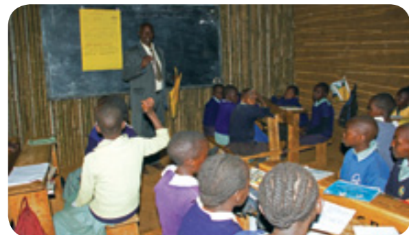
Conservation education classroom session at Cypress Primary School

At the present rate of construction, it is anticipated that the fence will be completed by the end of the year.