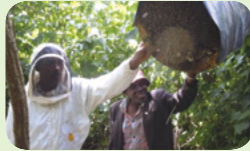
Examining log hive

Rhino Ark will continue to work with the Eburu communities as well as other stakeholders to further develop the bioenterprise honey production initiative.