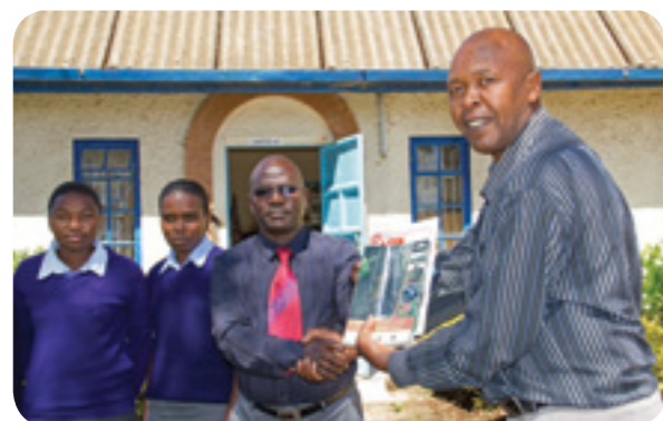
Eburu Secondary School receives curriculum books

This initiative by Rhino Ark marks a distinctive step forward for conservation education: it brings together relevant knowledge from diverse areas and packages it into a harmonized form that can be taught to school children in a systematic manner. It facilitates continuous and consistent learning through the mid-primary to secondary school academic life of pupils, and in so doing, provides a solid foundation for them.