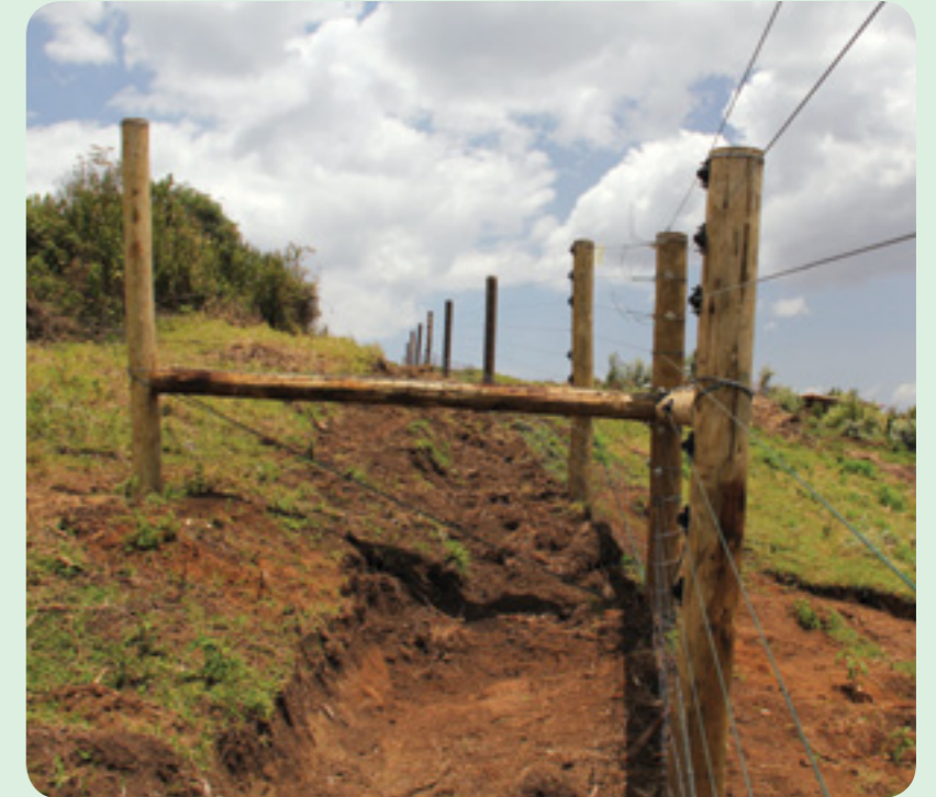
Corner strainer assembly at completed section of fence in Gachuma area

Governance of the project is supported by a Fence Management Committee constituted for this purpose. This committee comprises top management of the three partner organizations, and exists to provide corporate level support and guidance to the project.