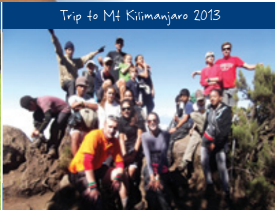
Trip to Mt Kilimanjaro 2013