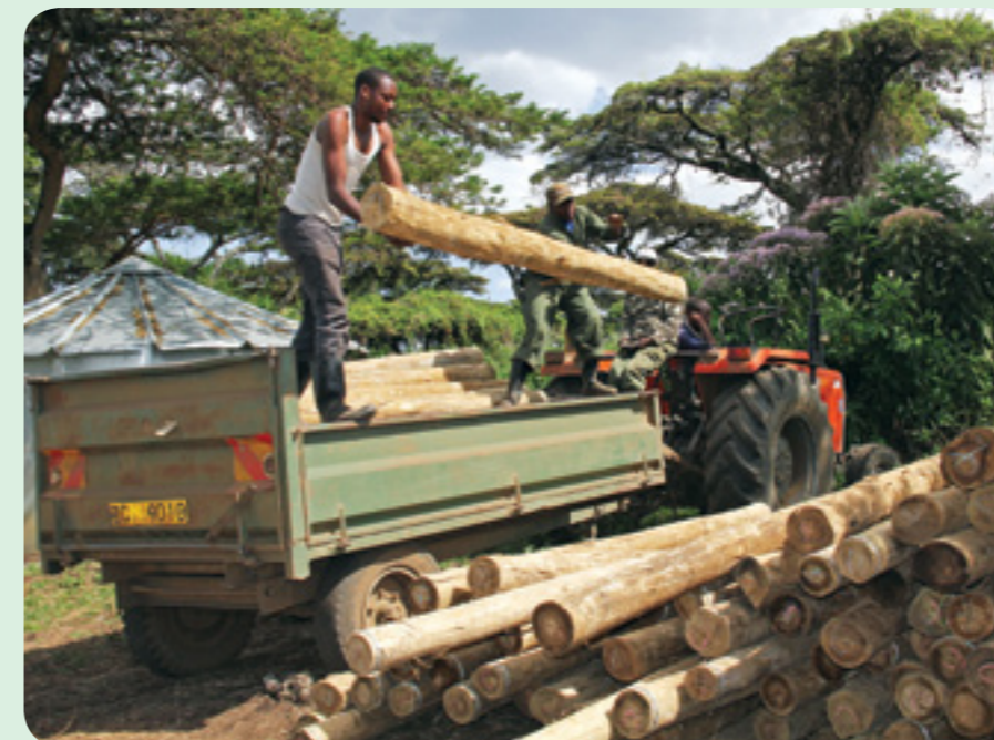
Fence crew unloads delivery of wooden fence posts at Kahuho Camp