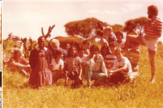
Trip to Meru 1982