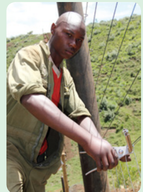
Fencing crew member stapling tight lock wire mesh to fence wire