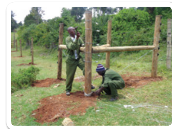
Rehabilitation of Phase One, between Mitero Gate and Wandare Gate. New posts and strainer assemblies placed next to the old fence