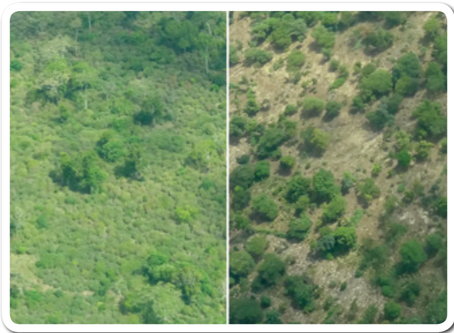
Lantana camara before and after

The flight carried out on 13 th March enabled assessment of the efforts conducted by KFS to rehabilitate the Lower Imenti forest. That forest was invaded by Lantana camara – a highly invasive plant species from the American tropics - after the eviction of squatters in 1999 [left photograph]. KFS entered into an agreement with neighbouring farmers by which they are allowed to plant annual crops in the forest for a period of three to four years in exchange of which the farmers have to uproot the invasive lantana, plant young indigenous trees and care for them.