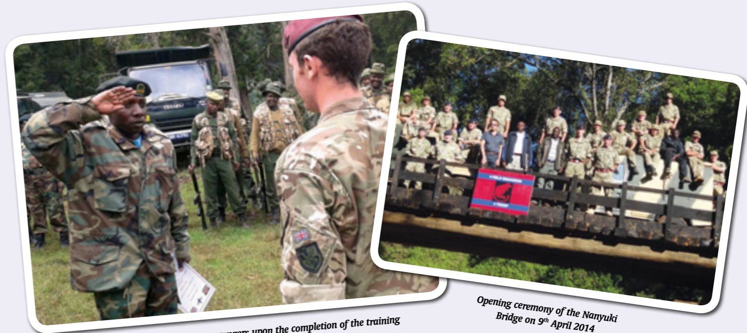
Award ceremony of certificates to rangers upon the completion of the training

With the support of BATUK, the rehabilitation of Nanyuki Bridge has been successfully completed. The bridge is the first among the eight key infrastructure components identified in Mt. Kenya and Aberdares to be rehabilitated with the support of BATUK.