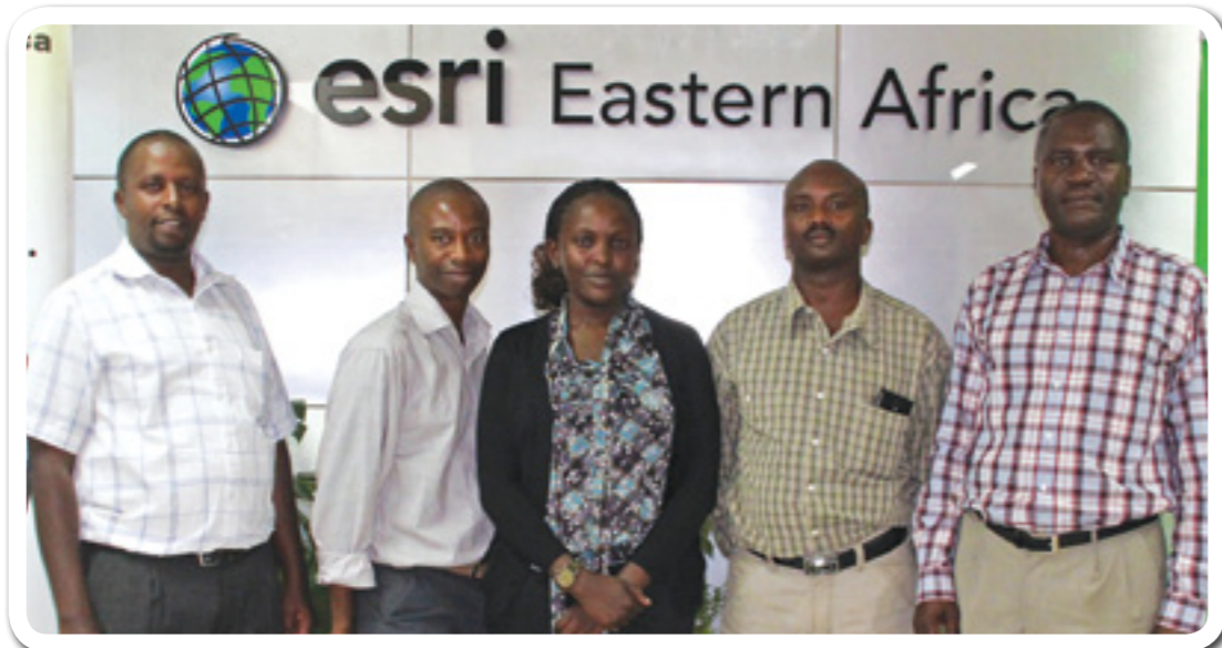
Rhino Ark and KWS staff with instructor at ESRI training facility in Nairobi

The setup of the server is completed and the training on the multiple modules of the system is near completed. The system is expected to be operational towards the end of April 2014.