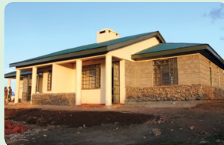
The completed energizer house