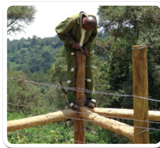
Rehabilitation of Phase One, between Mitero Gate and Wandare Gate. Fence technician building a new strainer assembly

The rehabilitation of Phase One underscores the long-term commitment of Rhino Ark to the conservation of the Aberdare ecosystem.