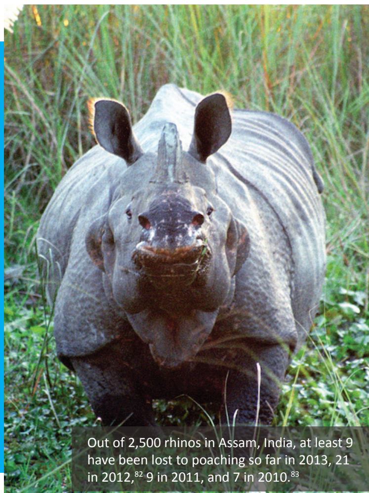
Out of 2,500 rhinos in Assam, India, at least 9 have been lost to poaching so far in 2013, 21 in 2012, 82 9 in 2011, and 7 in 2010. 83

The U.S. should consider trade sanctions against Vietnam for ongoing failures until it fully embraces its responsibilities to conserve rhinos consistent with CITES and enacts a ban on all domestic rhino trade.