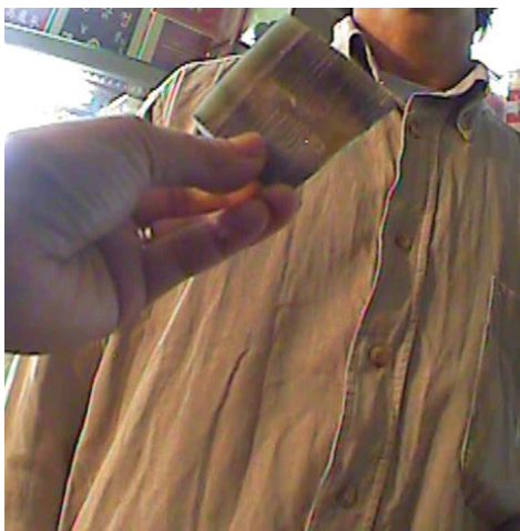
Undercover camera showing sale of rhino horn in Hanoi 2011

Clearly, Vietnam's failure to enforce its CITES implementing legislation and prosecute individuals involved in the illegal rhino horn trade is diminishing the effectiveness of CITES.