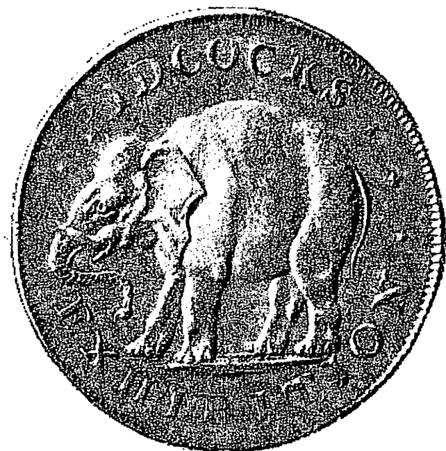
Figure 1 Pidcock elephant token, c.1795