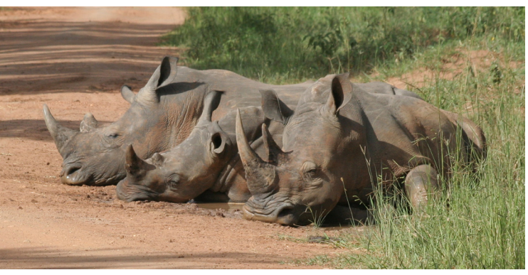
Ziwa rhinos will find any wet hole in which to cool down even alongside the main road.

By 2008 ZRS was receiving a mere 2,223 visitors,