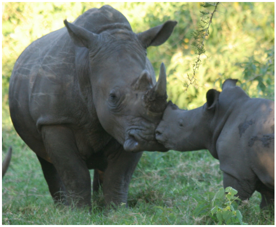
New calf Uhuru meets subadult male Justus for the first time.