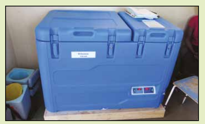
New fridge freezer for medicines and vaccines

This medical clinic serves the local community and continues to extend and improve its range of services. They have recently received a large chest freezer and fridge, for storage of vaccines and medicines, and a separate freezer containing freezer blocks for use