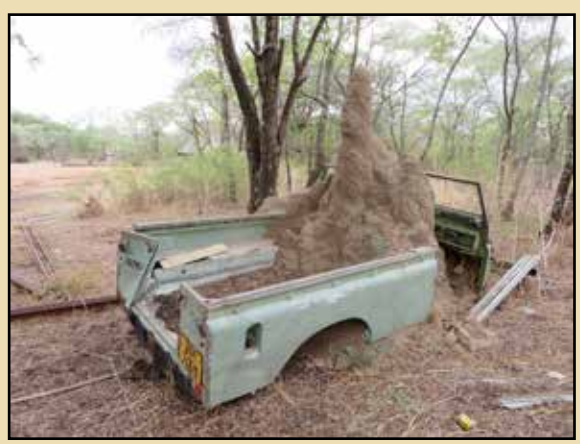
Termite mound - engulfing a Land Rover!

In the Paudale area the parents have been busy building so called 'farm bricks' out of termite mound clay. This clay has special properties which make it especially good for brick making.