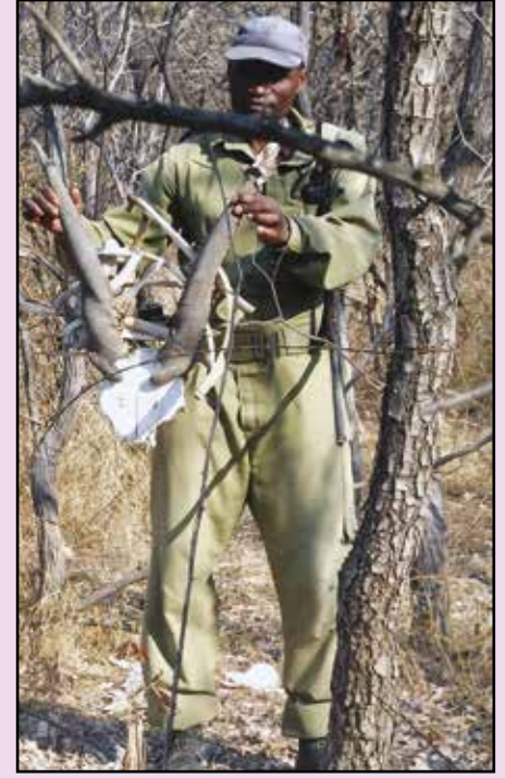
Remains of an Eland found in a snare

leave was All cancelled and two teams of monitors deployed, were tracking Rancy and leapfrogging each other to get in front of him. Then they would be able to try to head him off and turn him back. Five men had to camp out in the bush for several days continually looking for foot prints crossing the sand roads. This hampered by torrential rain washing away the spore. After five