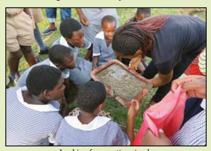
Looking for aquatic animals

The excitement in the children was mounting and they were then taken into the bush in the back of the centre's pick-up truck to the nearby Shari dam. The school had been asked to re-enact their award winning play and this was performed on large rocks with a back drop of the dam waters, true open air theatre. This was followed by a practical session demonstrating how water pollution can be assessed by monitoring the animal population in sludge sediments. Water and animals are always fascinating for children and a lot of fun and laughter was had by all.