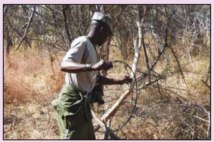
Removing a wire snare attached to a tree

Poaching of game is a constant threat. The rhino monitors and farm game guards are always on the lookout for wire snares set between trees along game trails. These are designed to ensnare the necks of antelope passing by. Poachers also use dogs to chase and wear down their targets. In November an exceptionally heavy penalty was given to a group of poaches caught in the conservancy. Rhino monitors gave evidence to help convict the men who were each fined USD 1500 and sent to prison for 8 months! – It is hoped that this will be a massive deterrent to other potential poachers.