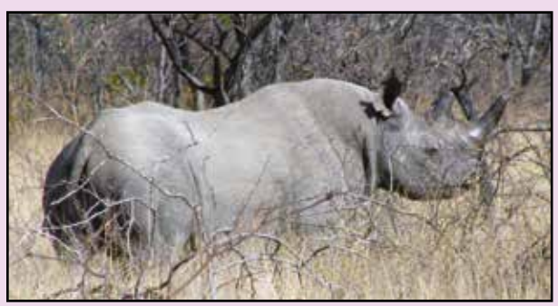
Tangarira photographed in the open

Guarding the black rhino involves hours of tracking, through rough terrain and thickets of thorn trees. Conditions can be extremely hot and dangerous. In very thick bush there is the constant risk of being charged by the rhino if the wind changes and they get your scent.