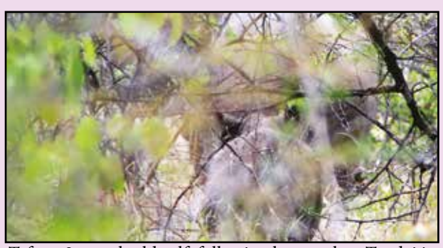
Tafara, 8 month old calf, following her mother, Tendai in very thick bush

After seeing the bull we continue the search for the mother and calf who have wondered off. In total we spend 9 hours on our feet, for me it's a one off, but for Misheck, and the other black rhino monitors, it's all in a day's work. It's these men led by David Strydom who we are to thank for the survival of our now six rhino in the conservancy. Without them these beautiful rhino would surely have been poached.