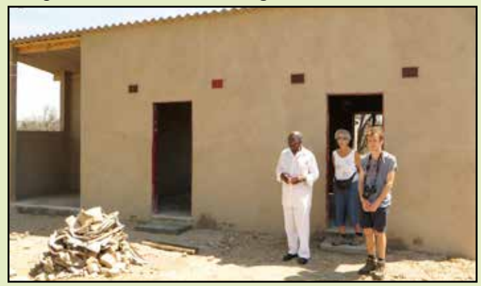
Nearly completed maternity waiting rooms

This medical clinic serves the local community and continues to extend and improve its range of services. They have recently received a large chest freezer and fridge, for storage of vaccines and medicines, and a separate freezer containing freezer blocks for use