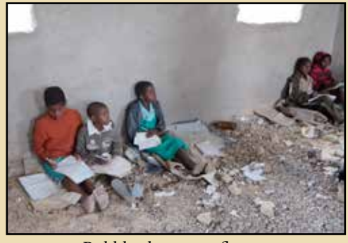
Rubble classroom floors

large classroom block up to the roof line in five days! Unfortunately, due to lack of funds, progress is slower at other schools. At Messina primary new brick staff houses were being built but the pole and mortar classrooms are deteriorating rapidly and they still have no water and many children sit on the