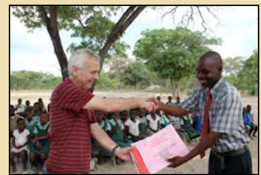
Exchange of letters at Rockvale school

We were struck by the warmth and enthusiasm of the school teachers, the beautiful singing voices of the children and their exuberance, especially when presented with shiny new footballs. Yet we were reminded of the harsh environment that the children and teachers face each day; with long walks to school, limited water supplies, many classrooms with no furniture at all, rubble floors and limited teaching resources, making learning and teaching an incredible task.