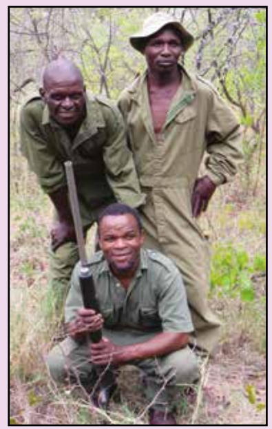
3 of the 9 rhino monitors

Life can get even harder for the monitors if a rhino decides to move out of their usual area. Rancy, for example, a 9 year old bull, has made a habit of travelling great distances, often trying to head out of the safety of the conservancy.