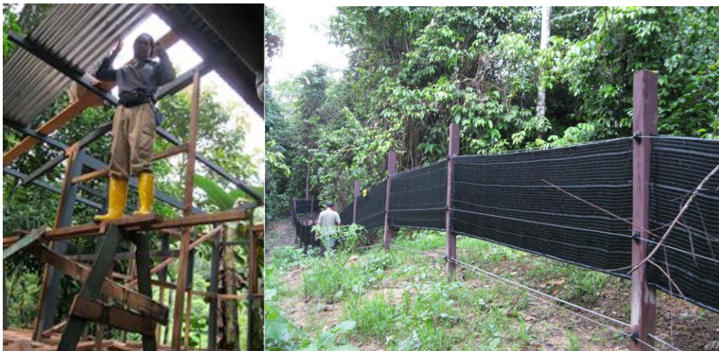
(left) construction of extra staff quarters space at Rhino Interim Facility (October), (right) completed additional rhino paddock at Rhino Quarantine Facility (RQF; November)