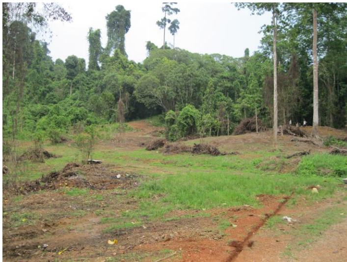
(left) example of a rhino food plant ( Leucosyke species) in trials at RQF, a fast-growing woody shrub favoured by the three rhinos at Tabin, (right) view of rhino food garden site (October 2012)