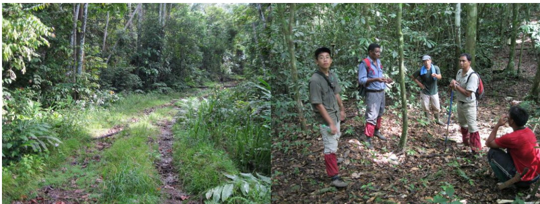
Several potential sites for a rhino holding facility at Danum Valley were assessed on 22-24 November and 12-14 December, including (left) an old logging road below Bukit Atur, and (right) the ridge east of the Danum Valley Field Centre (DVFC)