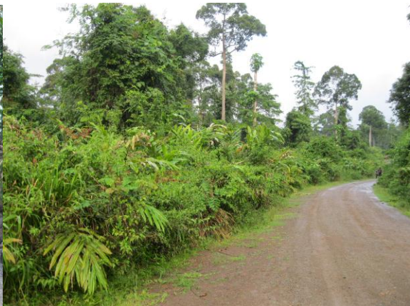
The approximately 2 hectare site selected for the Danum Valley rhino holding facility lies between the lower Kalisun river (left) and about 1.5 km along the existing road before reaching DVFC (right).