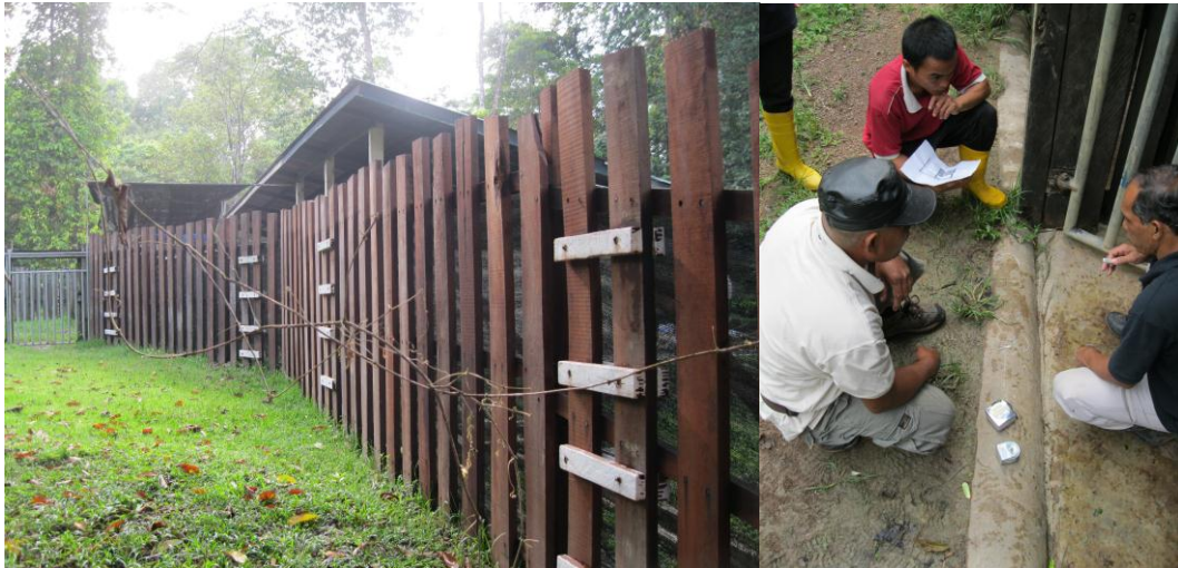
(left) rhino breeding yard, with added emergency keeper escape ladders in case of aggressive behaviour by Tam, (right) measuring for replacement of a swing door with a sliding door