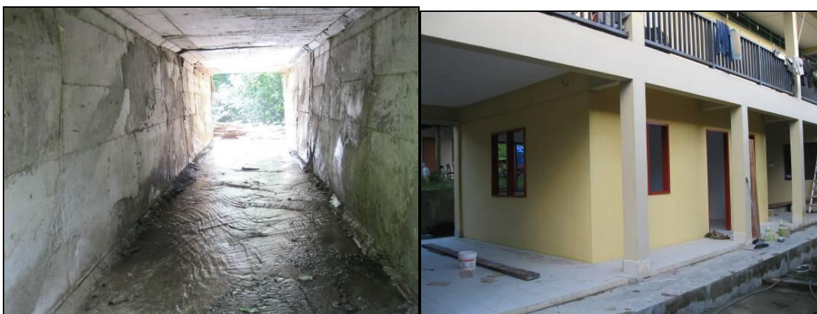
(left) view of the BRS access road box culvert (25 February), showing poor quality of workmanship, (right) new BORA office (24 February), located on the ground floor of Rumah Badak.