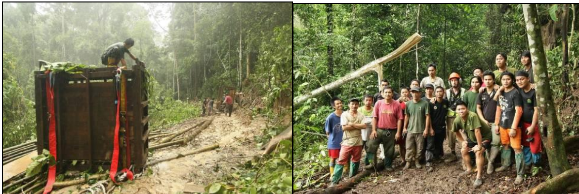
(left) continual rain throughout 24 December prevented the planned air lift site on that day, (right) having run out of food except for instant noodles, the trap site team pose for a photo before the airlift on morning of 25 December 2011