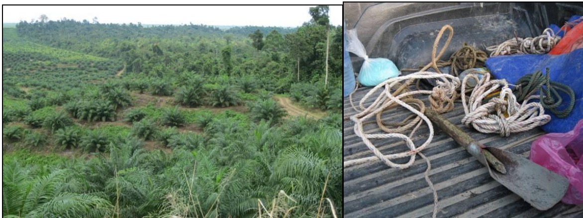
(left) the last remaining forest on dry land on the fringes of Kulamba Wildlife Reserve, and location of the proposed 2012 rhino trap site, (right) nylon rope snares traps, probably aimed at banteng rather than rhino, found and removed from the same forest.