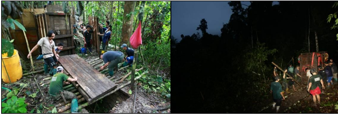
(left) preparations for moving Puntung from the temporary forest stockade to the air lift site, 22 December 2011, (right) moving Puntung from the temporary forest stockade to the air lift site, dawn 24 December 2011