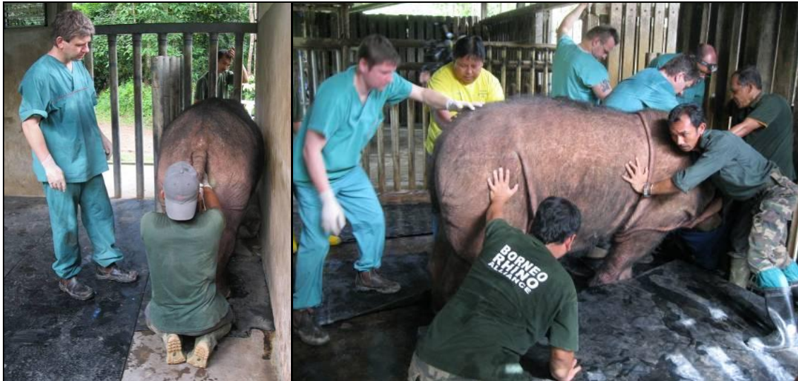
(left) the surprise finding that Puntung has a broken hymen (24 February), indicating that she has mated, (right) easing Tam onto a mattress after anaesthetisation and prior to electro-ejaculation (25 February)