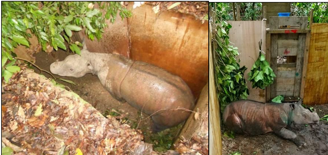
(left) trap number 6, built on one of Puntung's ridge top trails, was completed 16 December, and Puntung fell into the trap on night of 17-18 December, shown here morning of 18 December before opening the plywood and walking her into a quickly-erected adjacent stockade (© Zainal Z Zainuddin/BORA), (right) Puntung in the temporary forest stockade, 20 December (© Abdul Hamid Ahmad/BORA).