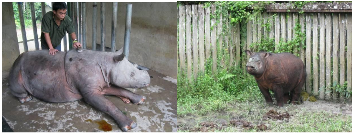
(left) paddock team leader Alvin Erut brushes Gelogob's skin, (right) Tam defaecates at the same spot as does Gelogob, indicating that wild rhinos may communicate each other's presence by means of finding and monitoring dung piles (both pictures February 2011)