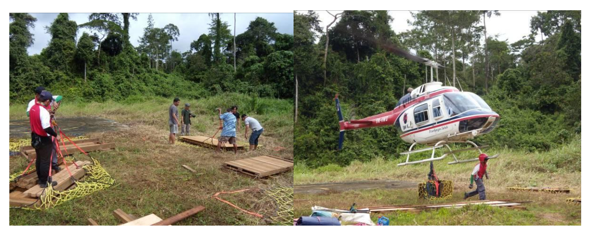
(left) preparation of materials to be brought to the Malambabula site for construction of a third and fourth trap for Puntung, (right) air lift of materials to the third and fourth trap site (20 December)