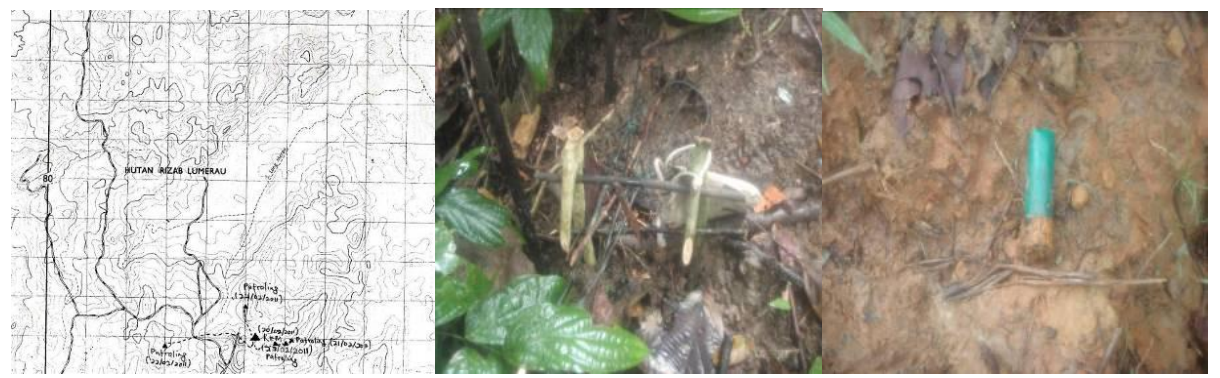
Location of 20-25 February patrol, with example of a snare trap and a shotgun cartridge found in this area