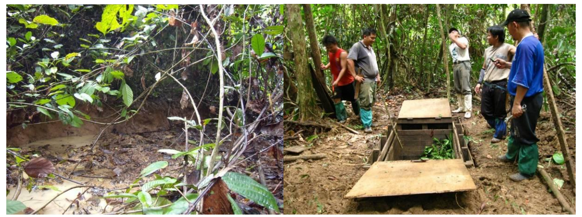
(Left) A mud wallow used by Puntung at Malambabula, (right) new trap for Puntung (trap 4, near to a rhino wallow), in process of construction, 20-22 January.