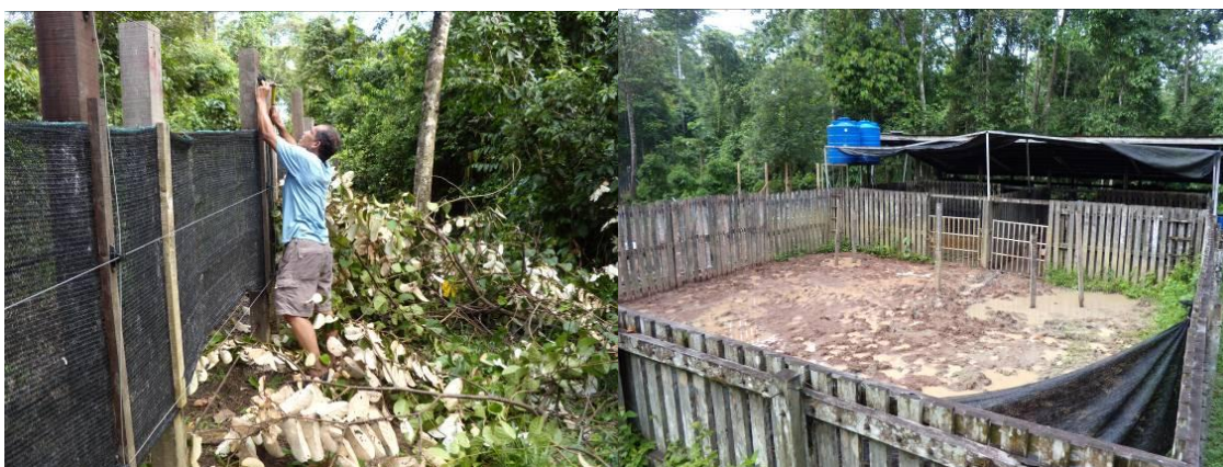
(Left) Repair to the interim rhino paddock fence, damaged by a branch fall. (Right) A temporary breeding paddock (optimistically assuming Tam and Puntung may get together before the permanent BRS construction) was made in July by modifying two old (1990s)