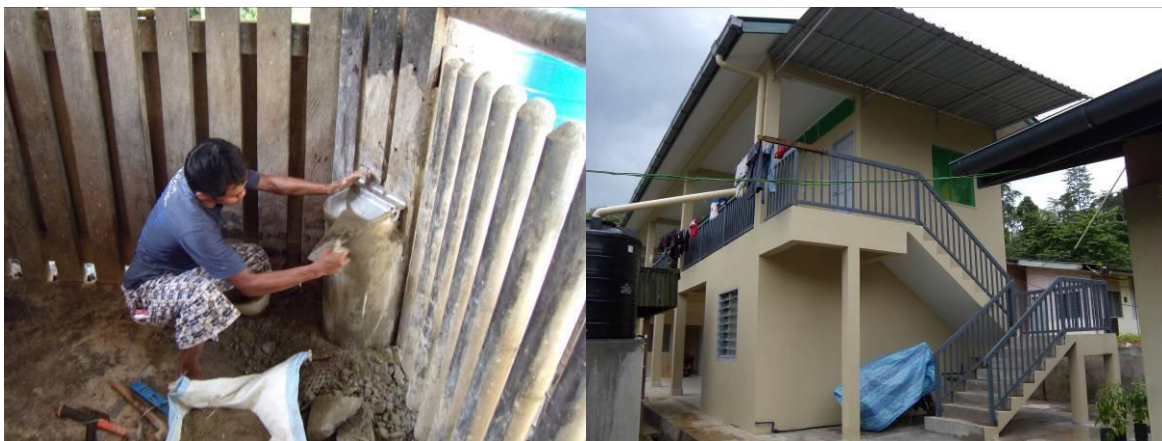
(Left) Installation of drinking water dispenser in the night stalls, to minimize both wastage and fouling of rhino drinking water. (Right) Completed Rumah Maitap accommodation for BORA field staff.