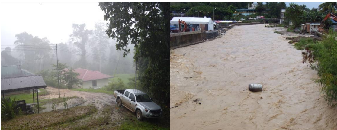
(Left) Tabin experienced frequent rain through the reporting period. (Right) Lahad Datu town, 11 September.