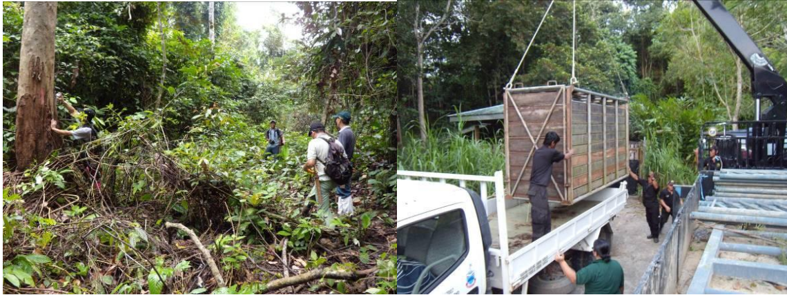
(Left) Surveying the proposed access road to the permanent Borneo Rhino Sanctuary breeding facilities site (done collaboratively by Sabah Forestry Department, SWD and BORA). (Right) Gelogob is loaded onto a truck, 1 September, for relocation to TWR interim rhino facilities.