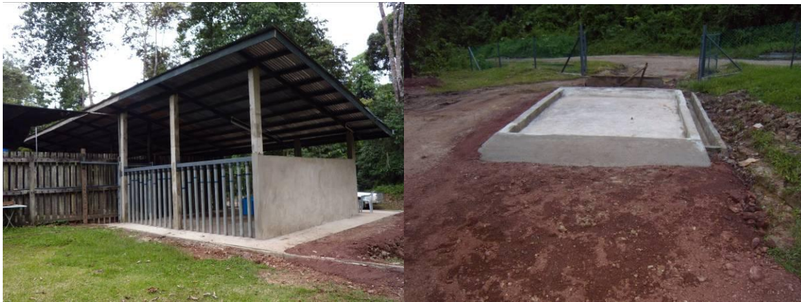
(Left) New night stall for Gelogob. (Right) Disinfectant tyre bath at entrance to rhino interim facilities.