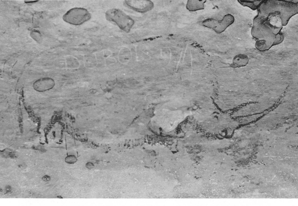
24. The Breuil Gallery: the mother "Dubois" rhinoceros

25. The Breuil Gallery: The father rhinoceros at the end of the frieze