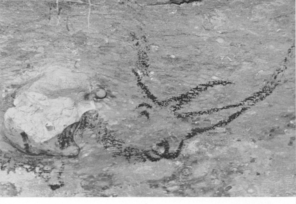
26. The Breuil Gallery: detail of the head of the "Dubois" rhinoceros

27. The Breuil Gallery: horse's head, painted on a flint "kidney," using the natural relief