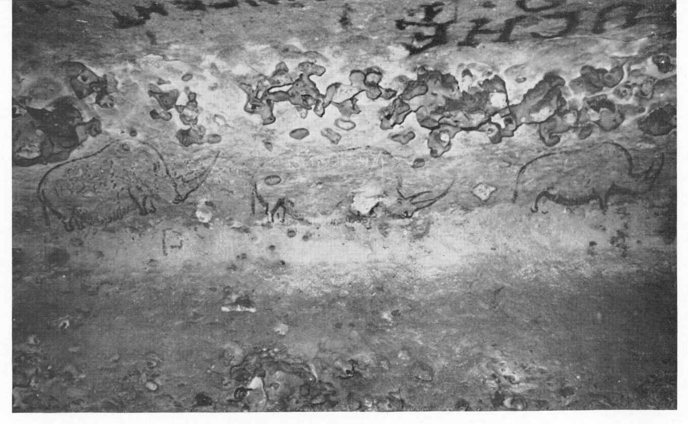
23. The Breuil Gallery: the family of three rhinoceroses