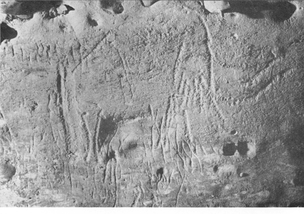
20. Deeply engraved mammoth on the left side of the Sacred Way

21. The Paolo Graziosi rhinoceros engraved on the roof before the Breuil Gallery