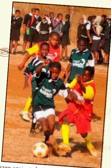
Using soccer to impart a message against rhino poaching and engage the attention of children in communities bordering game reserves.

The Project Rhino KZN / Kingsley Holgate Foundation partnership will continue in 2014 with the goal of reaching 200,000 children in all African rhino-range states and using their messages as a world-wide call to action against rhino poaching.