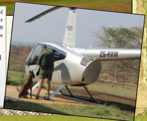
Right: combining ground operations with aerial support is one of ZAP-Wing's strengths. Here, rhino tracker dogs receive training.

"Every ZAP-Wing flight over my game reserve saves the life of at least one rhino - two if it happens to be a cow and calf." Game Reserve Manager, member of the Zululand Anti-Poaching Wing