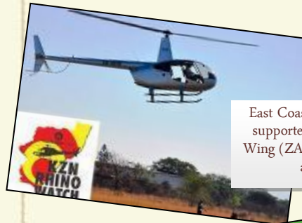
East Coast Radio's Rhino Watch —strong supporter of the Zululand Anti-Poaching Wing (ZAP-Wing), Ezemvelo KZN Wildlife and Project Rhino KZN.