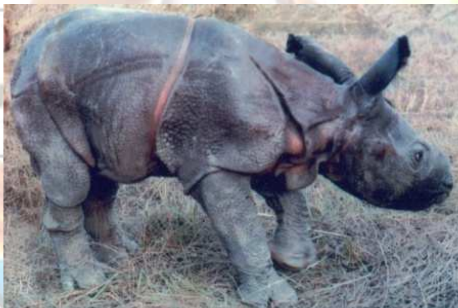
Fig. 3: One-month-old calf in RRA