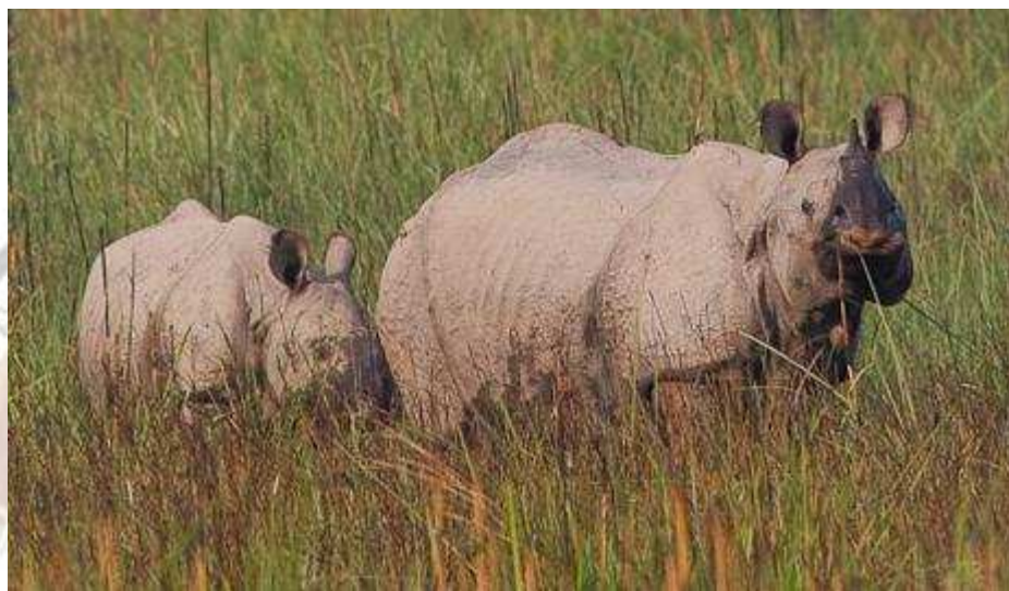
Fig. 2: A Cow with 2.6 year old calf in Grassland