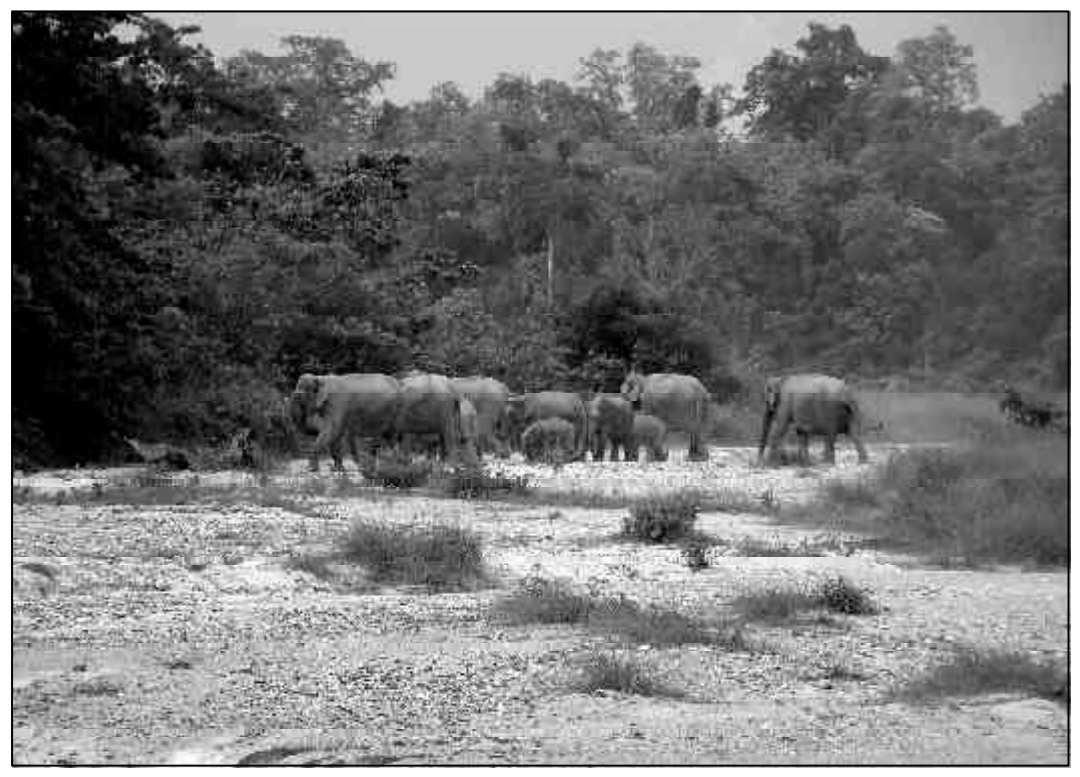
An elephant herd

of weeds from glades and wetlands, soil conservation, etc. are performed.