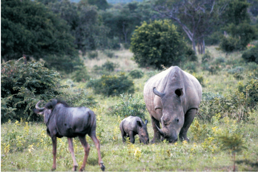
Fig. 1. Southern white rhinoceros female 2 (Fig. 2b) with a four-day-old newborn calf in Lapalala Wilderness, South Africa

reactive progesterone metabolites using an enzyme immunoassay (EIA) for 5\alpha -pregnan- 3\beta -ol-20-one, which has been shown to provide reliable information on reproductive steroid hormone pattern by reflecting total progestagens in different mammalian species (Szdzyu et al. 2006; Ahlers et al. 2012). The EIA used a polyclonal antibody against 5\alpha -pregnan- 3\beta -ol-20-one-3-hemisuccinate-BSA and 5\alpha -pregnan- 3\beta -ol-20-one-3-hemisuccinate-peroxidase label (Szdzyu et al. 2006). Cross-reactivities of the antibody used are described by Szdzyu et al. (2006) and were as follows: 5\alpha -pregnan- 3\alpha -ol-20-one, 650%; 5\alpha -pregnan- 3\beta -ol-20-one, 100%; 4-pregnen-3,20-dione, 72%; 5\alpha -pregnan-3,20-dione, 22%; <0,1% for 5\beta -pregnan- 3\alpha ,20 \alpha -diol, 4-pregnen-20 \alpha -ol-3-one, 5\beta -pregnan- 3\alpha -ol-20-one, 5\alpha -pregnan-20 \alpha -ol-3-one, 5\alpha -pregnan- 3\beta ,20 \alpha -diol and 5\alpha -pregnan- 3\alpha , 20 \alpha -diol. EIAs were performed following Prakash et al. (1987). Sensitivity (90% binding) of the assay was 4 pg/well. Intra- and interassay coefficients of variation, determined by repeated measurements of high and low value quality controls ranged between 9.3% and 16.5%. To adjust for water content variations, FPM concentrations were expressed as mass/dry mass of faecal extract.