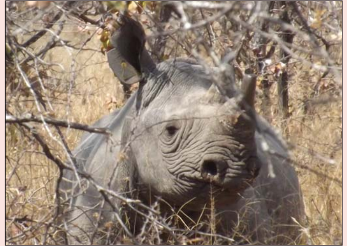
Tendai 9 yr old female