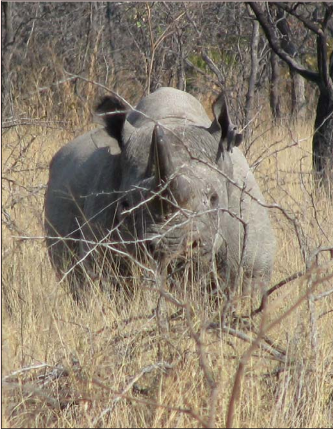
Tangarira 44 yr old male