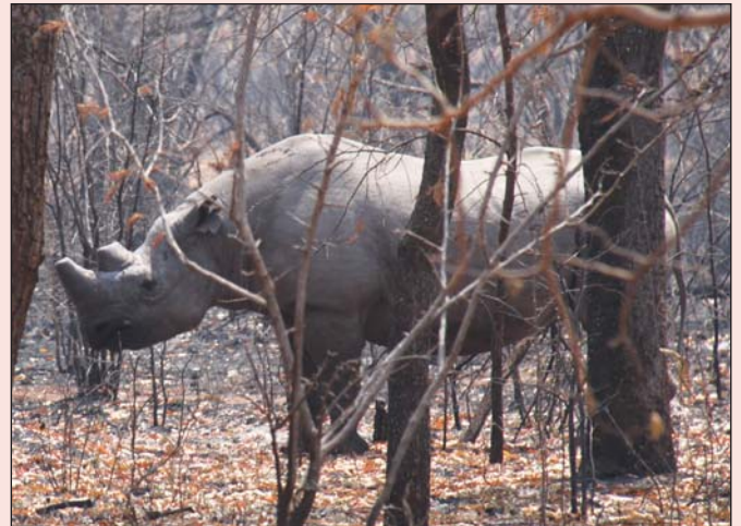
Tsaka 9 yr old male