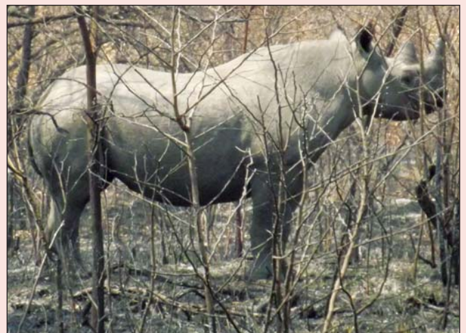
Ronda 5 yr old female