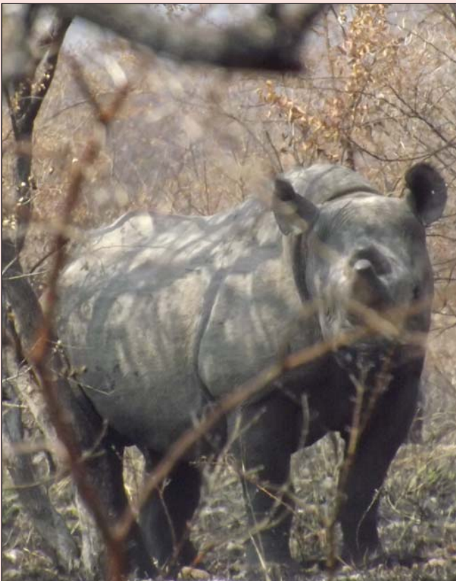
Ranzi 8 yr old male