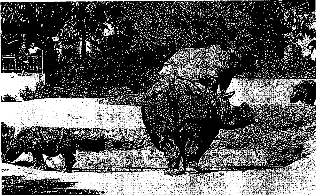
FIGURE 2. This spacious outdoor enclosure for the rhinos at Basle Zoo is regarded as the minimum area which will permit freedom of movement of the animals.

Establishing the minimum accommodation requirements and defining the optimum conditions: In Basle, the Indian rhinos are kept in three stalls, each 4.5 \times 5.7 m. The floors are fitted with "Stallit" stall tiles which possess a heat conducting coefficient closely corresponding to that of wood. The walls are made of concrete, but, as the rhinos frequently lean against them, they have been lined with vertical wooden boards to reduce loss of heat. Moreover, the boards reduce the tendency of the animals to rub their horns against the wall, though this habit disappears altogether when a cow has a calf. Next to the row of stalls is a