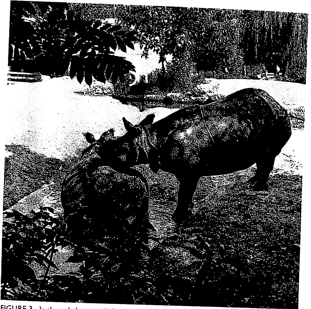
FIGURE 3. In the prelude to copulation, the cow and the bull are seen to remain close to one another without aggressive interactions.

We feel that Indian rhinos adapt easily to zoo life. However, the importance