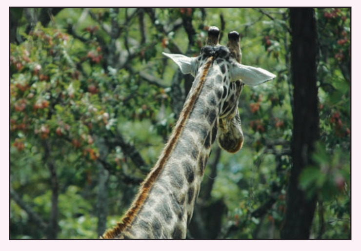
Old Bull Giraffe

The easiest wild animal to see in the long grass was this old bull giraffe who wondered across the road when we were out on our travels. The new borehole at Chiwodza School is making a huge difference to a very isolated community.