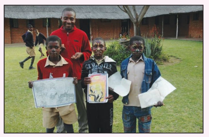
Winners of the Education Art Prize