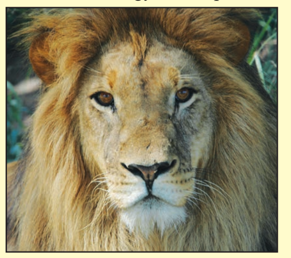
The orphaned lion we met on the way home

The trust is an amazing charity I really appreciate what a difference it is making in the community and all it is doing to protect the black rhino. I would love to visit again and I have renewed energy and inspiration to do all I can to help the charity.