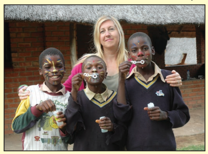
Fun with face paints on camp

During my trip we visited 3 schools. I joined in with one of the camps at the education centre with the children from Pauldale School. I spent a day at the health centre and we were able to travel around the conservancy.