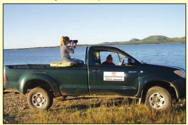
Admiring the view over Lake Sebakwe