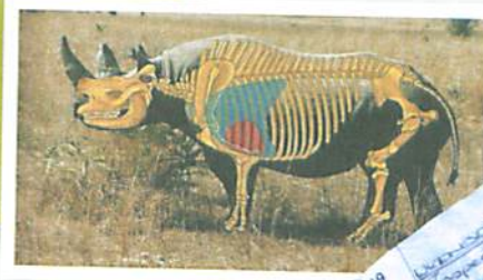
FACIUS DE WET

A model of a black rhino is used to demonstrate anatomy, and to illustrate where to look for bullets