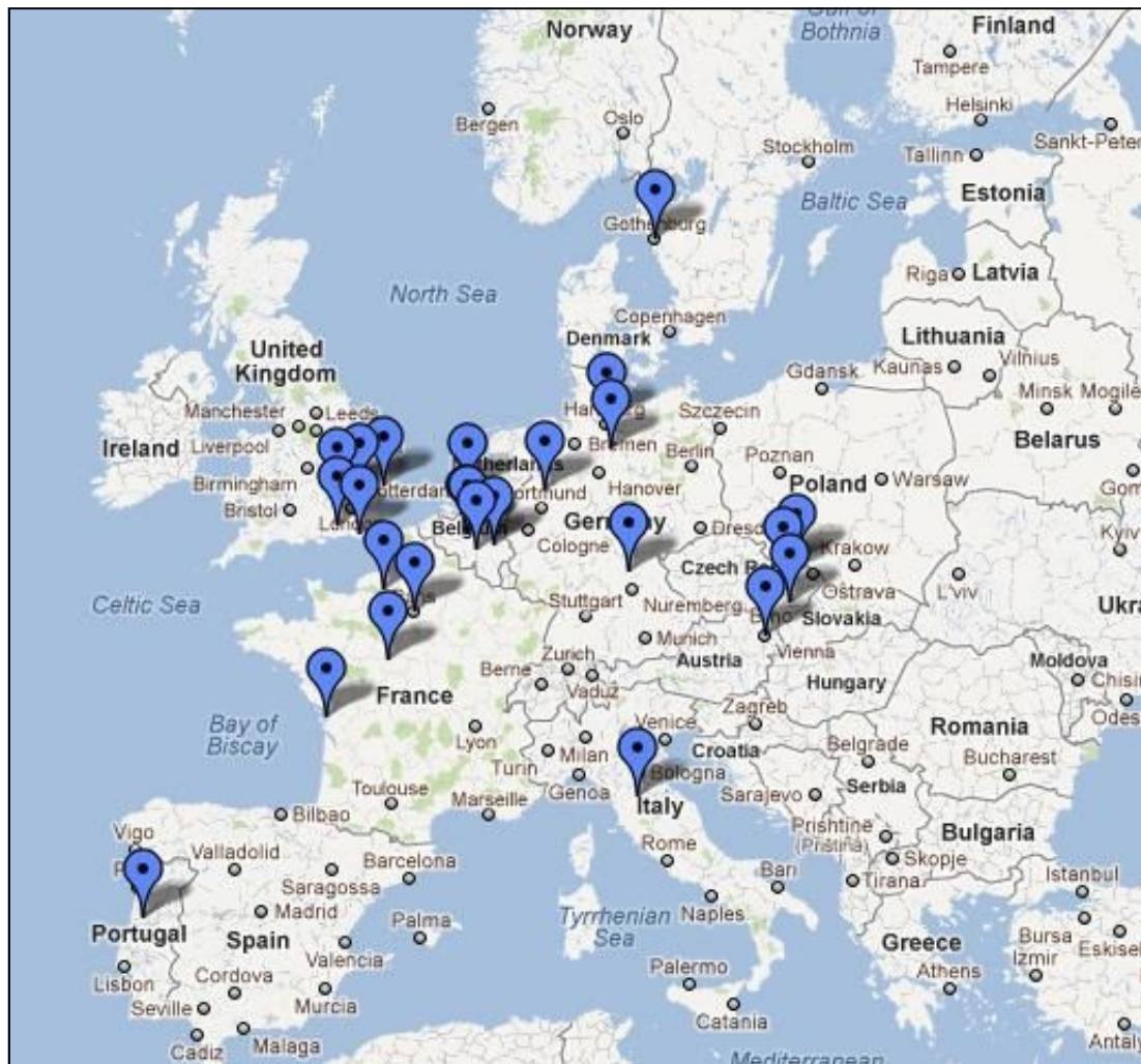
Fig. 2. Location of thefts or attempted thefts of rhino horn in Europe from 31 st December 2010 to 31 st December 2011. Derived using Google Maps, interactive map with data available at: http://g.co/maps/e29k8