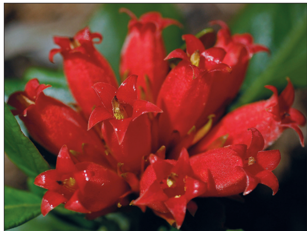
Fig. 1. Flower of Burchellia bubalina .

Burchell is credited with having been the most prolific collector of botanical and zoological specimens, and one of the most scientific of the collectors of that era. In South Africa, he collected 50 000 specimens of plants, seeds and bulbs, and 10 000 specimens of insects, animal skins, skeletons and fish. He painstakingly categorised, described and often drew his specimens; his notes included the exact location, morphological features and habitat of the plants and animals. 2 His botanical collections and catalogue are now at the Royal Gardens in Kew, and his animal collections and catalogues at the Oxford University Museum of Natural History. He was elected a Fellow of the prestigious Linnaean Society when he was only 22 years