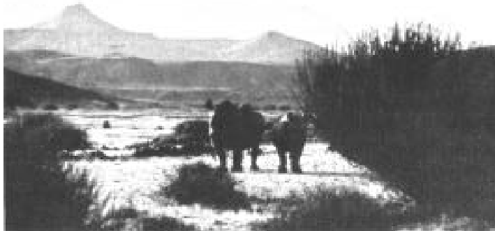
Black rhinos in Damaraland with food plant in foreground, Euphorbia damarana [B.D. Loutit]

Elephant and rhino feeding routes are found deep into the true desert in sand-dune country, and elephants have been seen on the beaches of the cold Atlantic coast.