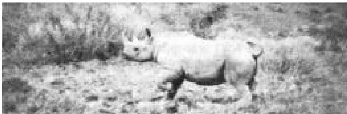
Black rhino cow running over rocky terrain in Damaraland [B.D. Loutit]

2 ♂ adults 2 ♀ adults 2 of unknown sex 1 ♀ sub-adult 1 ♂ calf 2 or more others [6 individuals photographed] [4+ in extreme desert]