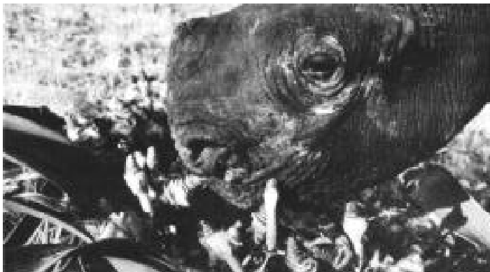
Black rhino calf feeding on Welwitschia mirabilis seed cones in Damaraland

The aridity of the terrain suggests that the black rhinos here would occupy much larger home ranges than in other parts of Africa. The condition of the rhinos appears to be consistently good and recruitment rates are good. This applies to rhinos in general in Damaraland and those last few surviving in Kaokoand.