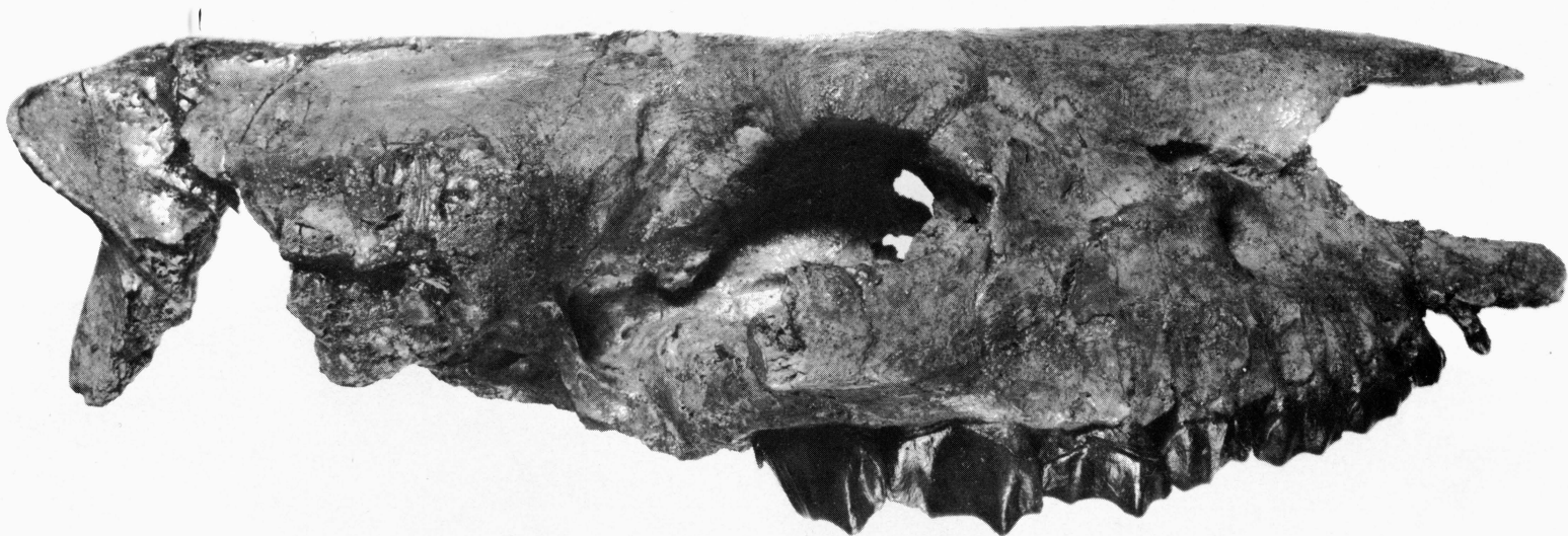
Fig. 30 Subhyracodon sagittatus Russell, sp. nov., SMNH P1635.2, holotype, showing right I 3 , P 1 to M 3 ; right lateral view, × 0.75.