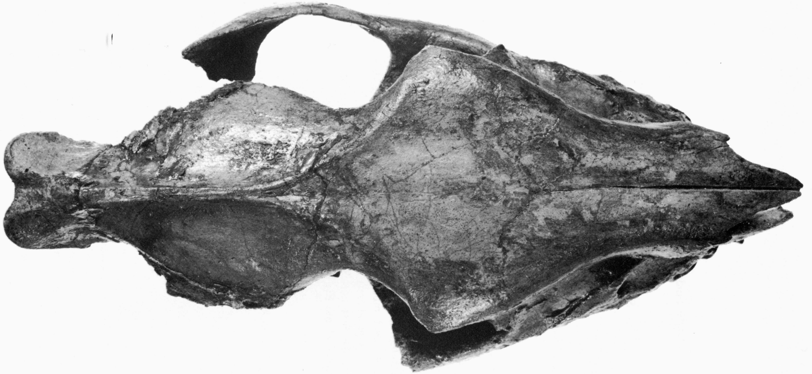
Fig. 29 Subhyracodon sagittatus Russell, sp., nov. SMNH P1635.2, holotype, nearly complete skull; dorsal view, \times 0.75 .