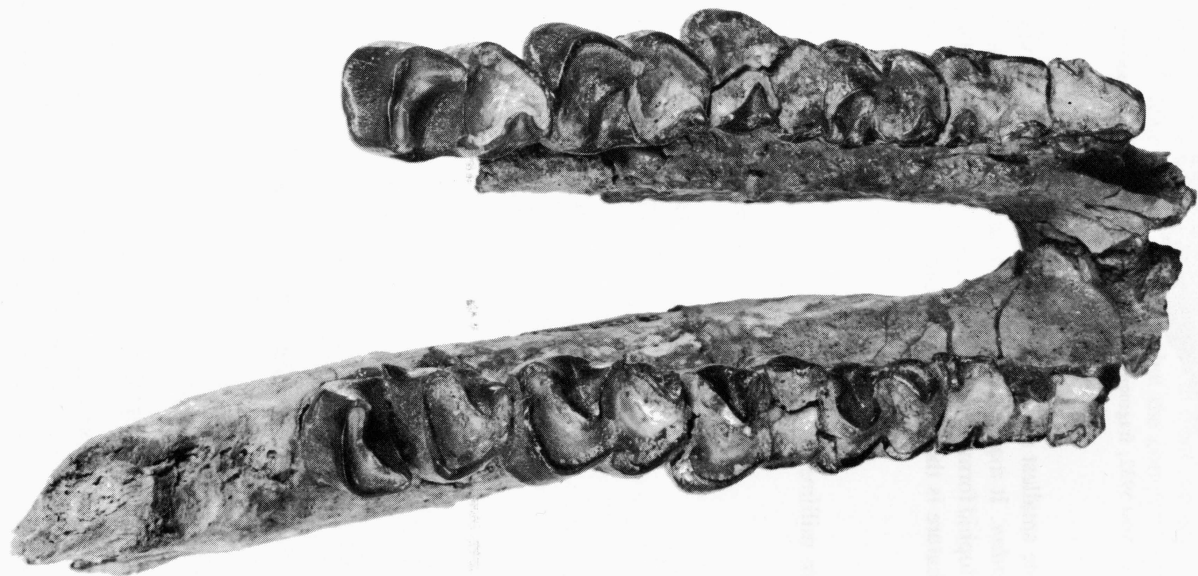
Fig. 28 Trigonias? sp., ROM 23183, incomplete mandible with left and right P 2 to M 3 ; occlusal view, × 1.