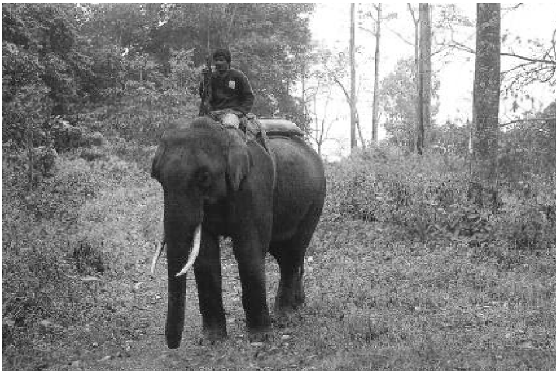
Only eight elephants are able to patrol in Orang Wildlife Sanctuary as the other four working elephants presently have young calves.

Similarly, the budget for Orang Wildlife Sanctuary reached a recent high of 3,888,169r ($230,752) in 1989/90, but by 1996/7 the budget was only 3, 179,626r ($88,866), just 38% of the 1989/90 budget when converted into US dollars. As a result, there has been almost no maintenance for the Sanctuary. Lack of funds has led to the worst rhino poaching in Orang for any area in Assam since 1995.