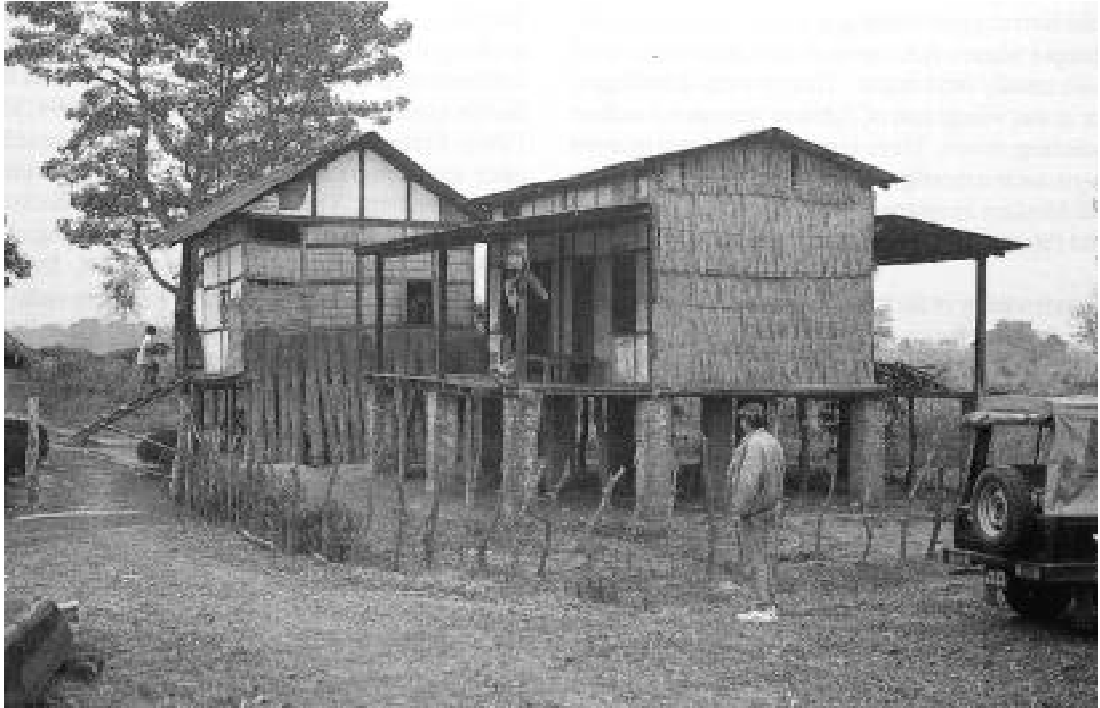
Camps in Pabitora Wildlife Sanctuary are in disrepair with leaking roofs and collapsing walls, while inside many of the forest guards sleep on the floor without mosquito nets, making conditions hard.