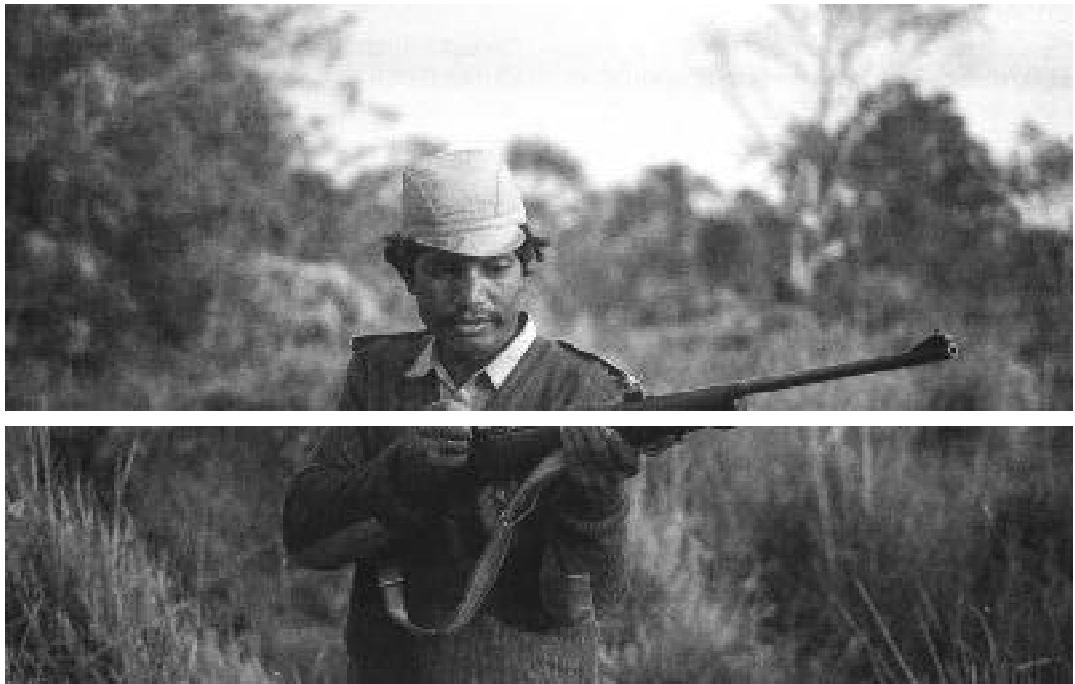
A forest guard in Pabitora Wildlife Sanctuary examines his .315 calibre rifle, but many of the petrol staff do not have guns due to a shortage.