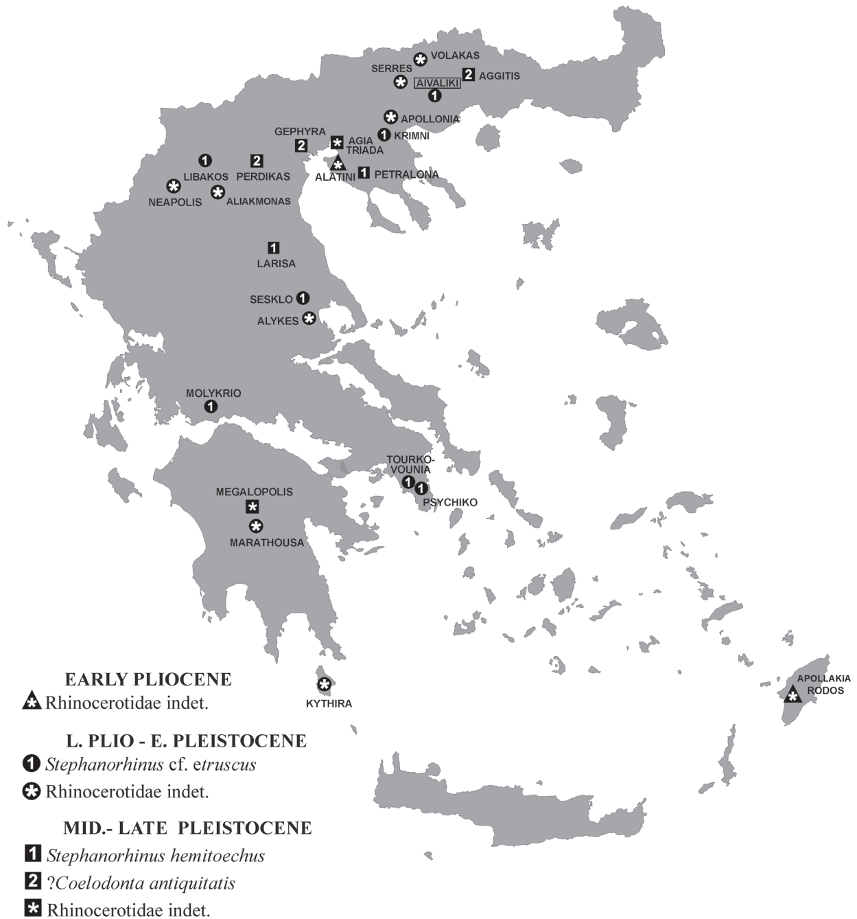
Figure 2: Distribution of the family Rhinocerotidae in Greece during the Pliocene and the Pleistocene.