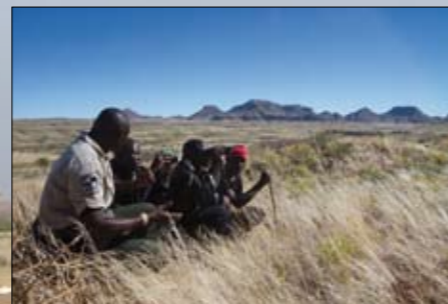
On patrol on day three of training