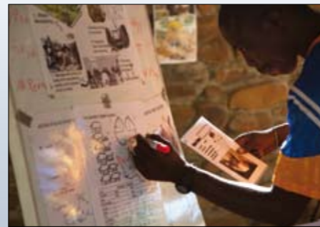
A trainee marks ear notches on id form