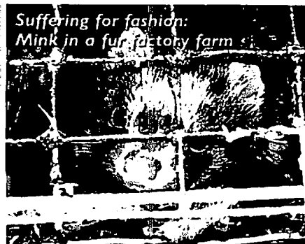
Suffering for fashion: Mink in a fur factory farm

For more details call Respect for Animals on 01159 525440.