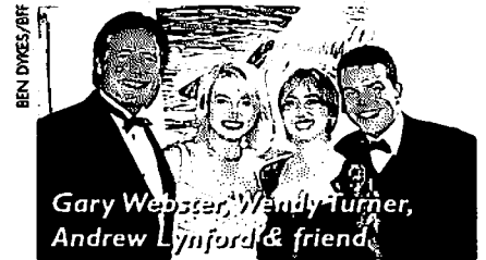
Gary Webster, Wendy Turner, Andrew Lynford & friend

as the auctioneer and added to the merriment; Joanna Lumley hosted our 'Save the World' Game; and Helen Worth, Philippa Forrester, Mark Williams, Sally Gunnell, Andrew Lynford, Wendy Turner, Gary Webster, Rula Lenska and Stuart Miles helped pull winning raffle tickets. A magnificent £80,000 was raised on