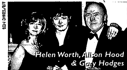
Helen Worth, Allison Hood & Gary Hodges

At the Born Free Ball in Brighton in April, a wild time was had by all. Over 400 guests joined in the fun including many celebrity friends: Martin Clunes raised over £50,000