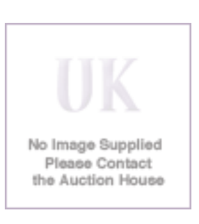
Lot: 132 A bamboo walking stick with horn handle and white metal ferrule, a ladies walking stick and a cane (3). Estimate: £30.00 - £40.00