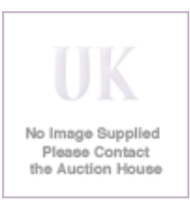
Lot: 130 A walking stick with eagle handle, another with Continental silver top and four others (6). Estimate: £20.00 - £40.00