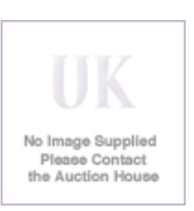
Lot: 131 Six 19th century parasols, two with carved bone handles. Estimate: £50.00 - £80.00