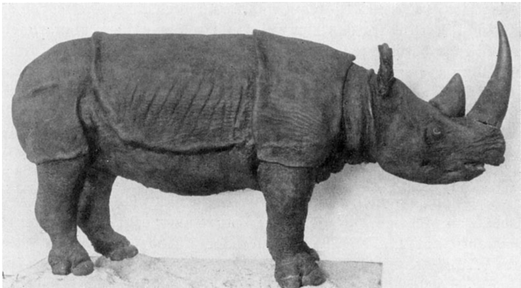
Fig. 5. Photograph of a mounted rhinoceros published by Zukowsky (1965: 135), supposedly taken by Dr Erna Mohr in the Zoological Museum in Vienna. As there has never been a specimen of this description in Vienna, this must in fact be a photograph of the type-specimen of Rhinoceros cucullatus in Munich (compare with Fig. 6).

rich Sander proposed that it was a captive specimen drowned in the Rhine near Mannheim around 1770: "Vor einigen Jahren sollte ein Rhinoceros, das 2 Hörner hatte, und lange in Teutschland herum-geführt worden war, bei Mannheim auf dem Rhein fahren, das Boot schlug um, und das Thier ersoff im Wasser. Man hat es aufgefischt, und für das sehenswürdige Kabinet des Churfürsten ausgestopft [A few years