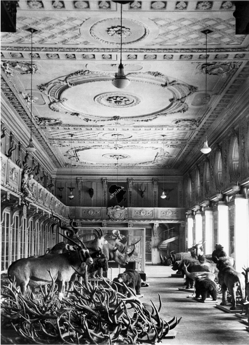
Fig. 6. The skeletons and mounted animals in the “Afrikasaal” in the Zoologische Staatssammlung in Munich, taken just before the intended evacuation in 1944. The specimen of Rhinoceros cucullatus is seen in the back of the room on the right.

ago, a double-horned rhinoceros, which had been shown for many years in German cities, was taken on a boat on the Rhine near Mannheim. The boat capsized and the animal drowned. The body was recovered and mounted for the important cabinet of the Elector]” (Sander 1779: 8). The account of the accession of the rhinoceros provided by Hamilton