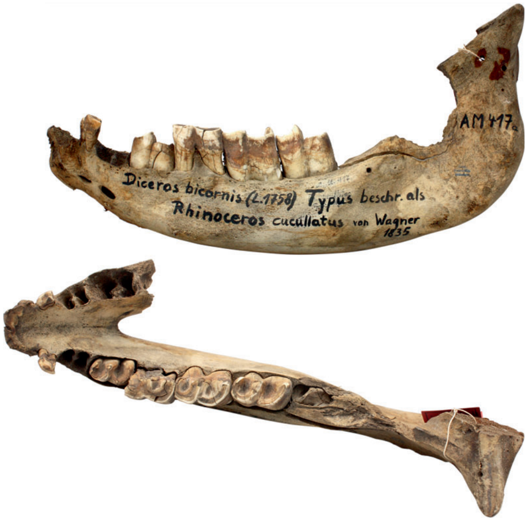
Fig. 8. The only remains of the type of Rhinoceros cucullatus , being part of the lower jaw removed from the mounted specimen some time before 1944.

scientific and popular books, while the evidence on the double-horned rhinoceros was not yet generally available. When Bruce heard about the existence of a rhinoceros in Ethiopia during his travels in 1770, he would naturally have expected to see an animal which looked like Rhinoceros unicornis . This led him astray in his recollections. It is quite likely that he did not actually take much pains to examine the rhinoceros which was killed by his party, beyond noticing the fact that there were two horns on the head. He did not make any sketches, and the animal might have been quickly cut up by the hunters. When he came to write up his adventures, at least ten years later,