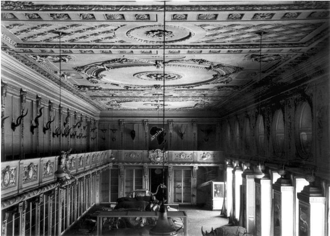
Fig. 7. A second perspective of the Africa Collection in Munich in 1944, with a partially obscured view of Rhinoceros cucullatus.