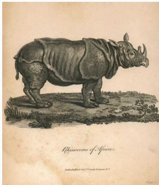
Fig. 1. “Rhinoceros of Africa” illustrating the account by James Bruce (1790b, V, facing p. 85). It was supposed to represent the rhinoceros killed near Tscharkin in Ethiopia, but in fact shows a copy of the plate of the Indian rhinoceros first published by Buffon (1764) with the addition of a posterior horn.

There is nothing particularly significant about this account of a rhino hunt in the book by Harris. However, he left a more personal account of the proceedings in the official report written on 17 April 1842 (Harris 1842). The encounter with the rhinoceros is found in two sections of this unpublished manu-