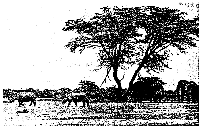
The rhinos nonchalantly depart and the elephants remain unmoved.

The lesions behind the shoulder of the rhino, referred to in this issue, are clearly evident on both rhino.