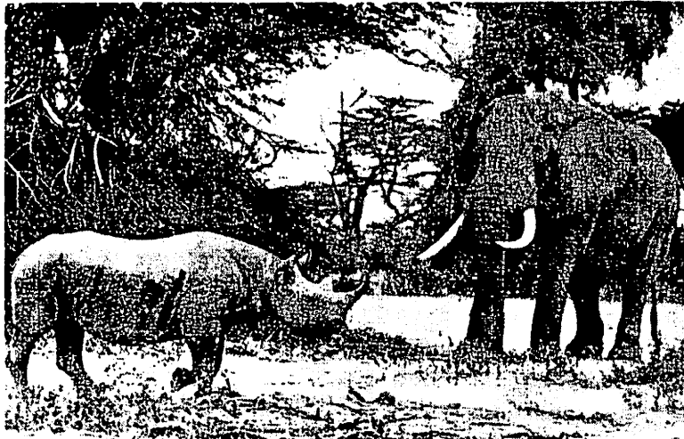
The rhino passes the elephant at a distance of 15 feet.