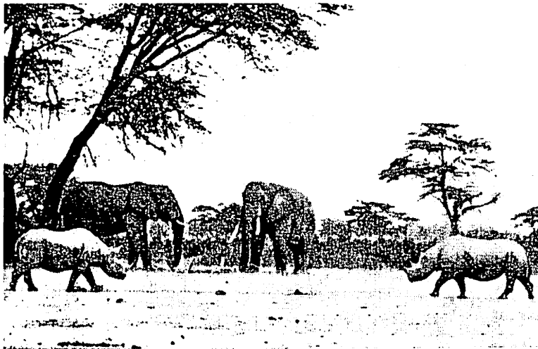
The rhino meets a friend.

Although passing within a few feet of each other these rhino and elephant in the Amboseli National Reserve ignore each other completely.