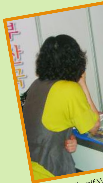
TANAPA's staff Visiting in the National Park in Korea's Busan To