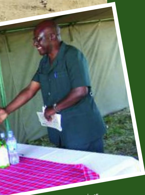
...hands with TANAPA's Project after presenting a brief report of the project.