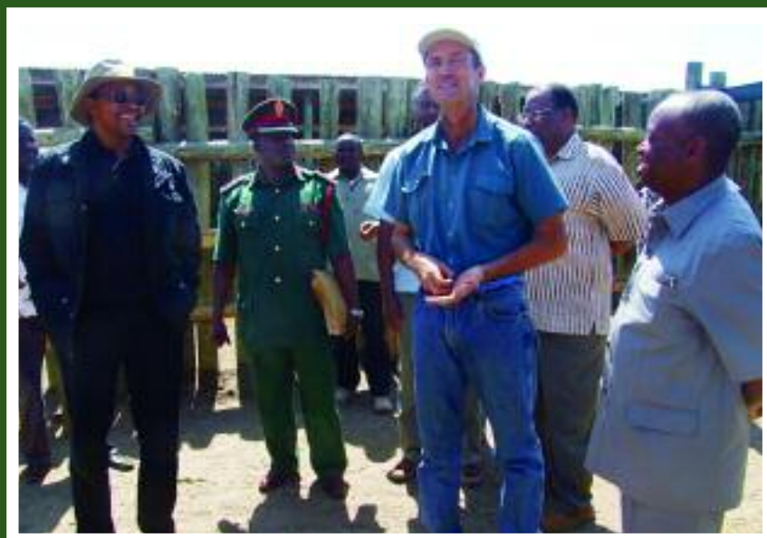
President Kikwete listening to one of the experts on the rhino project from South Africa