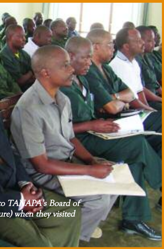
Members of TANAPA's Board of Directors (partially visible) when they visited