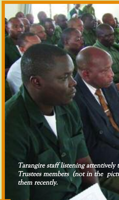
Tarangire staff listening attentively to Trustees members (not in the picture) recently.