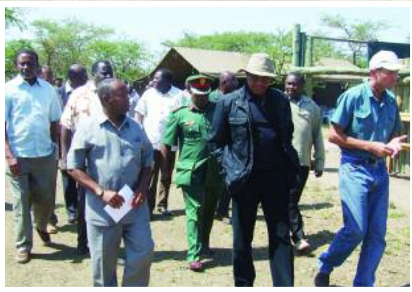
President Kikwete arriving at the rhino project site