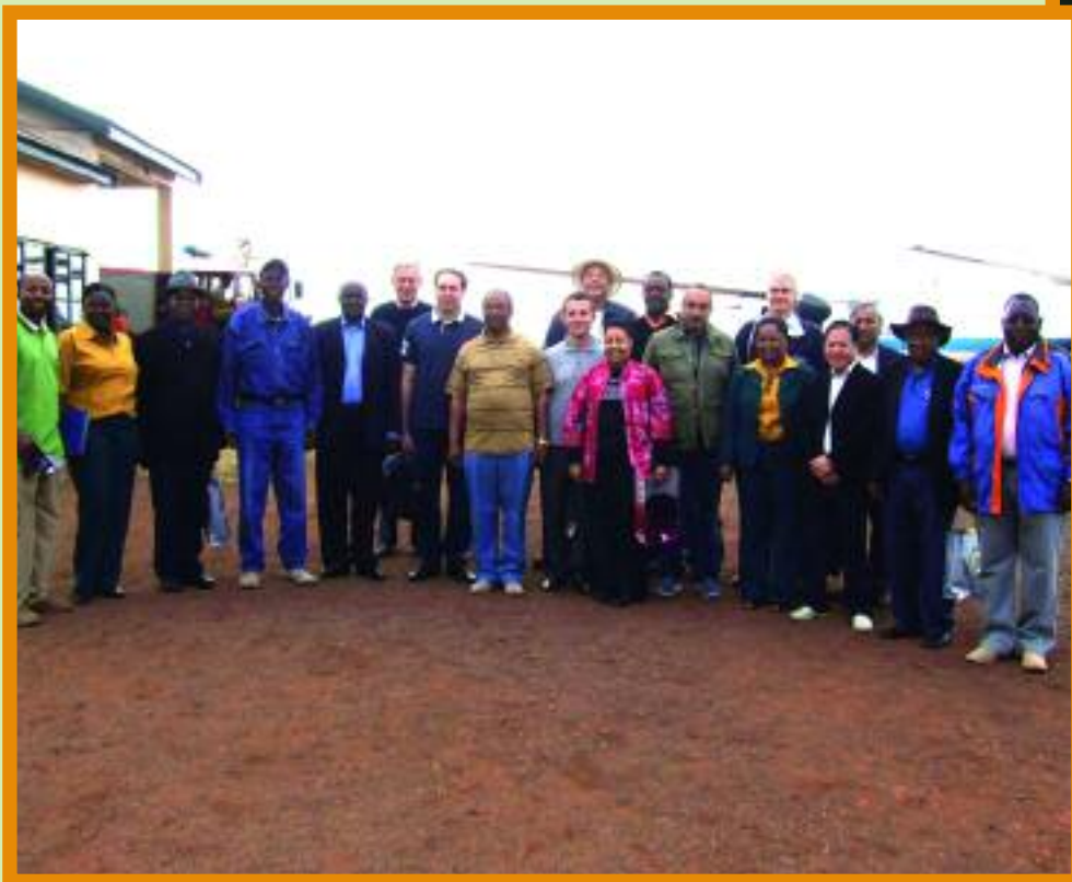
Tanzanians' Honorary Consulates abroad in a group picture with some of the TANAPA's staff when they toured Lake Manyara National Park recently.