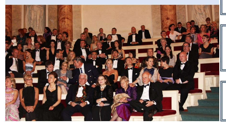
Hermitage Theater, St. Petersburg, Russia.