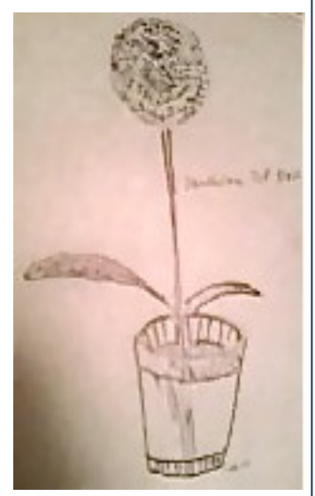
Drawing of Dandelion Puff Ball. Gold stem and platinum stamens topped by asbestos fibers, diamonds, nephrite and rock crystal, 7.5" height