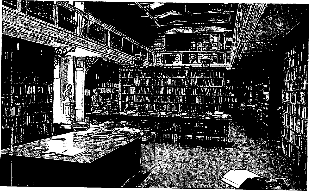
Fig. 3. Reading room of the Artis Library in 1988. The bust on the left represents G. F. Westerman and the one in the middle Charles Darwin.