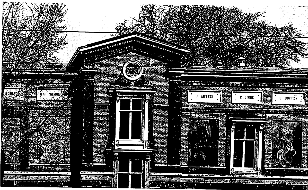
Fig. 4. Detail of the façade of the "fauna building" showing some of the marble plates with names of famous scientists.