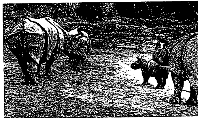
Indian rhinoceroses at Zoologischer Garten Basel.

Since the 1950s the species' captive propagation has markedly improved. Captive Indian rhinos now breed in third and fourth generation. Since the establishment of the species' studbook in the early 1970s, the captive population grew by about 90 percent to 130 animals in 1998. Nevertheless, the overrepresentation of certain lineages and high mean kinship are new problems to face. In