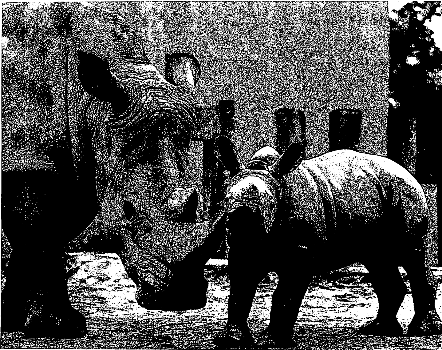
White rhino with calf at Allwetterzoo Münster.