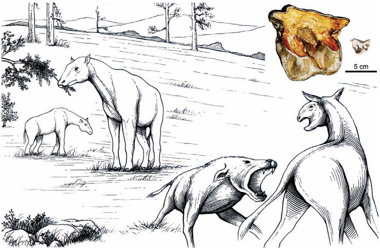
Fig.1 A habitat of giant rhinos during the Late Oligocene. In the foreground, a creodont ( Megalopteron sp.) is attacking a giant rhino calf ( Dzungariotherium orgosense ). The top right corner shows the comparison of the upper second molars between D. orgosense (left) and Ardynia altidentata (right) to the same scale.

south and north sides of the Tibetan Plateau indicate that the uplift of the plateau had no enough height to prevent dispersals of huge mammals, therefore giant rhinos, aprotodons and chalicotheres were free to migrate between the south and north sides of the “Tibetan Plateau.”