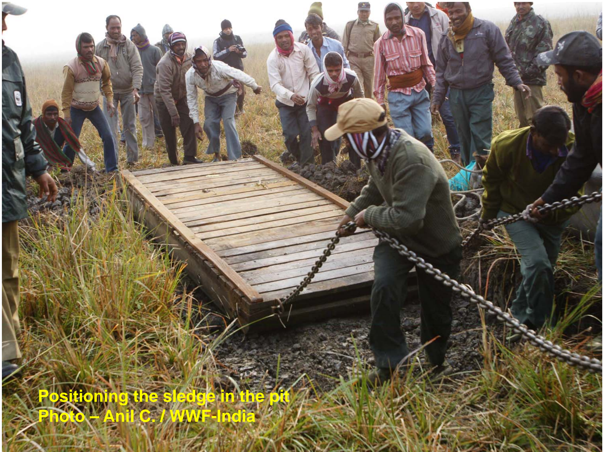
Positioning the sledge in the pit