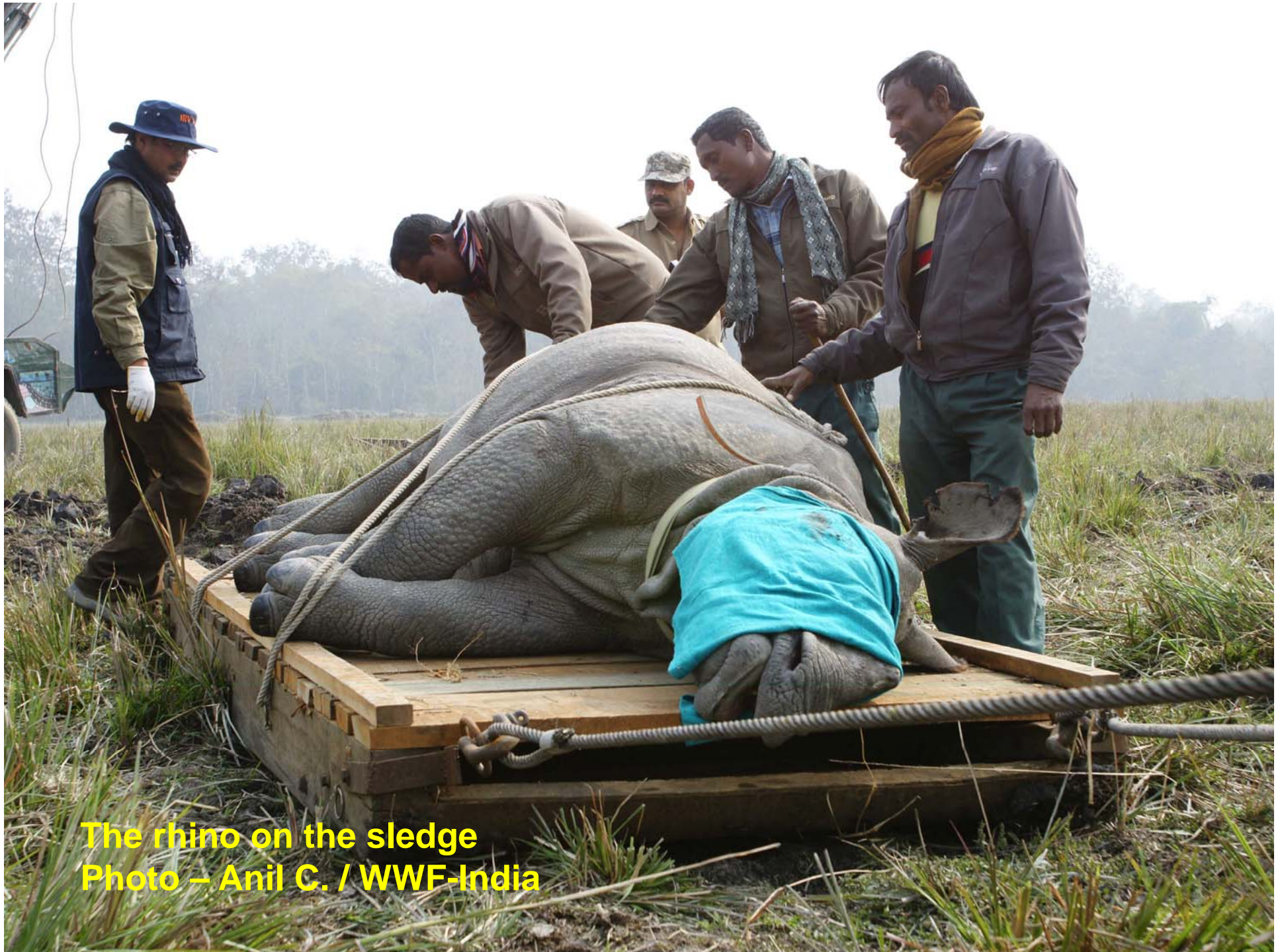
The rhino on the sledge