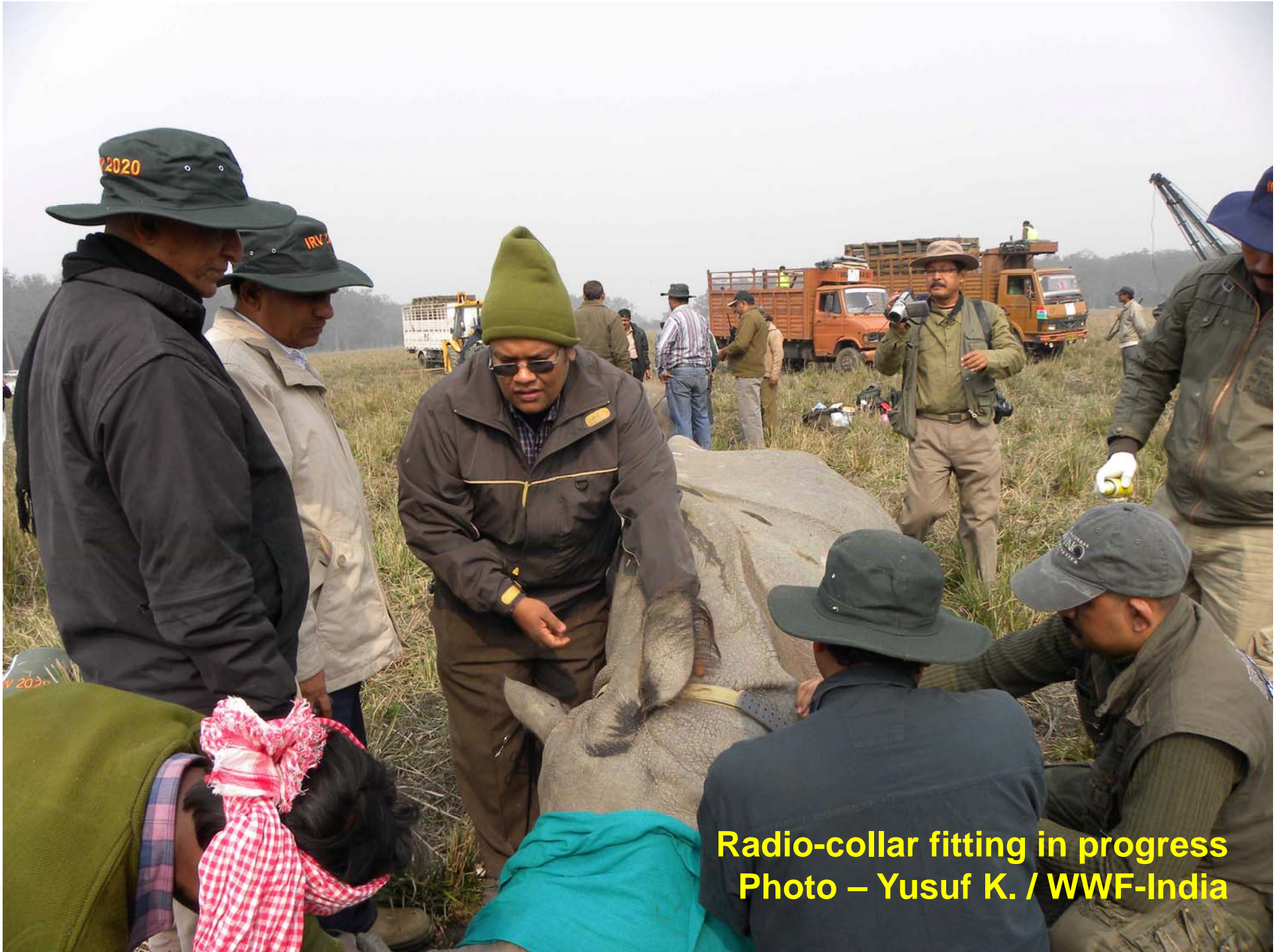
Radio-collar fitting in progress