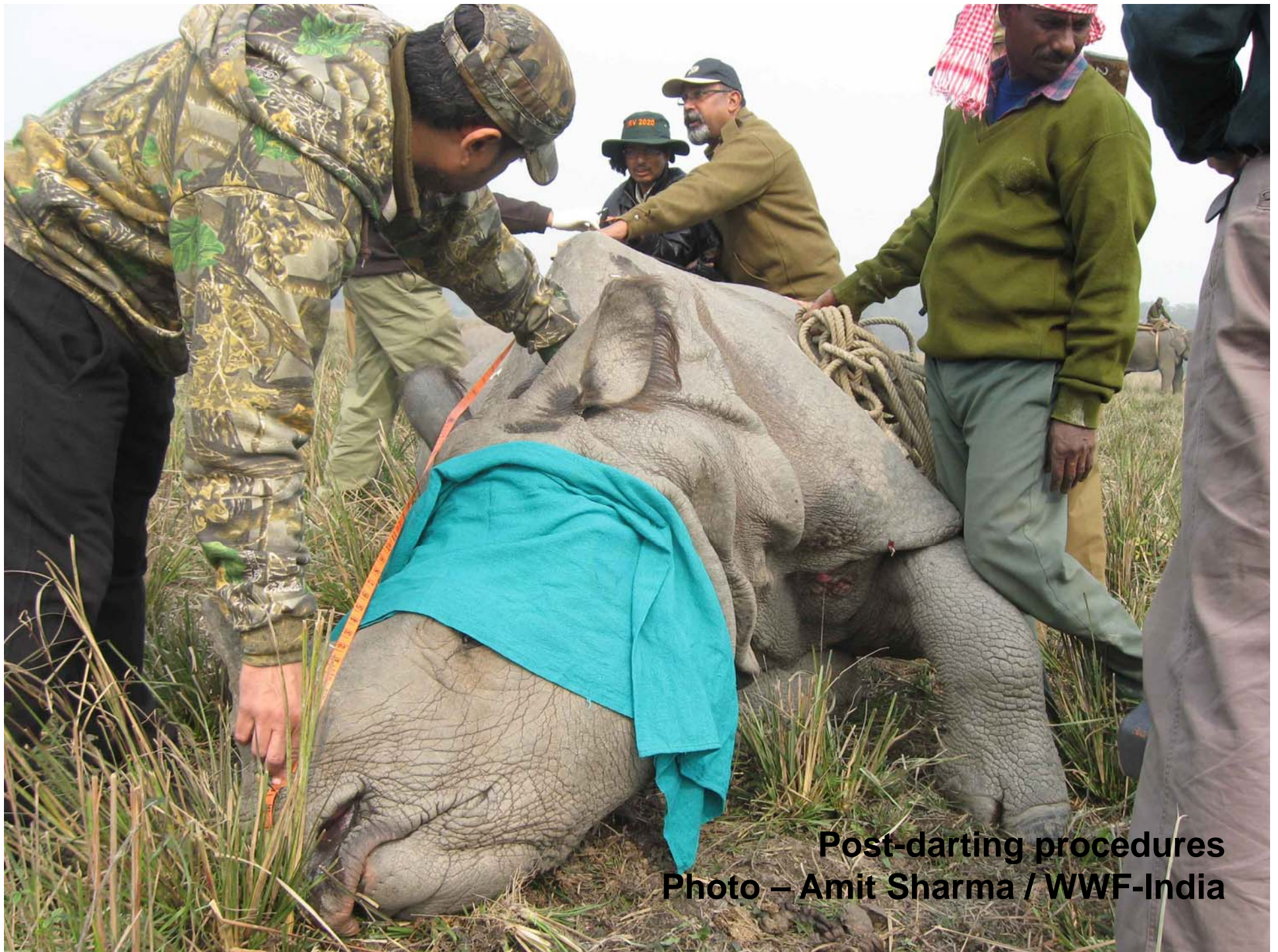
Post-darting procedures