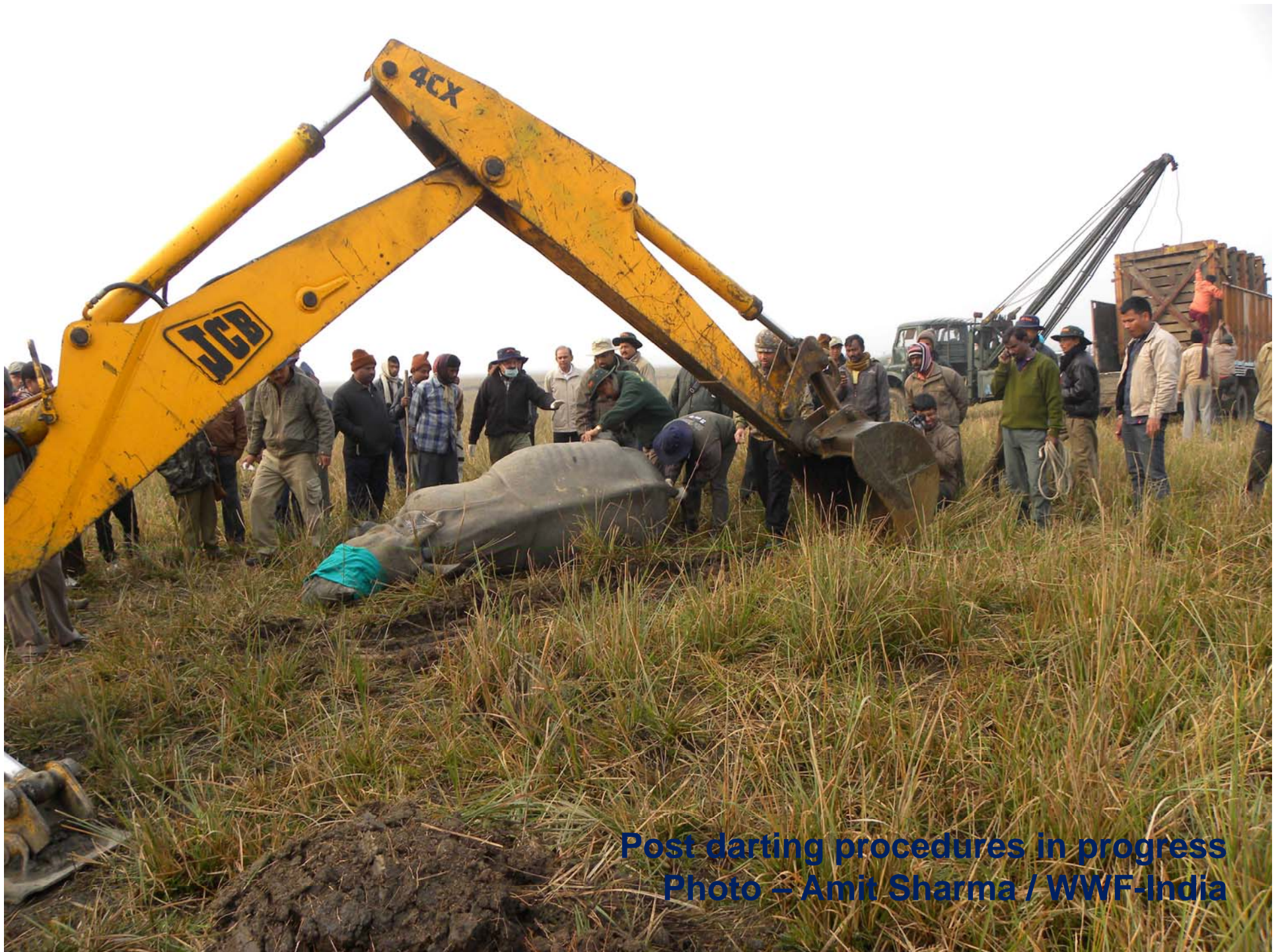
Post darting procedures in progress