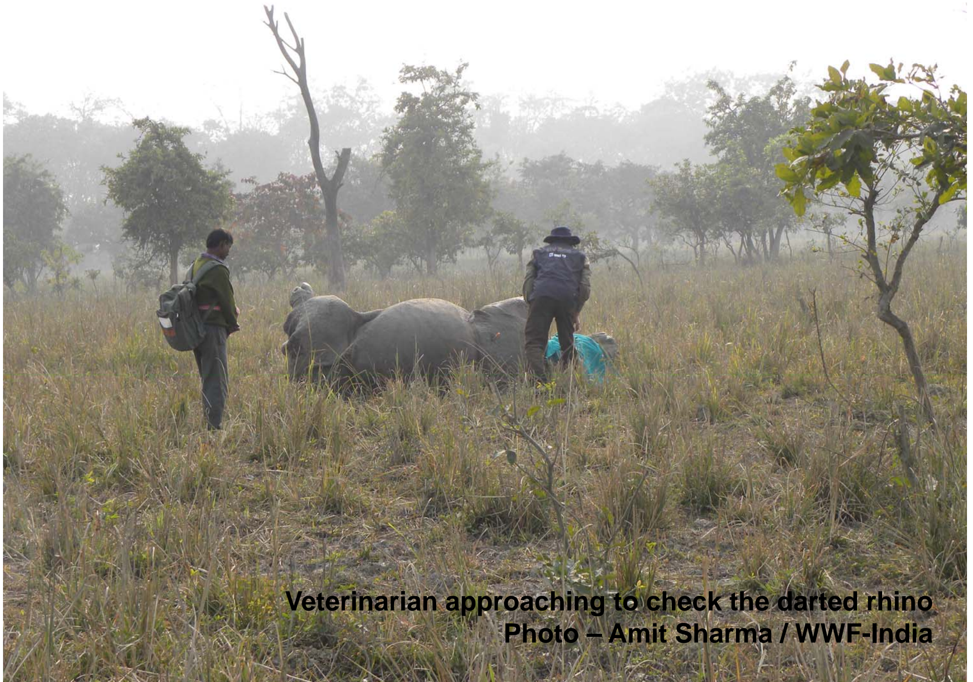
Veterinarian approaching to check the darted rhino