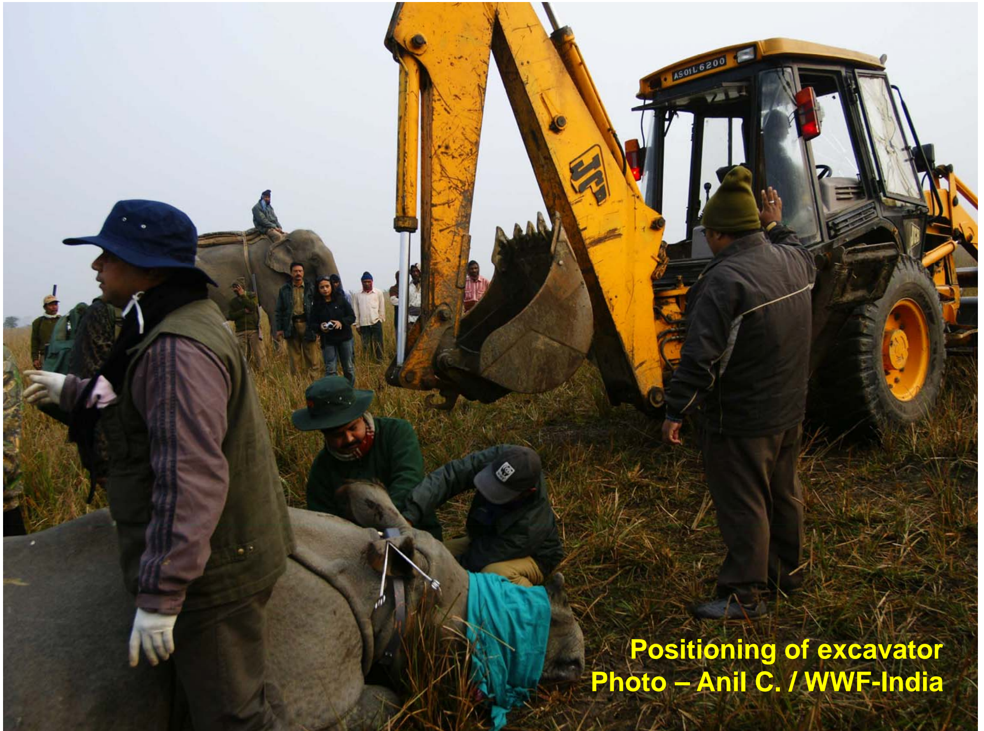
Positioning of excavator