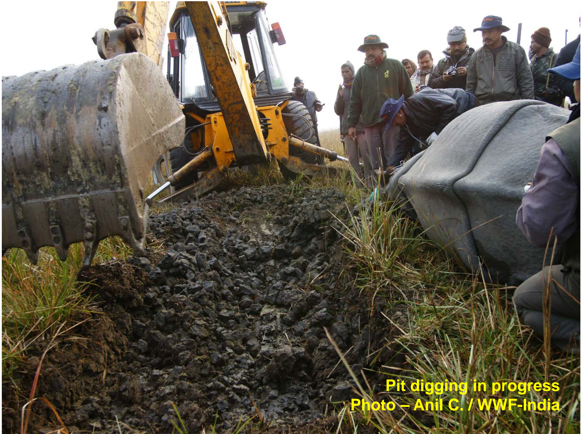
Pit digging in progress