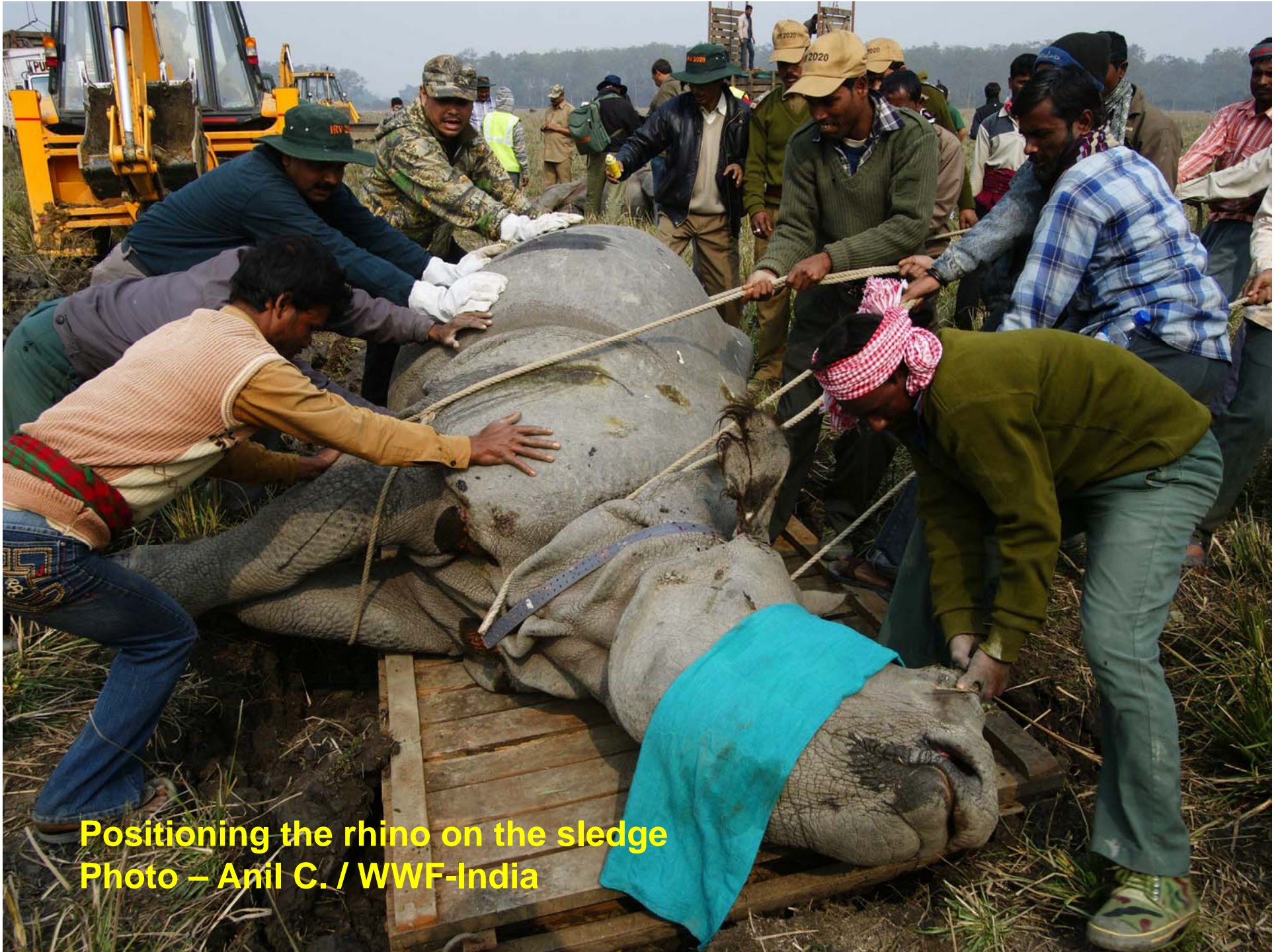
Positioning the rhino on the sledge