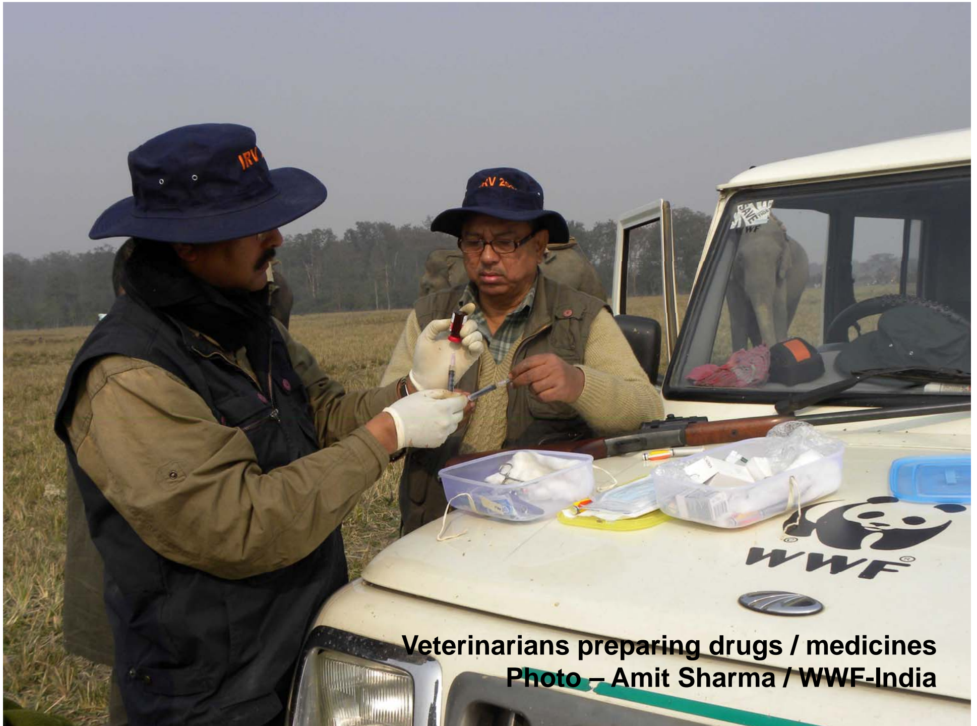
Veterinarians preparing drugs / medicines