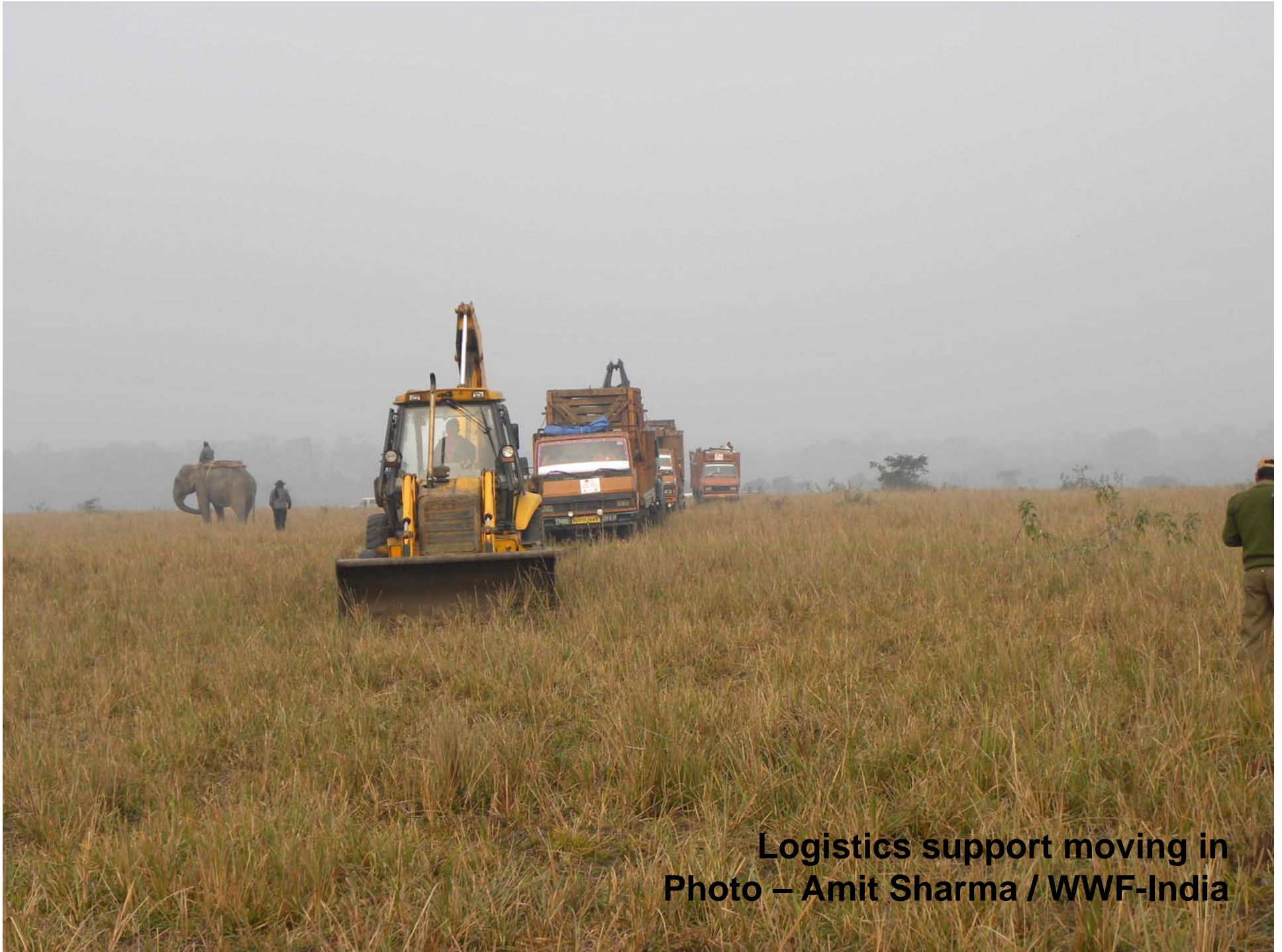
Logistics support moving in