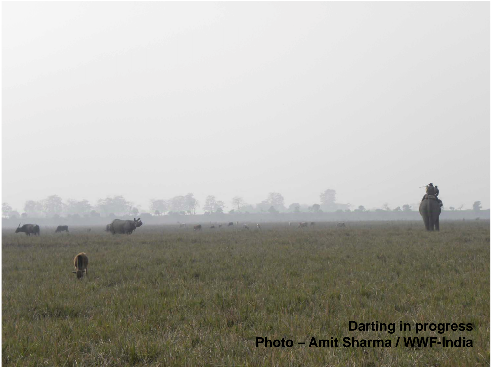
Darting in progress