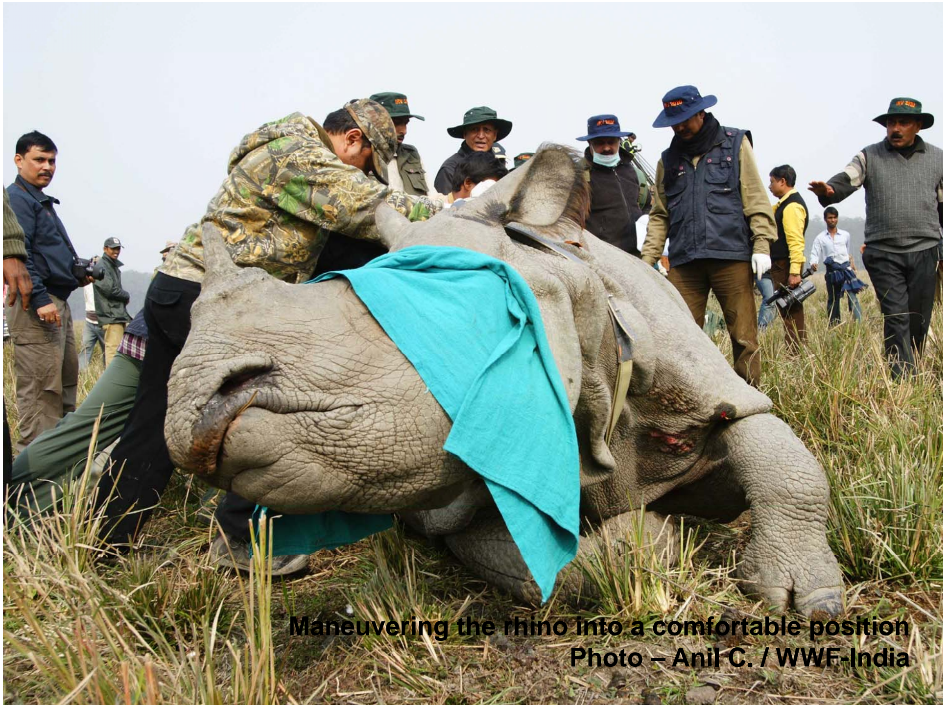
Maneuvering the rhino into a comfortable position