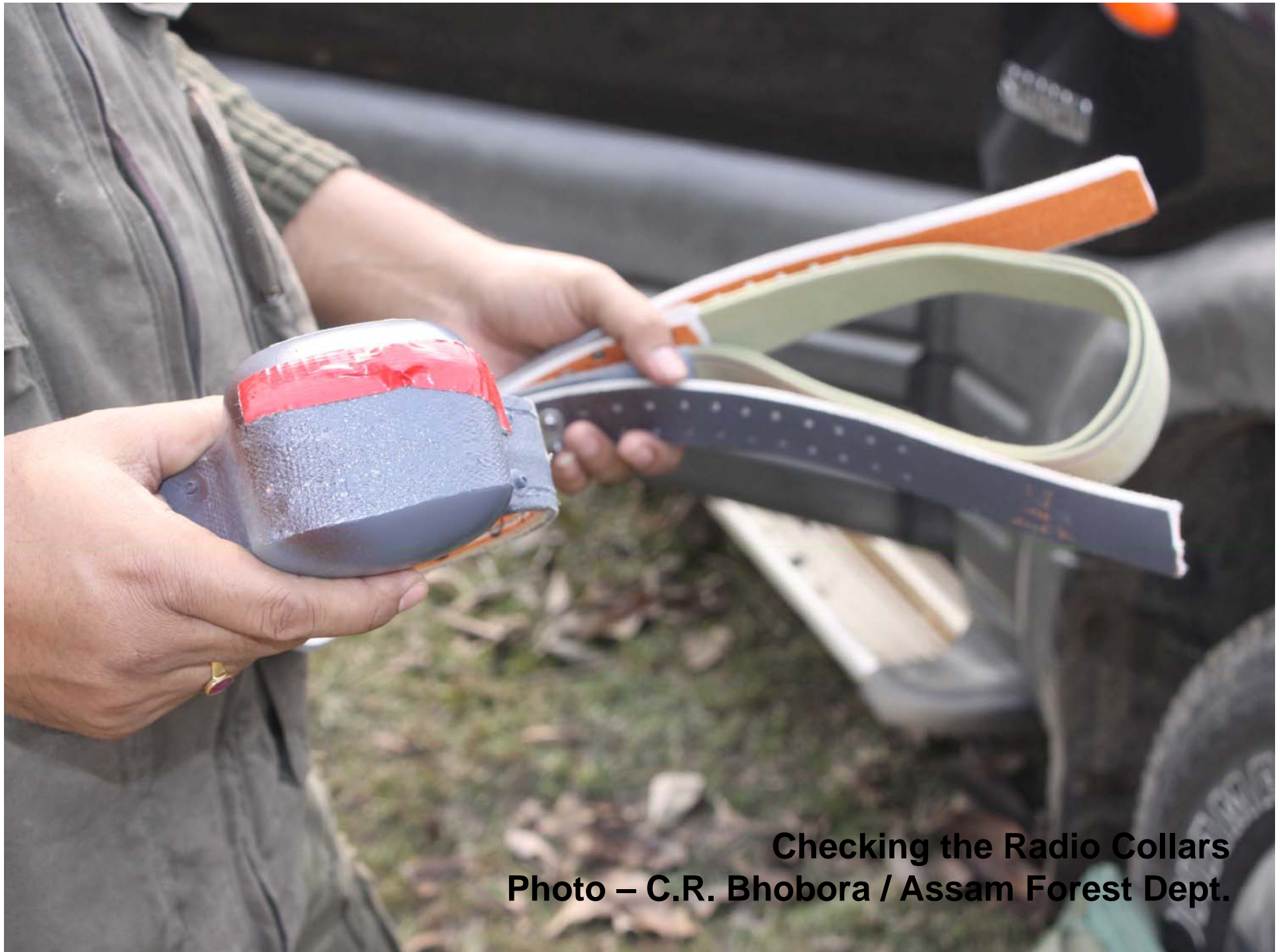
Checking the Radio Collars