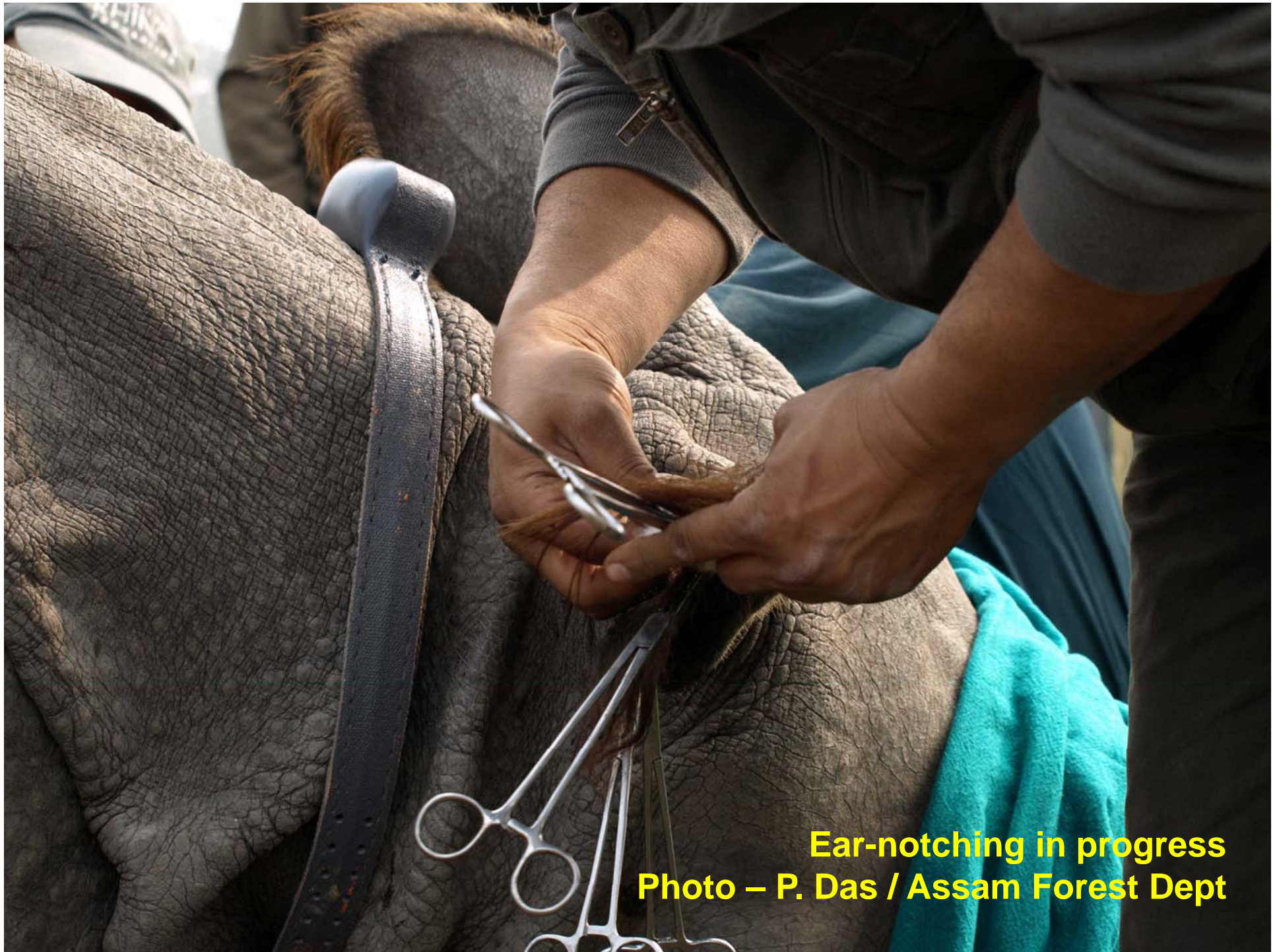
Ear-notching in progress