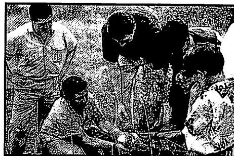
Local people watch as a toromiro tree is planted on Easter Island by a warden of the Rapa Nui National Park and Dr Wolfram Lobin, Curator of the Bonn Botanical Garden. Alberto Borden

Similar programmes are being undertaken with other island plant species as part of Kew's Island Plant Programme. This includes botanical inventory, habitat restoration and reintroduction projects in the Mascarenes in collaboration with the Mauritius Wildlife Fund, the government of Mauritius and the Indian Ocean