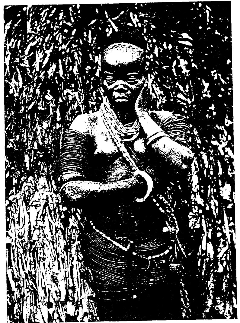
A MATEBO WOMAN

Swathed in fibre rings and necklaces and with curious charms slung from her girdle. She is the belle of a remote village perched on a mountain top in the heart of the Kivu mountains