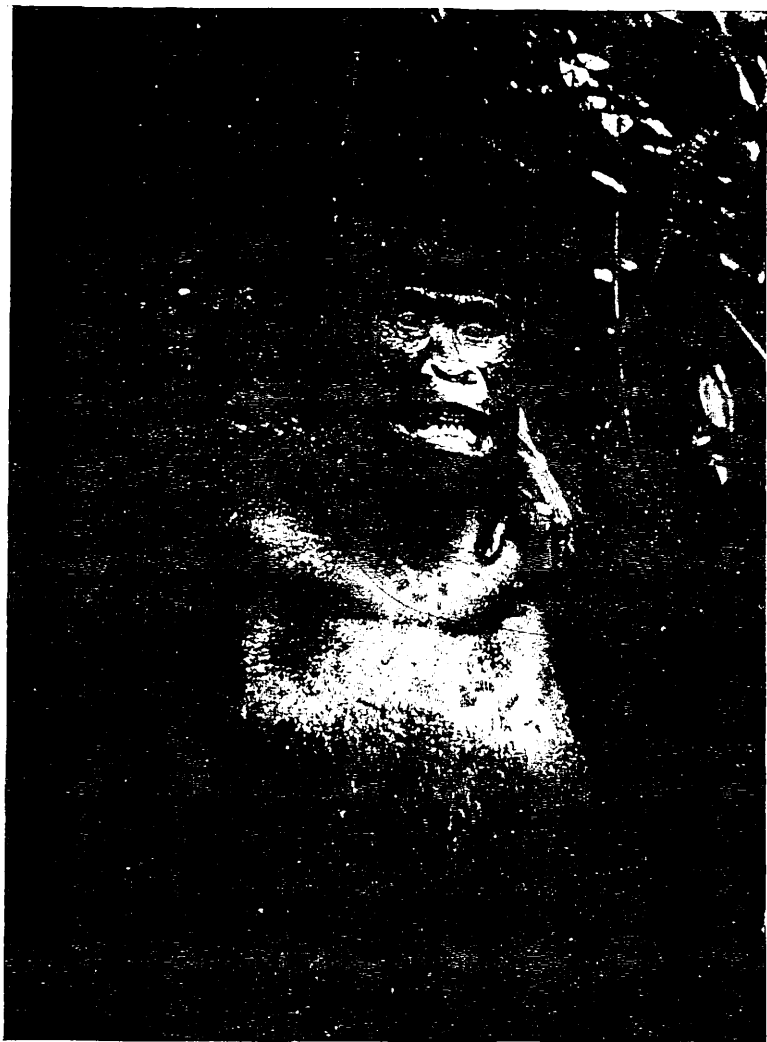
A FOREST GIANT!

A race of mountain gorilla, as yet undescribed, obtained by the author's exploring party in the forest to the west of Lake Kivu