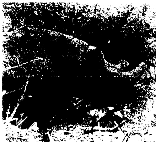
FIG. 1 Regrowth of horns in an adult black rhino female 3 years after dehorning.

poachers. If larger-horned rhinos were preferred trophies, then recently dehorned individuals would remain of low value. However, the similarity between mass categories of horns confiscated from poachers and those on live rhinos in extant, wild populations (Fig. 2)