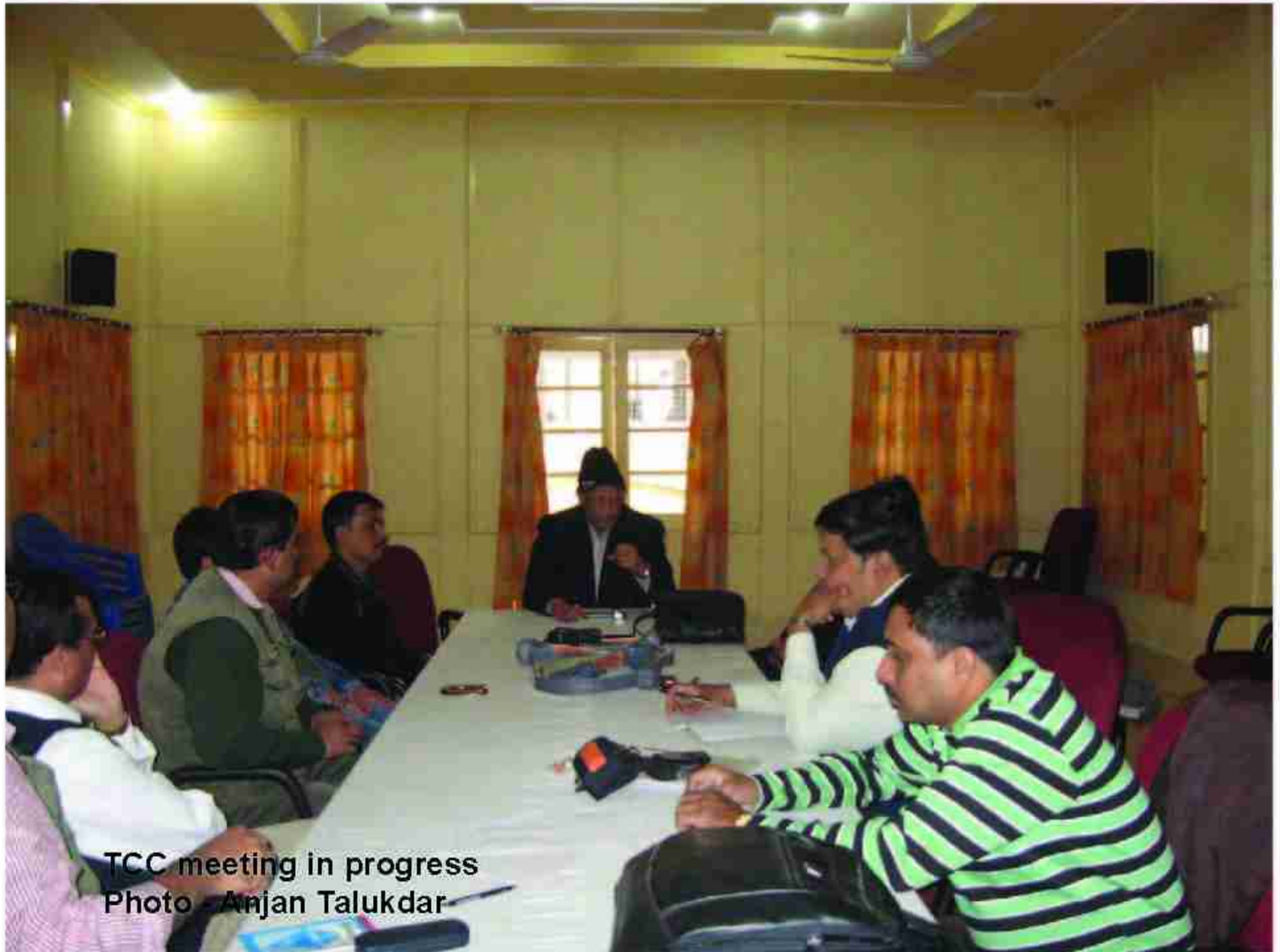
TCC meeting in progress