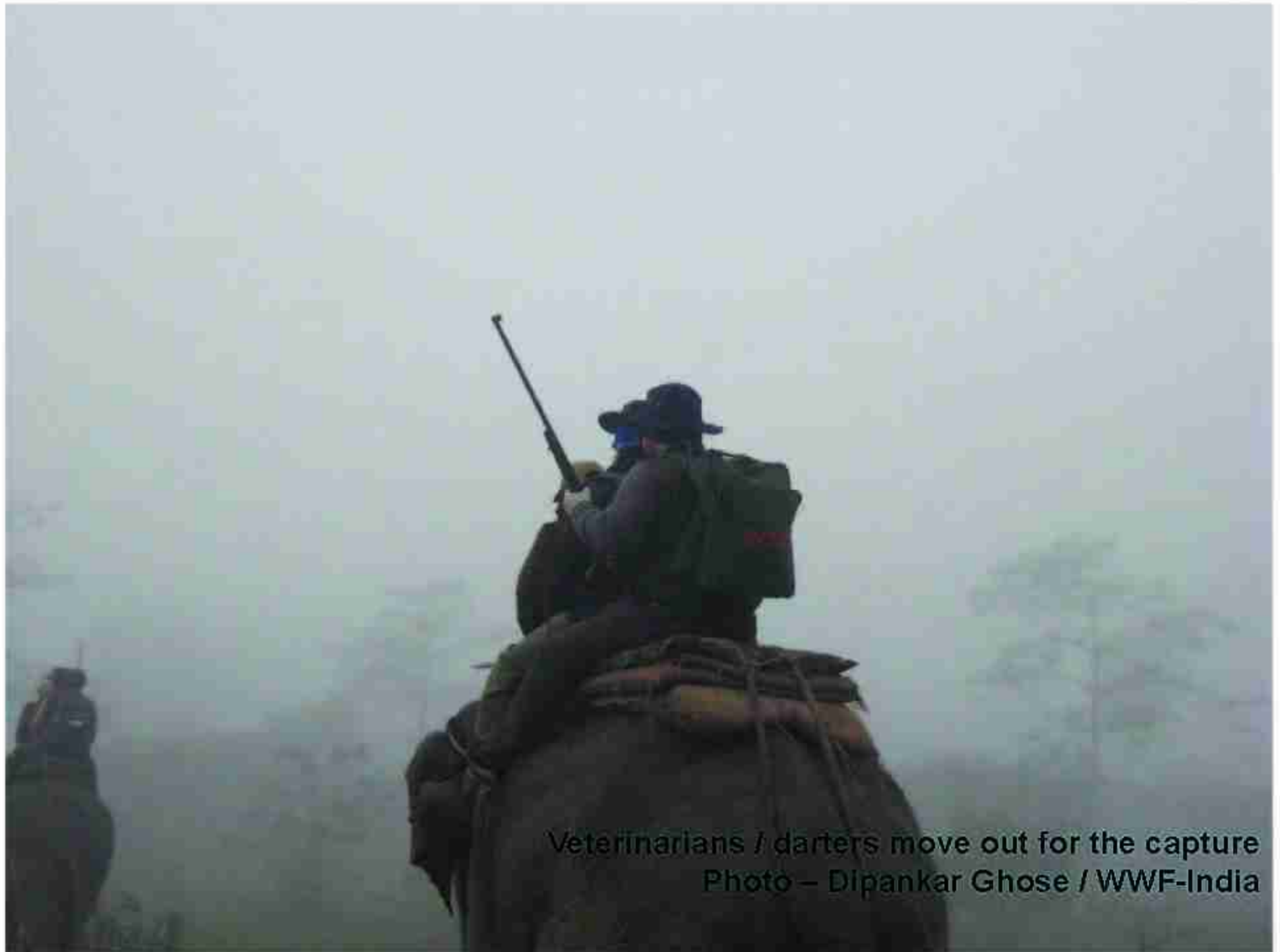
Veterinarians / darters move out for the capture