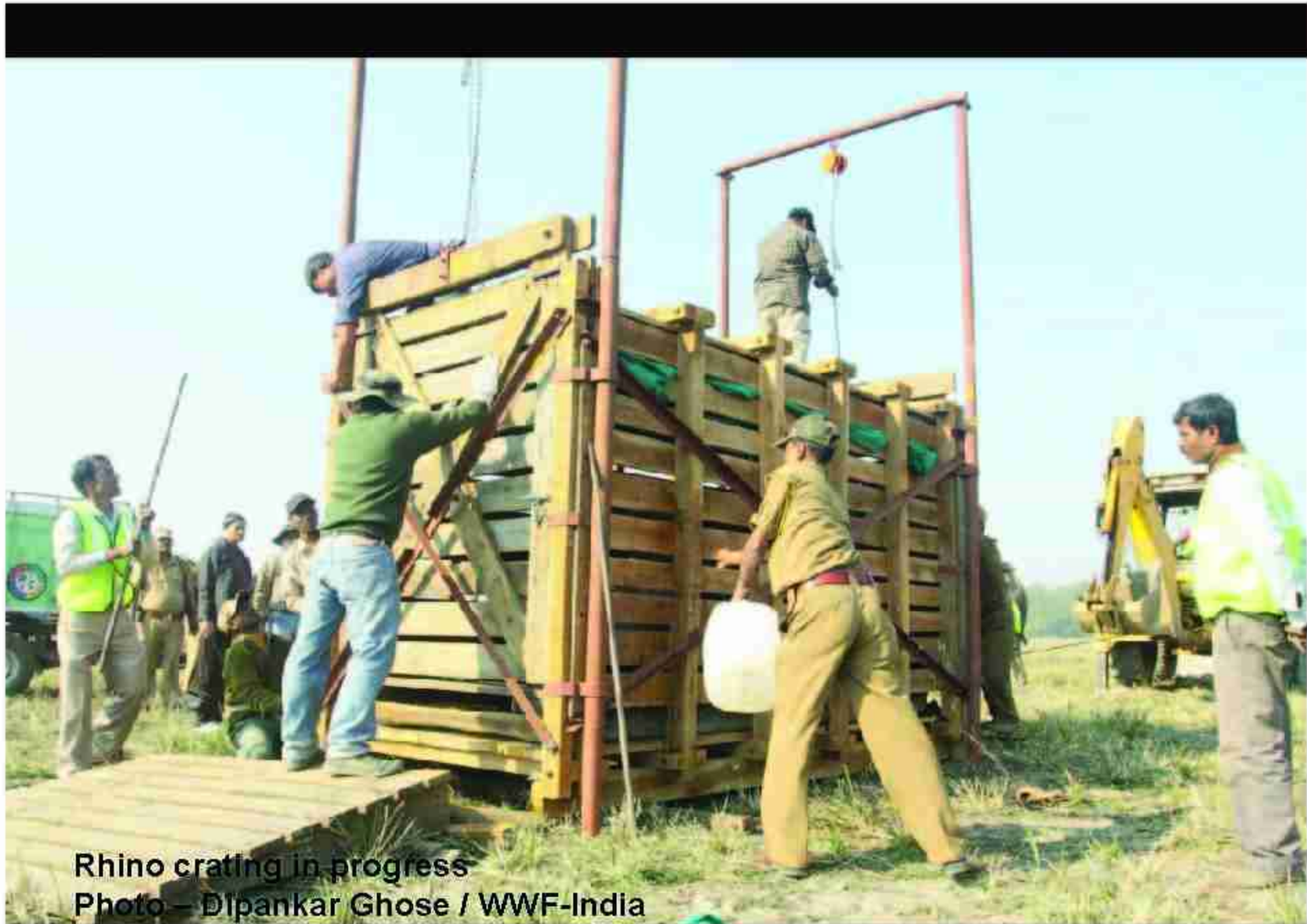
Rhino crating in progress