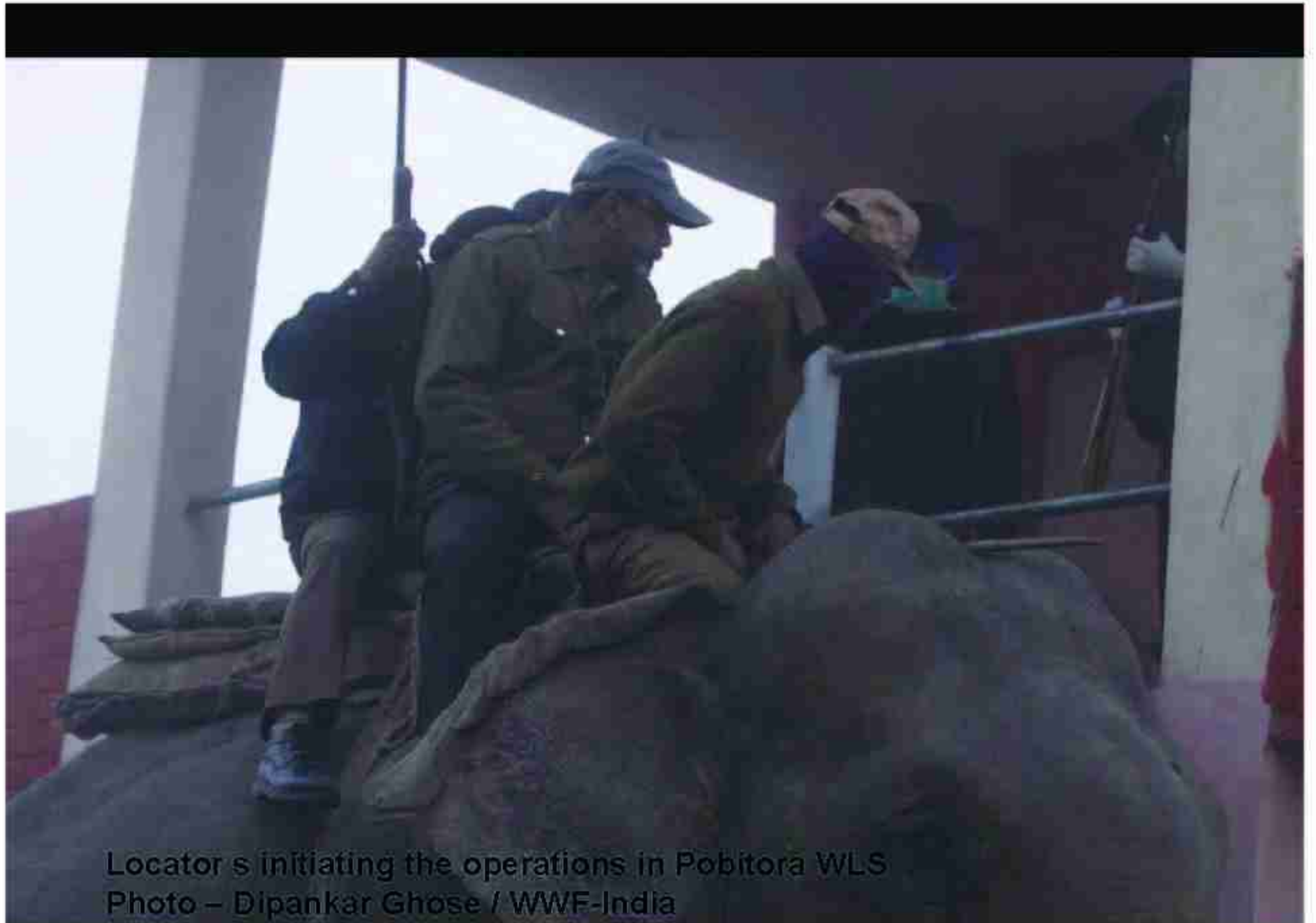
Locator s initiating the operations in Pobitora WLS