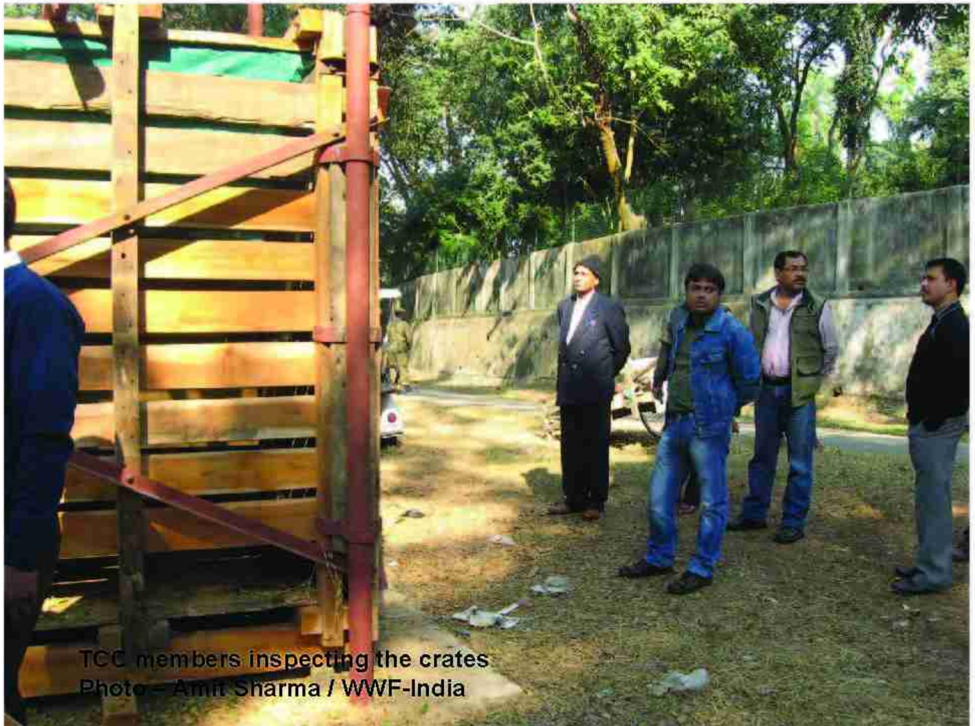
TCC members inspecting the crates