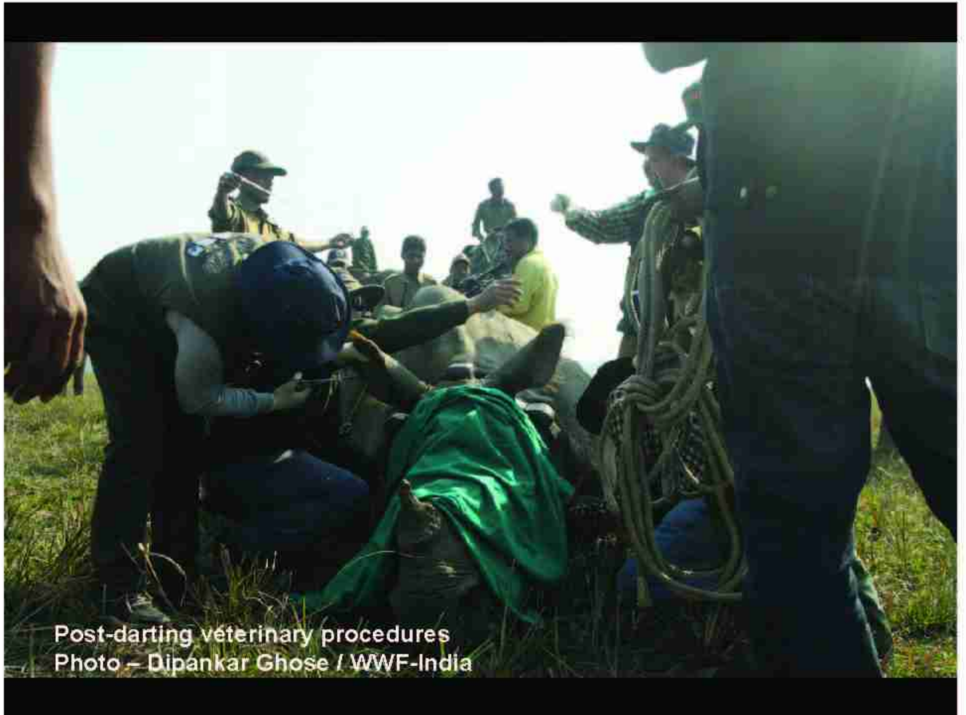
Post-darting veterinary procedures