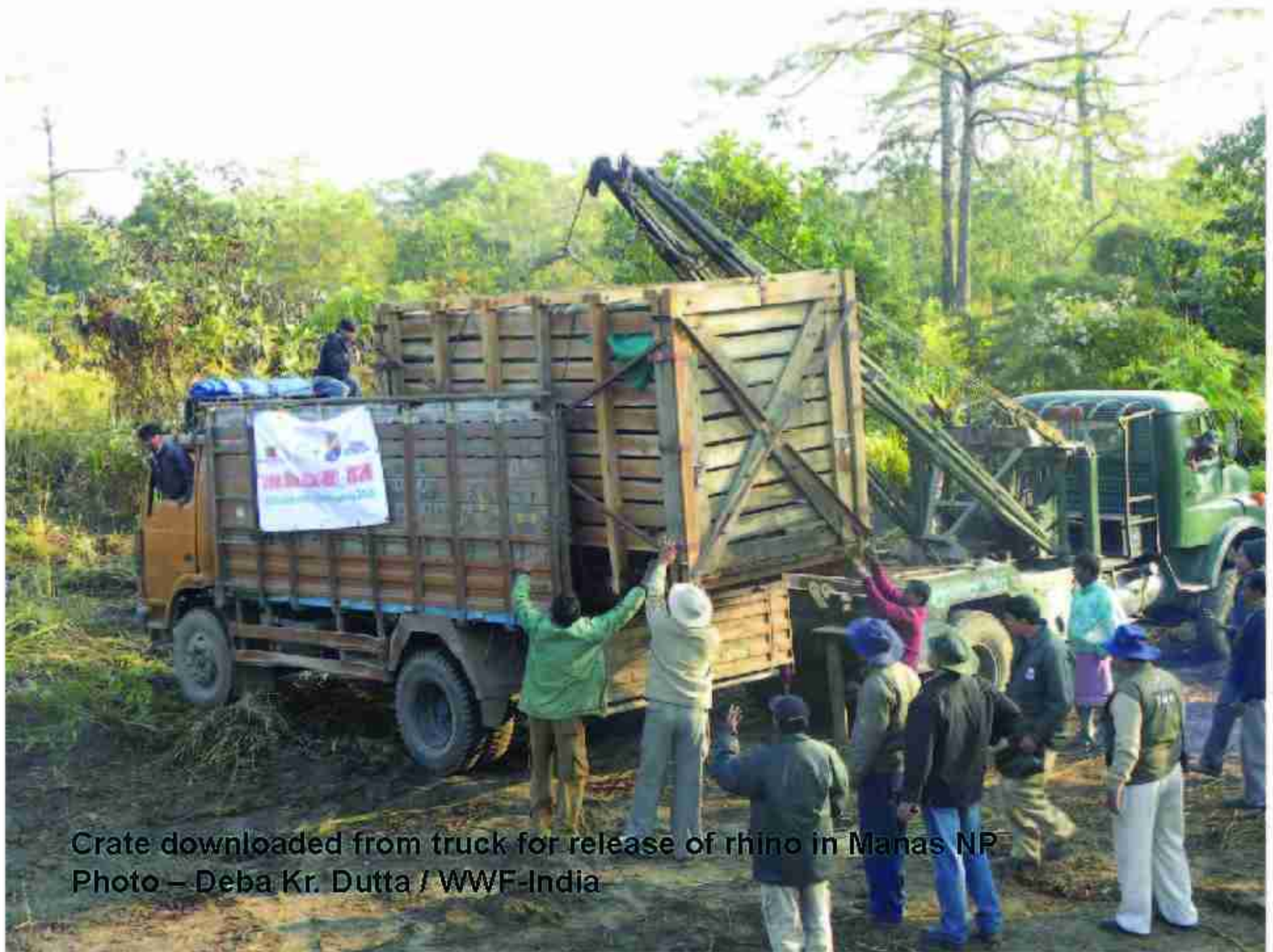
Crate downloaded from truck for release of rhino in Manas NP