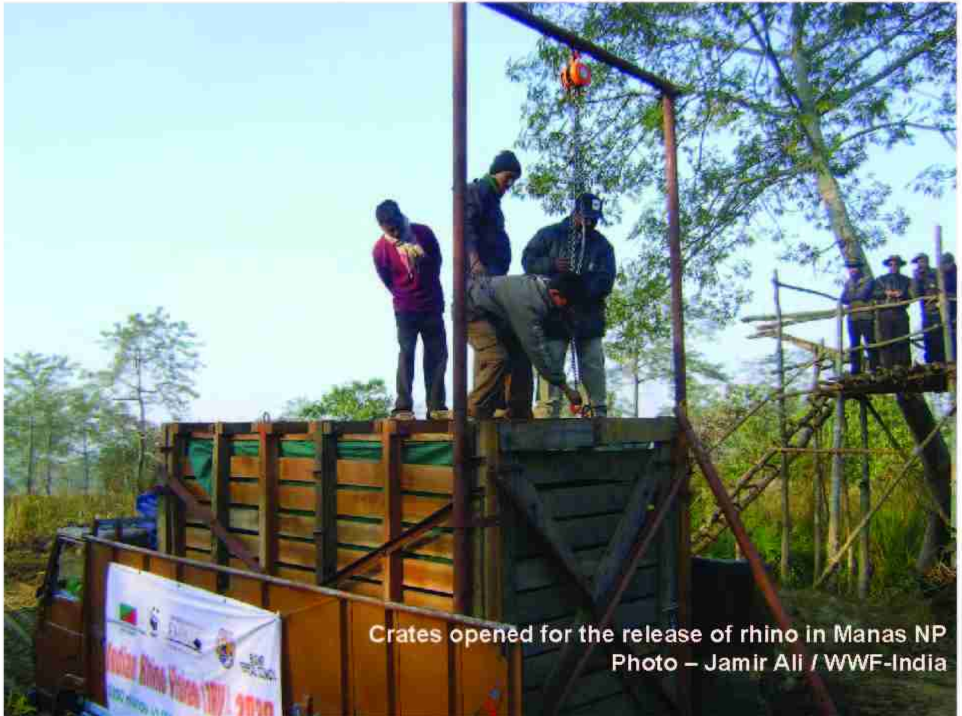
Crates opened for the release of rhino in Manas NP