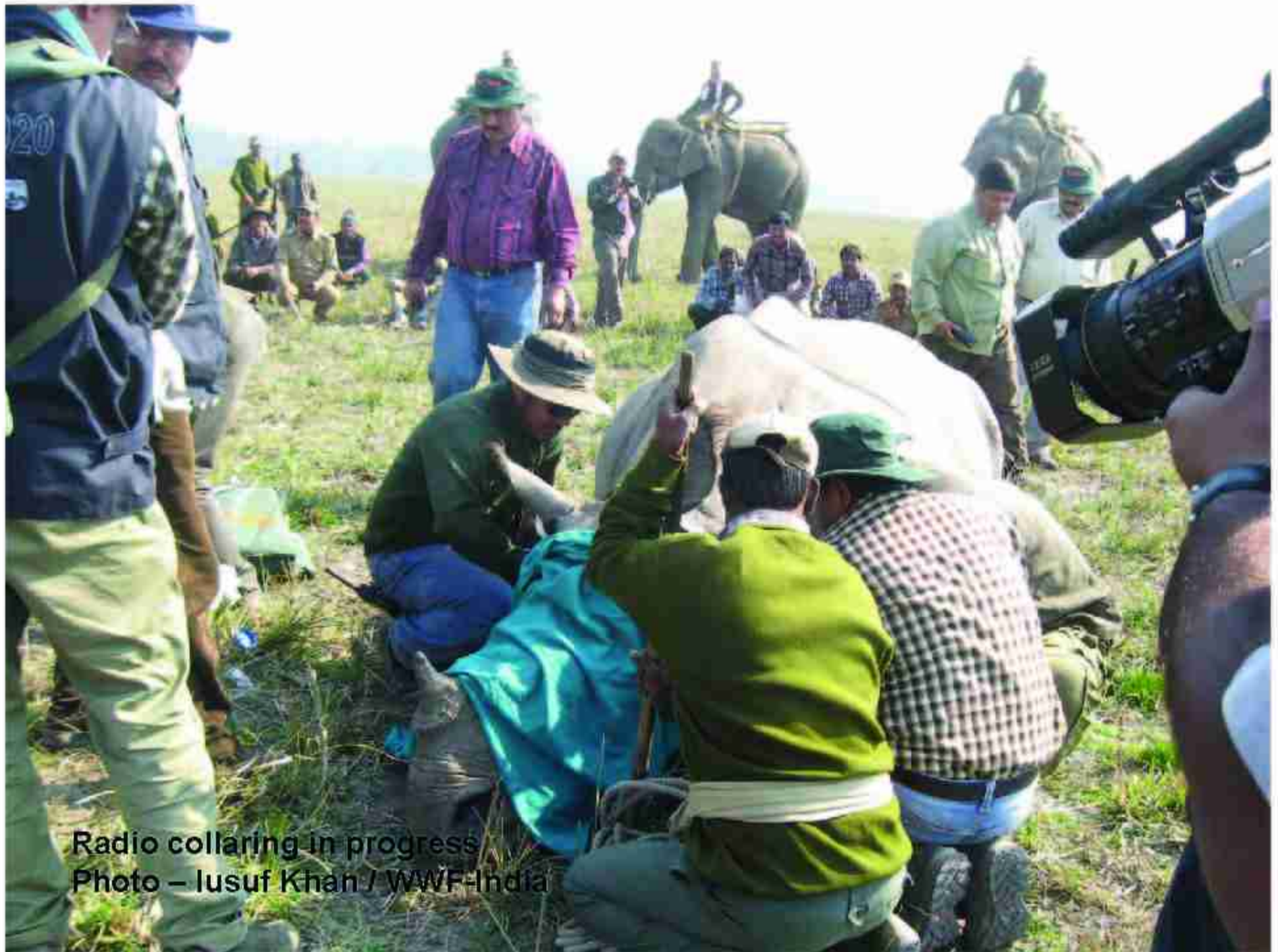
Radio collaring in progress