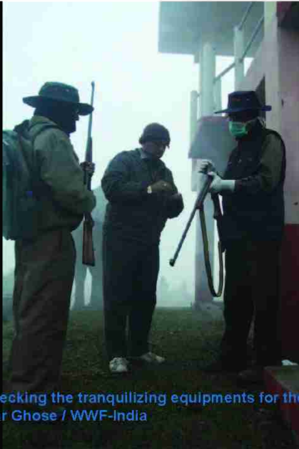
Veterinarians checking the tranquilizing equipments for the capture