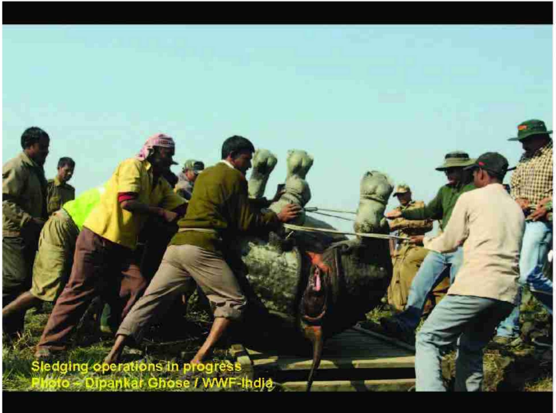
Sledging operations in progress