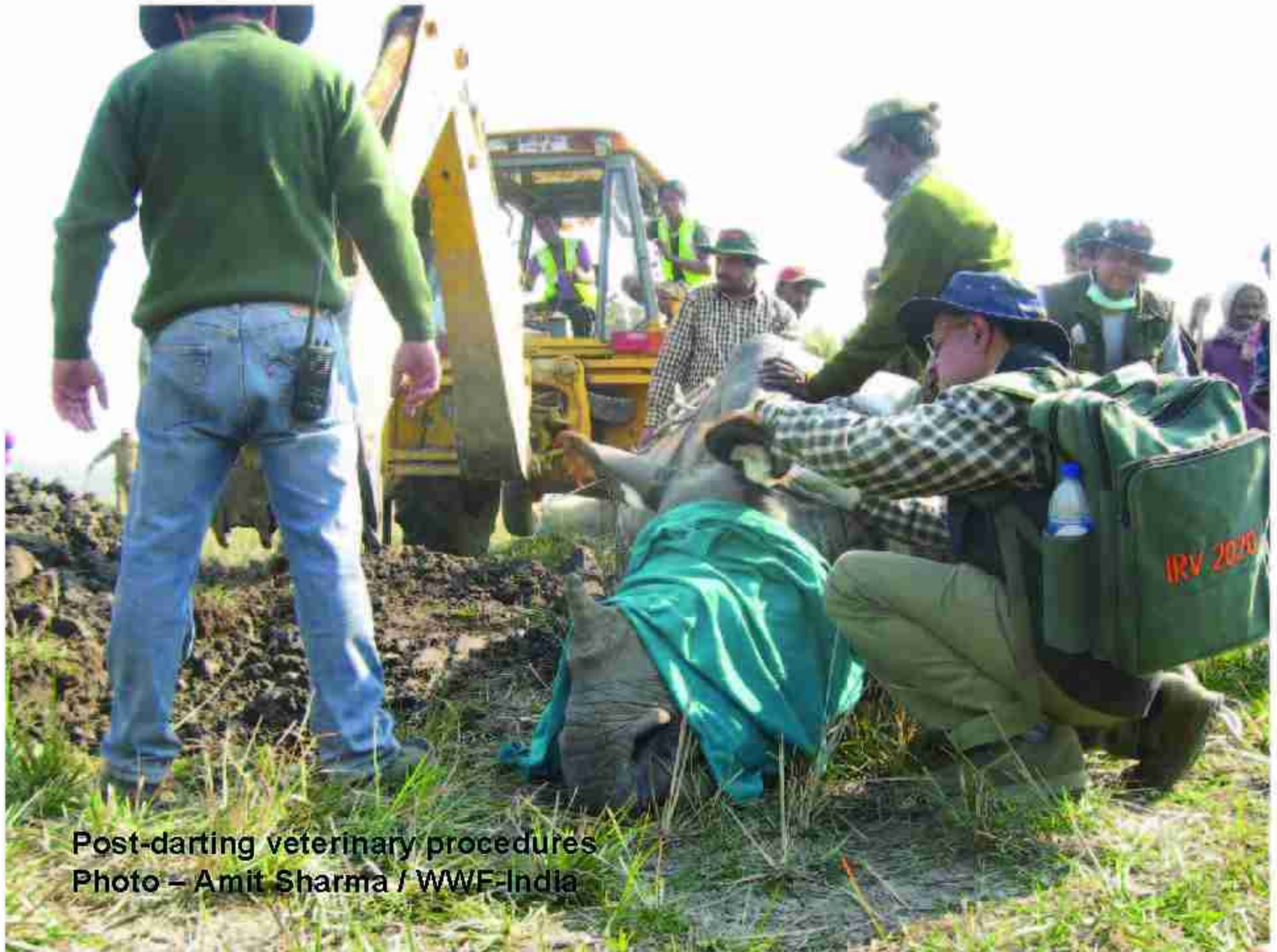
Post-darting veterinary procedures