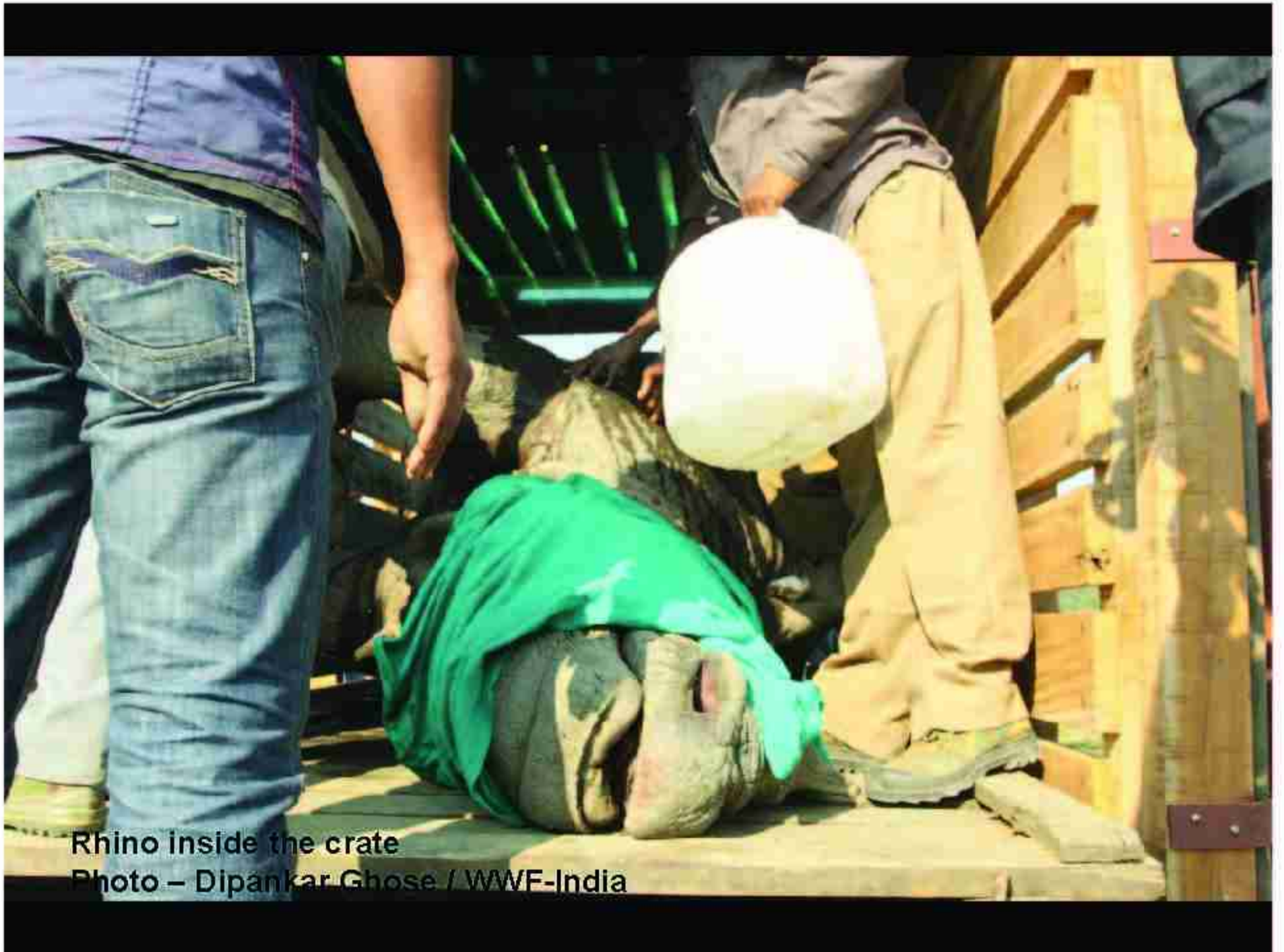
Rhino inside the crate