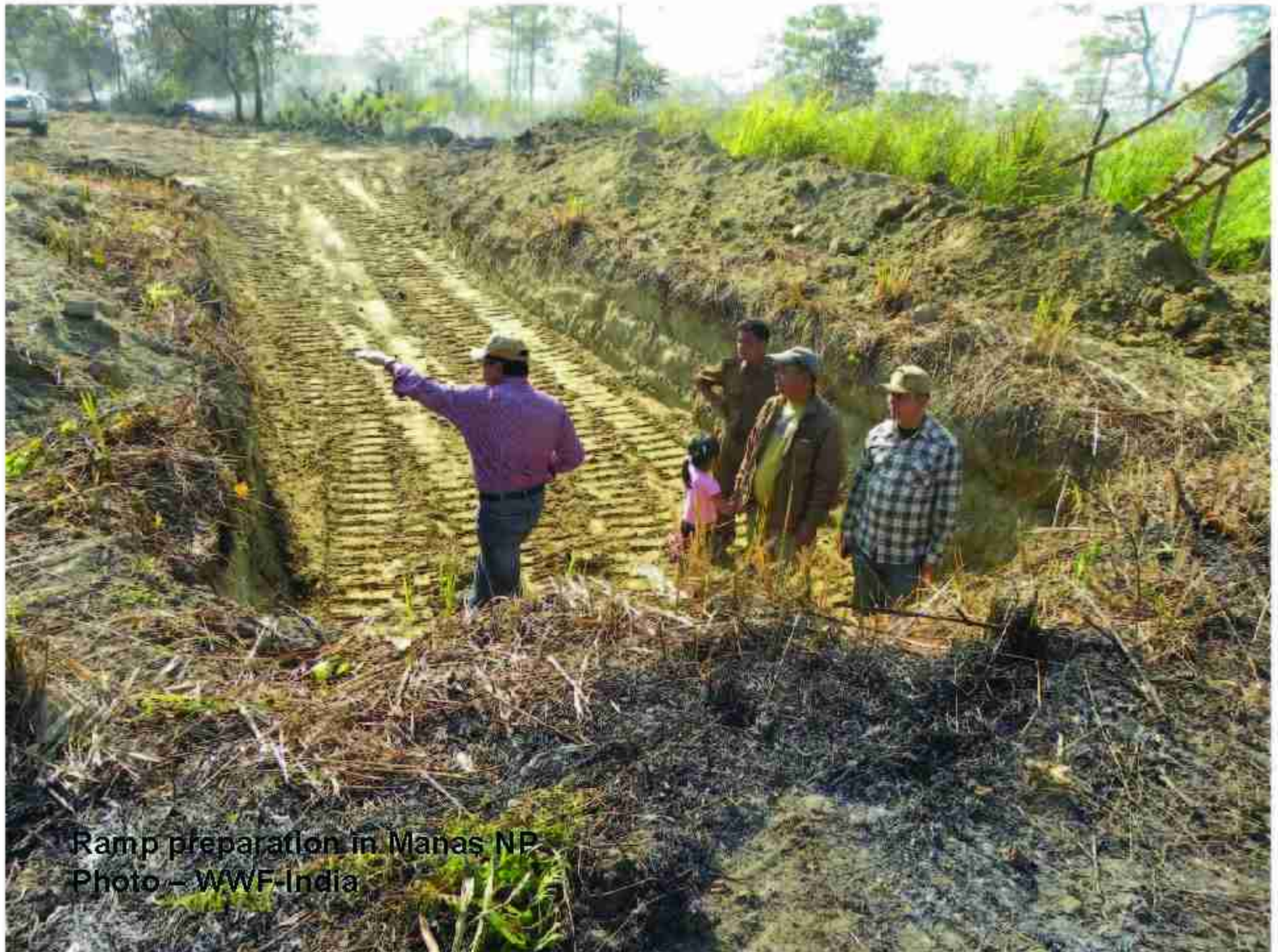
Ramp preparation in Manas NP