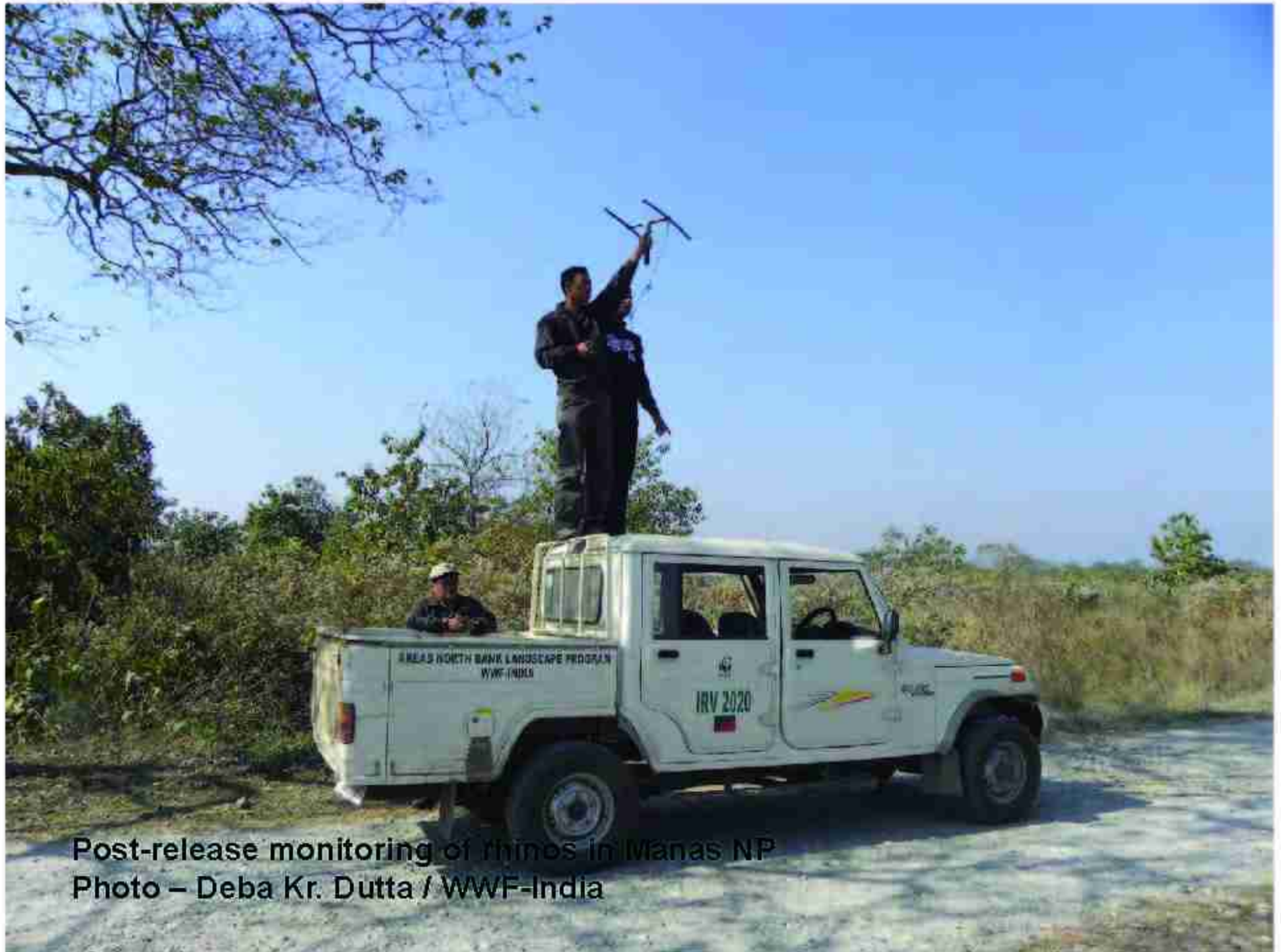
Post-release monitoring of rhinos in Manas NP