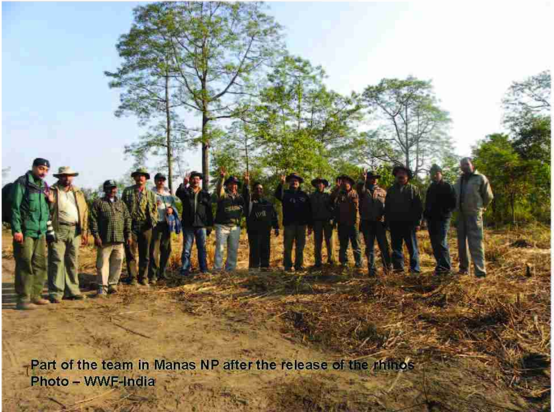
Part of the team in Manas NP after the release of the rhinos