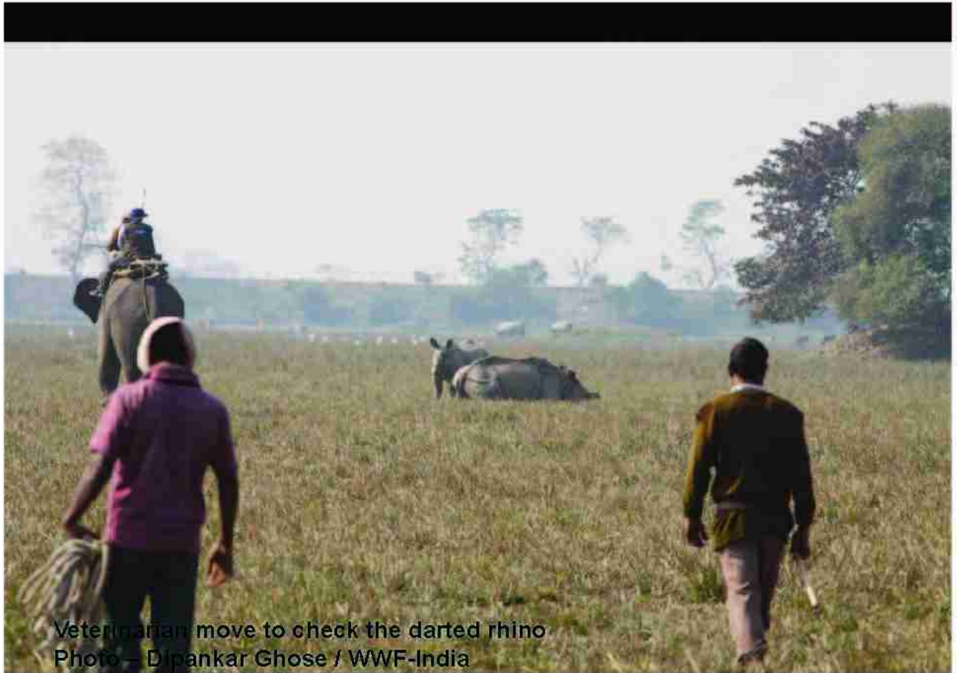
Veterinarian move to check the darted rhino