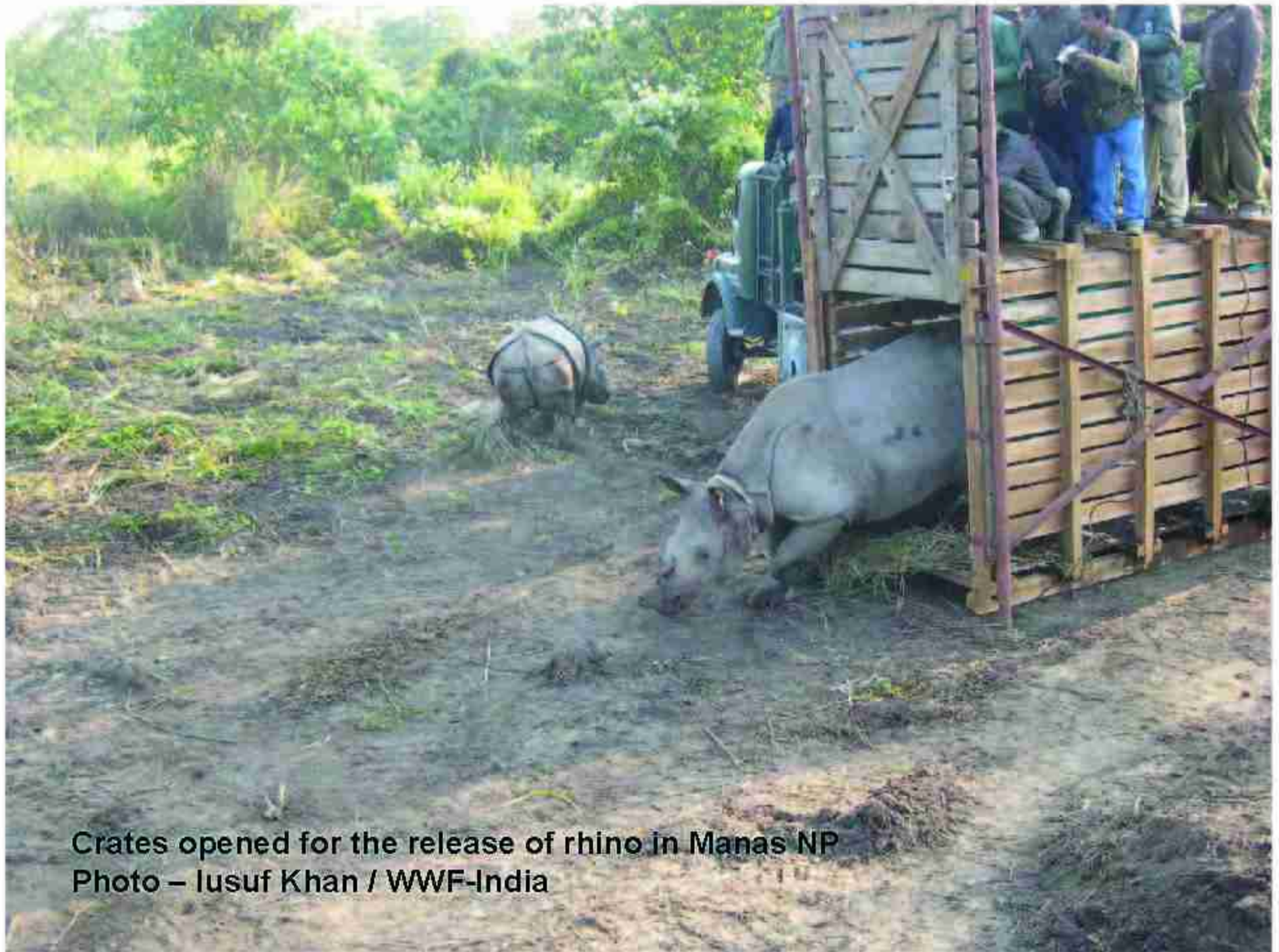
Crates opened for the release of rhino in Manas NP