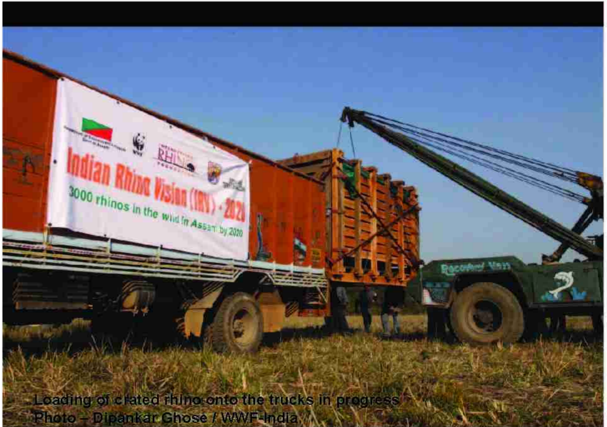
Loading of crated rhino onto the trucks in progress