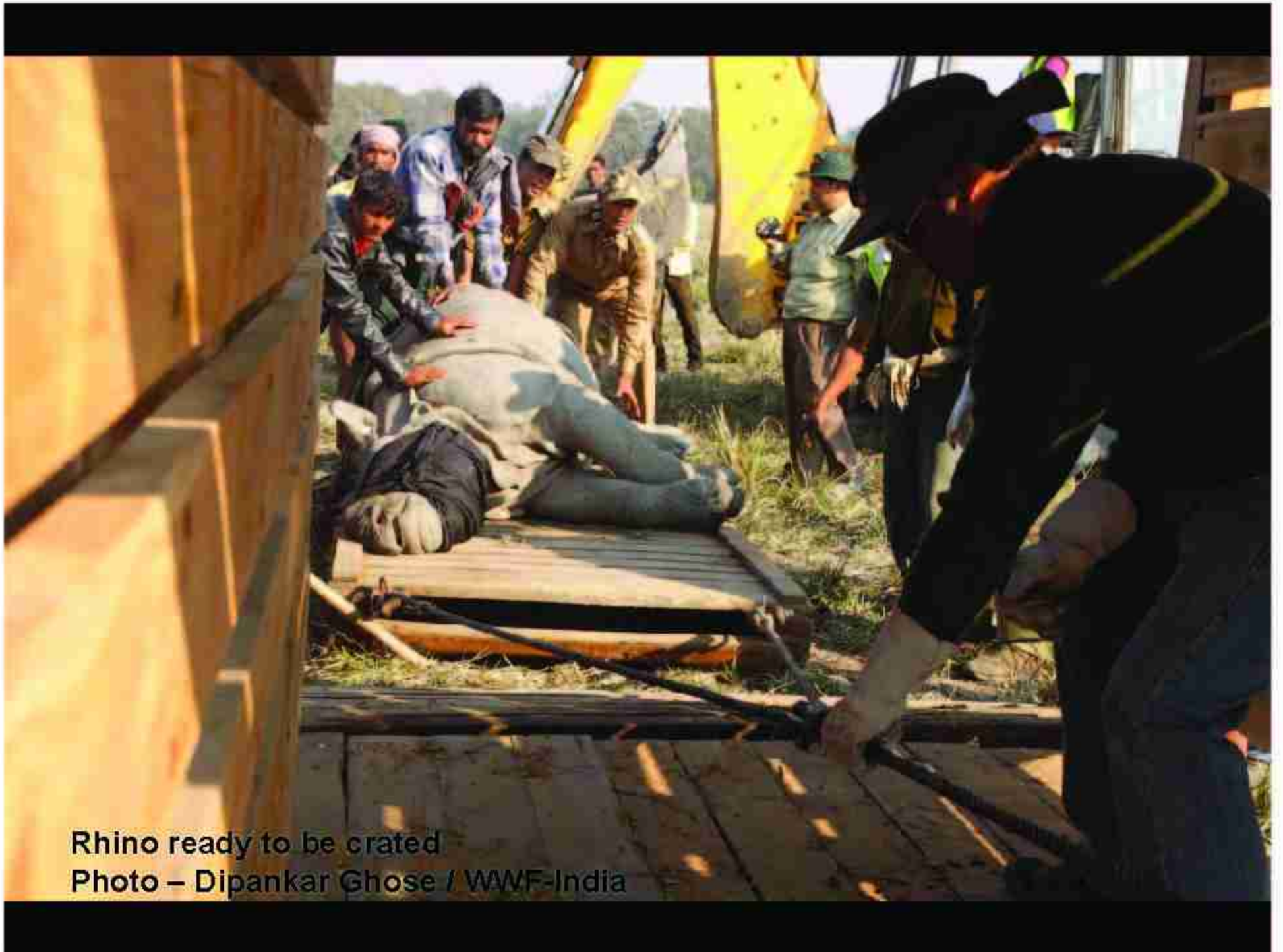
Rhino ready to be crated