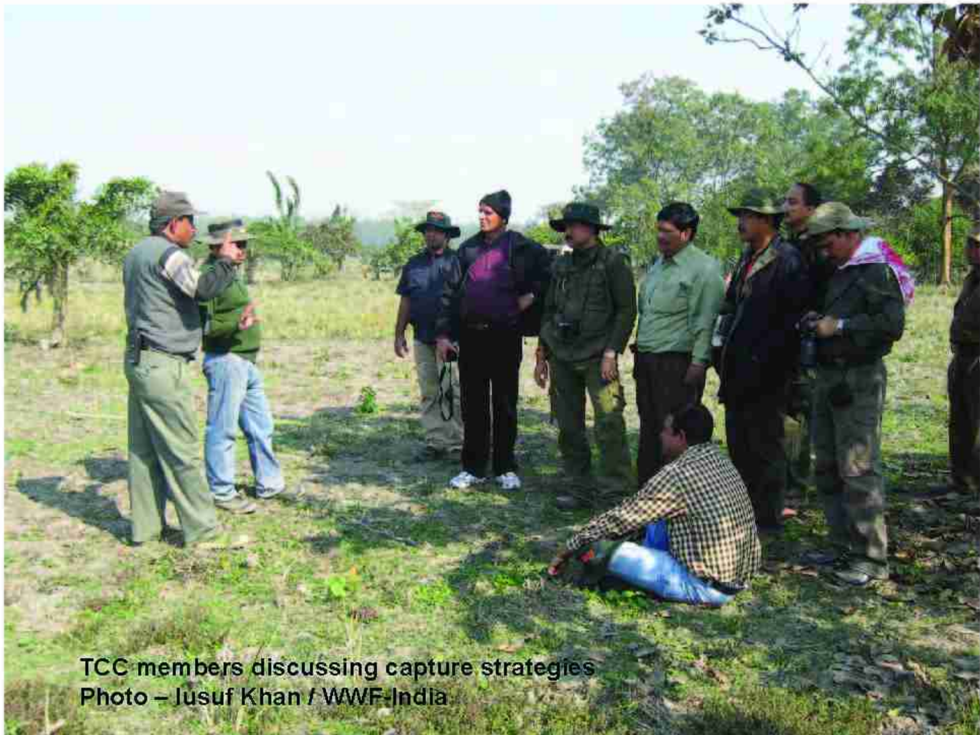
TCC members discussing capture strategies