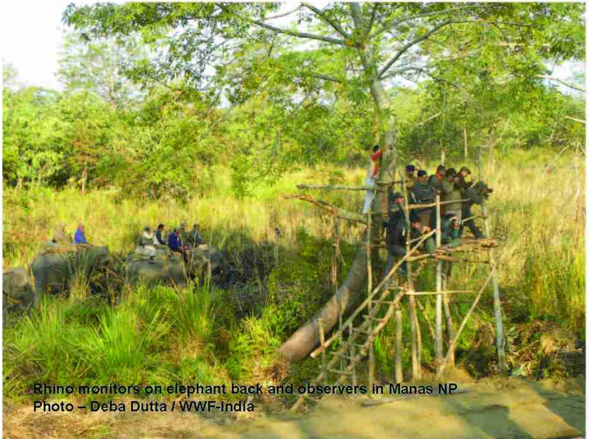
Rhino monitors on elephant back and observers in Manas NP