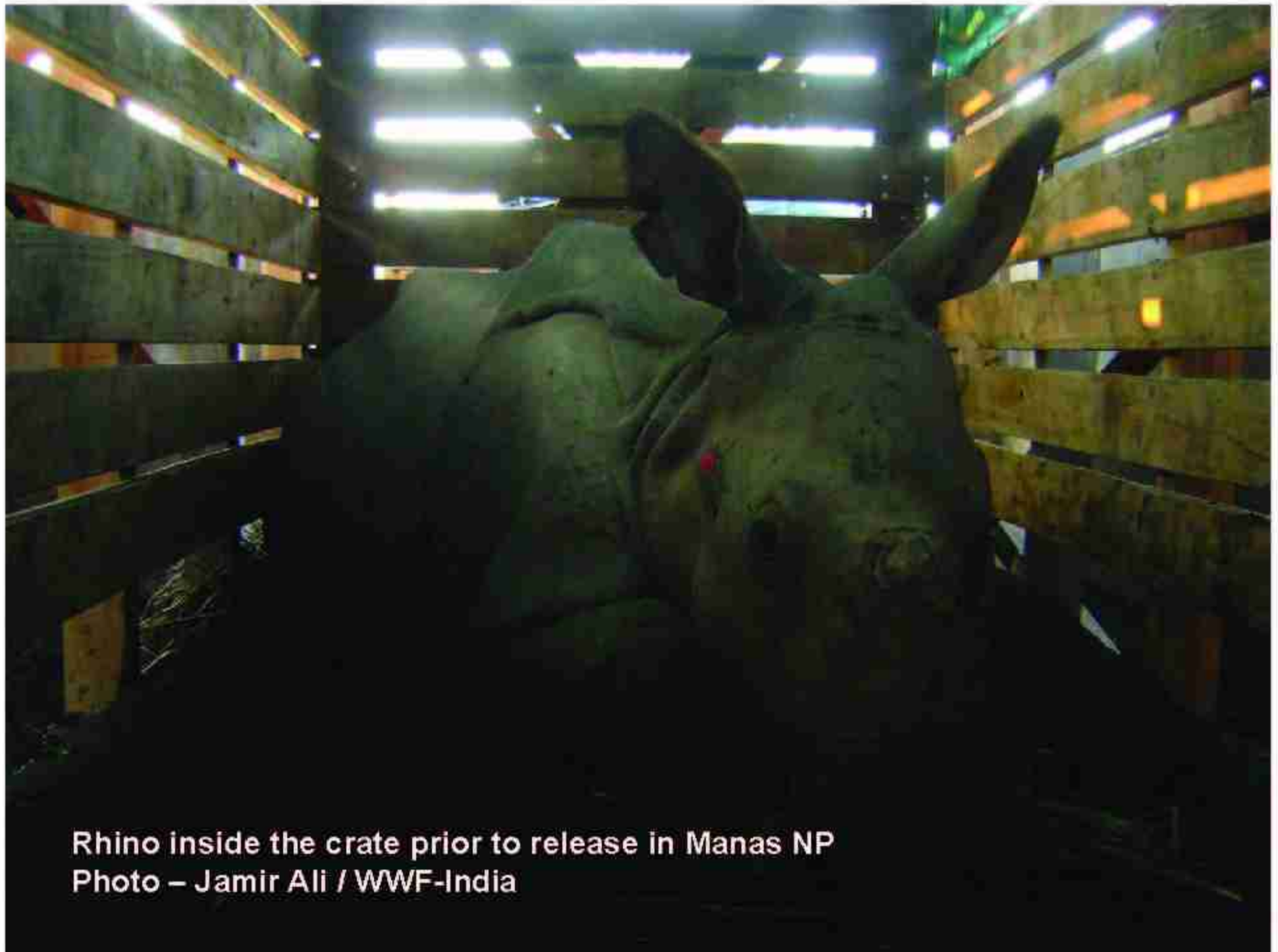
Rhino inside the crate prior to release in Manas NP