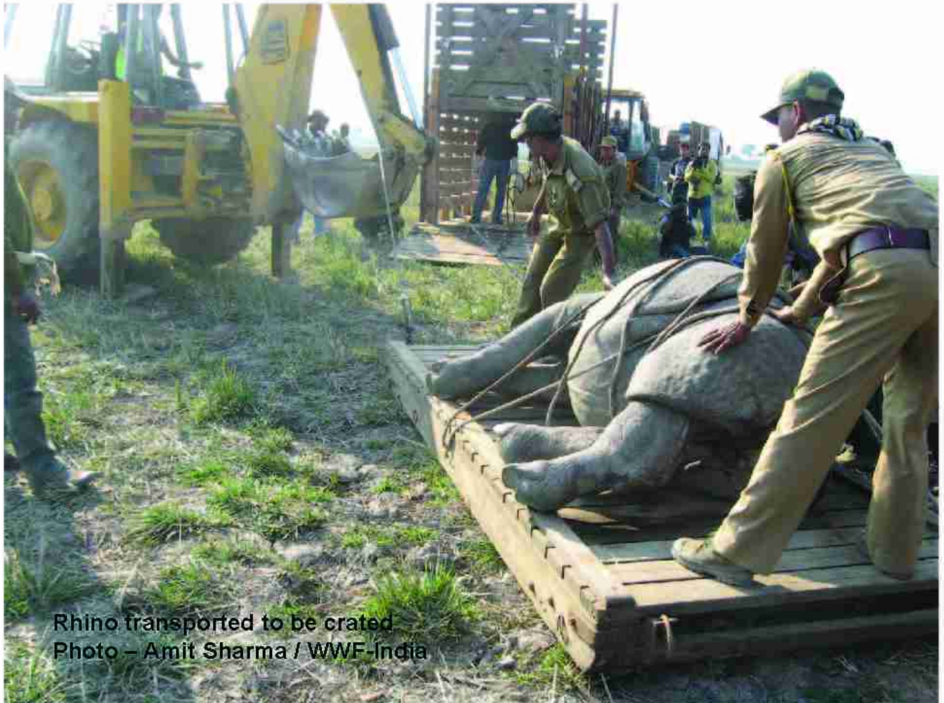
Rhino transported to be crated