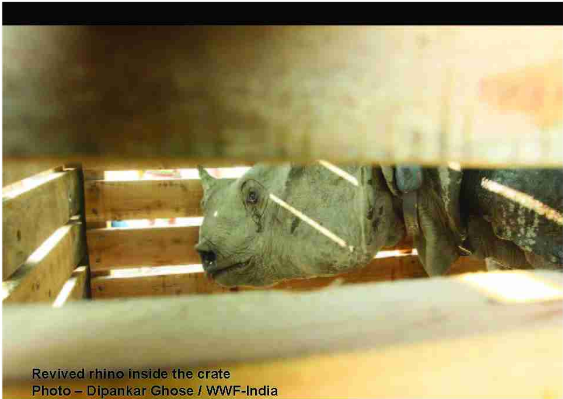
Revived rhino inside the crate