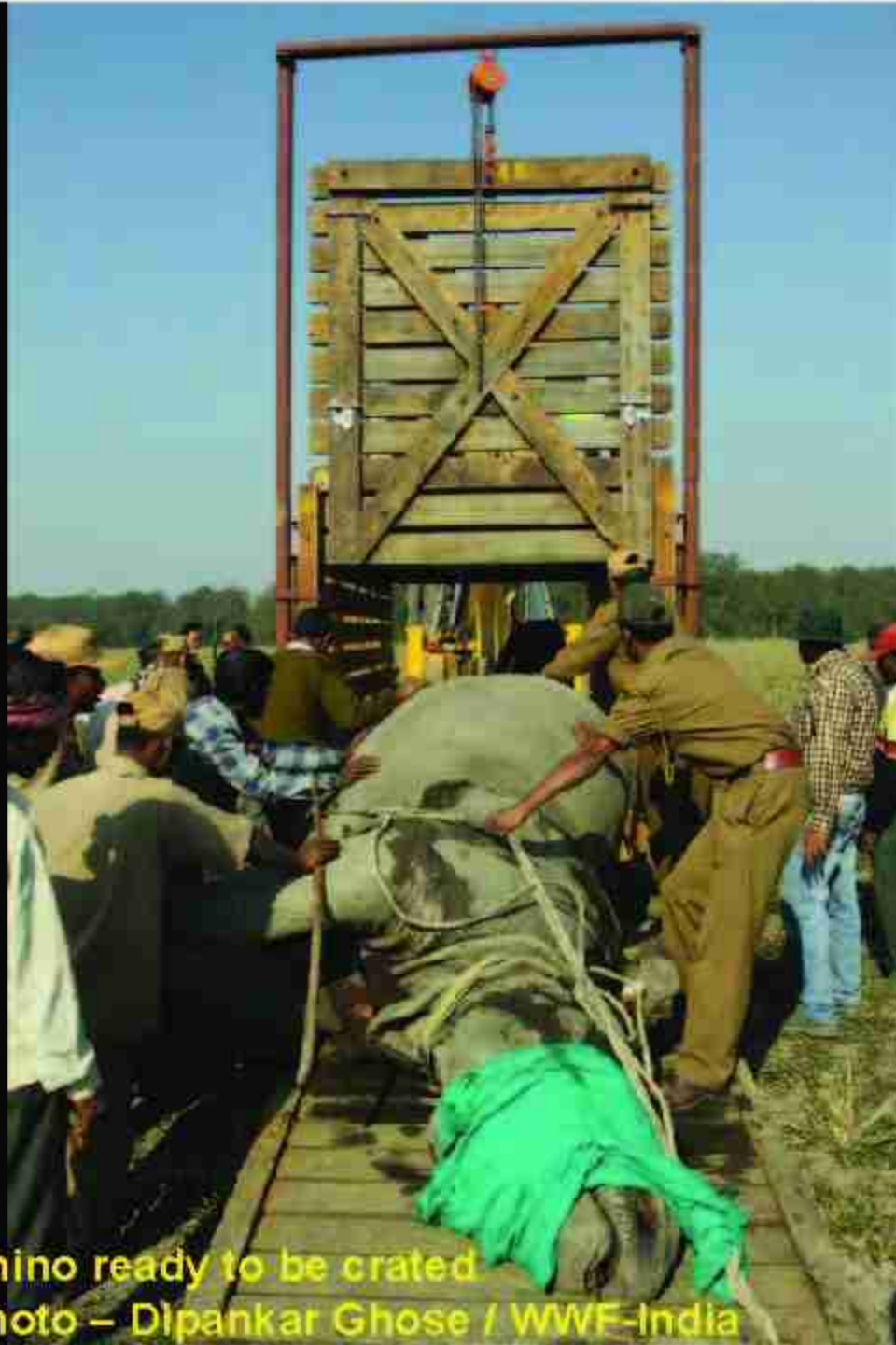
Rhino ready to be crated