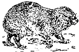
Fig. 67.—A HYRAX ( Procavia ).

being coated with enamel. The cheek teeth, which include four pairs of premolars and four of molars in each jaw, are singularly like those of the rhinoceroses, and thus quite different from those of the Rodents. With the exception of the second toe of the hind-foot, the toes are protected by short, broad nails; and the tail is remarkable for its extreme shortness. In general appearance, hyraxes (which are the conies of Scripture) are very like large cavies. While the majority live in colonies among the cracks and crannies of rocks, some of the African species are arboreal in their habits, climbing the stems and larger branches of trees, and sleeping in their holes; in this respect they are unique among the Ungulate order.