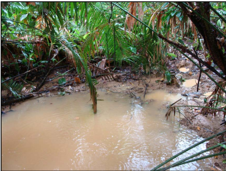
Javan Rhino Mud Wallow

The Javan rhino is largely solitary, although calves stay with their mothers after birth, for up to two years. And sometimes Javan rhinos gather in a group at a mud wallow or salt lick (a small hot spring where water full of minerals seeps or bubbles out of the ground).