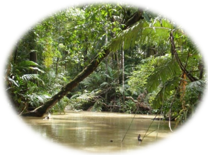
Lowland Rainforest in Ujung Kulon National Park

Because Javan rhinos are extremely rare and extremely shy, and because they mostly live in dense, rainforest, it is very difficult to find one in the wild. This means that the Javan rhino is the least studied of the five rhino species. There isn't a single Javan rhino in a zoo anywhere in the world, so scientists aren't able to study this species in captivity. Field researchers have to rely on indirect techniques like camera trapping and fecal analysis to monitor population and individual health and to learn about the rhinos' behavior in the wild.