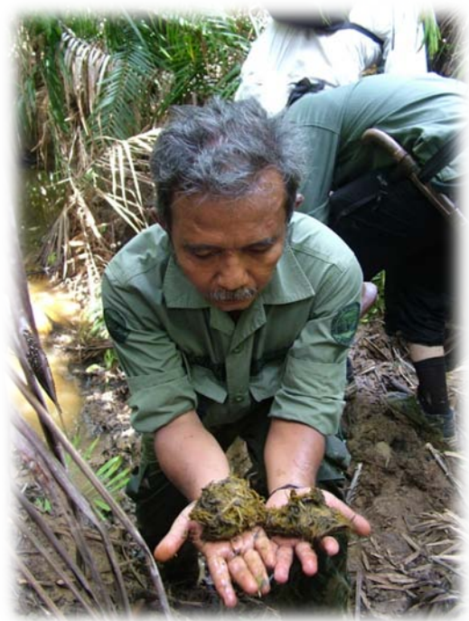
RPUs members look for rhino signs, including dung, to track and identify rhinos and to protect them.

To make the expanded habitat area more suitable for Javan rhinos, we will plant more of the rhinos' favorite foods, increase the supply of water and mud wallows, creating paths for rhinos to reach the area, and continue to monitor and protect the rhinos.