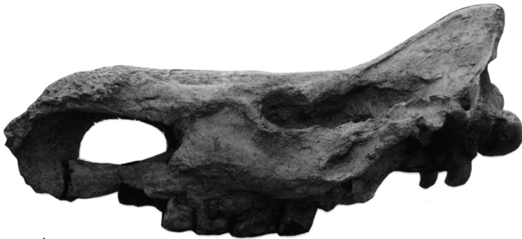
PLATE 2 / PLANȘA 2