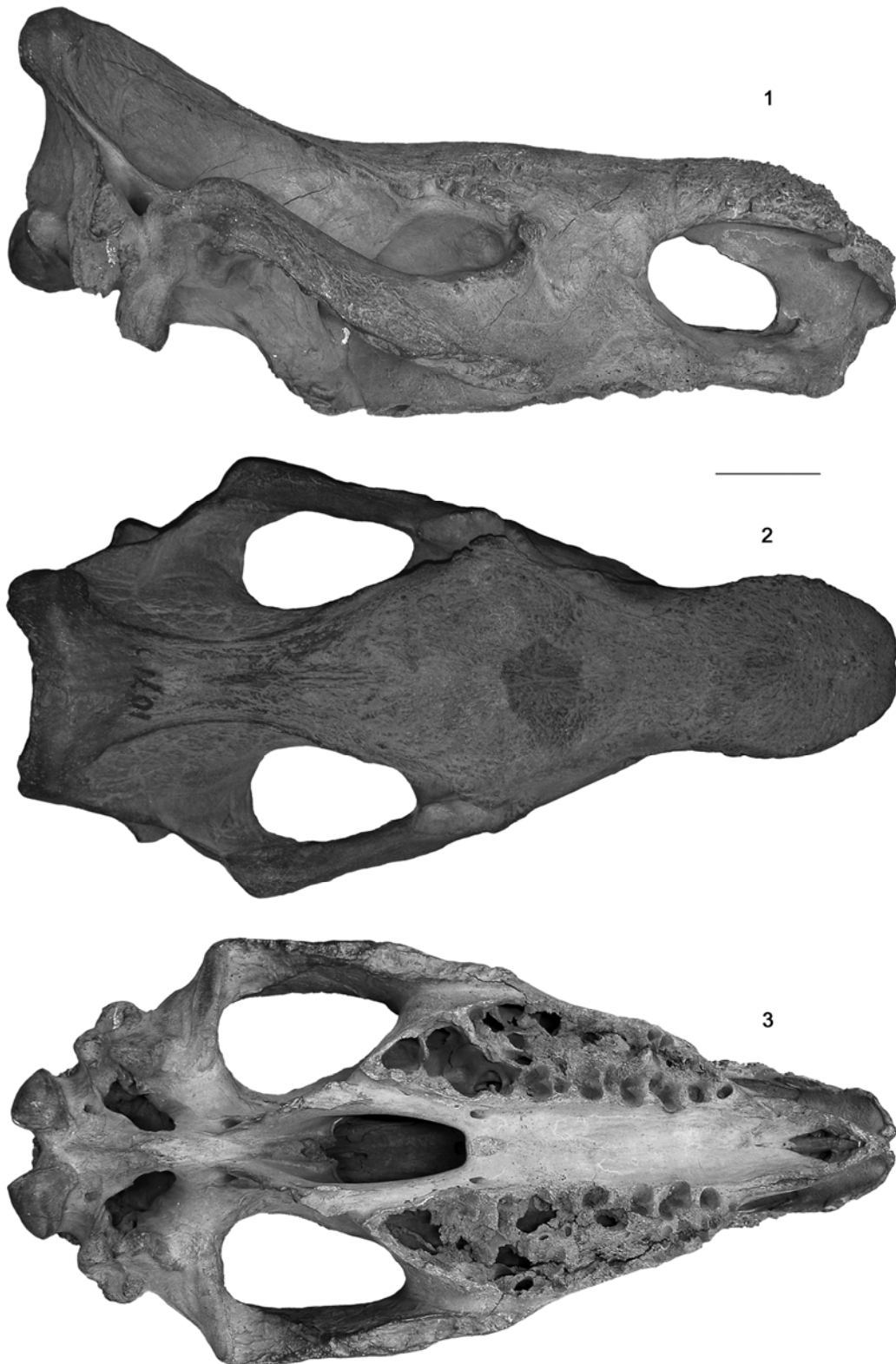
Stephanorhinus kirchbergensis (JÄGER, 1839); Irkutsk region (Southwest Eastern Siberia); skull (ZIN 10718); Figure 1a – lateral view; Figure 1b – vertical view; Figure 1c – basal view.