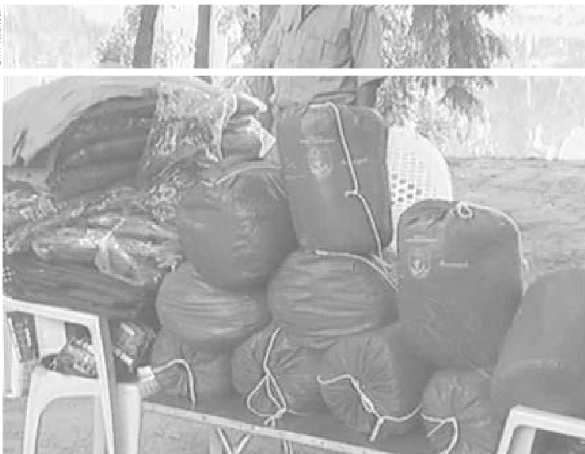
Figure 1. Anti-poaching kits distributed to forest staff in rhino areas include raincoats, jackets, sleeping bags, caps, rucksacks, water containers, a tarpaulin sheet, torch lights and hunting boots.

sanctuary has been conducted. During this field study, I observed that rhinos from Pobitora tended to migrate from November until early March.