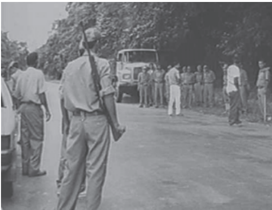
Highway patrolling in Kaziranga to stop speeding vehicles from killing wildlife in floodtime.