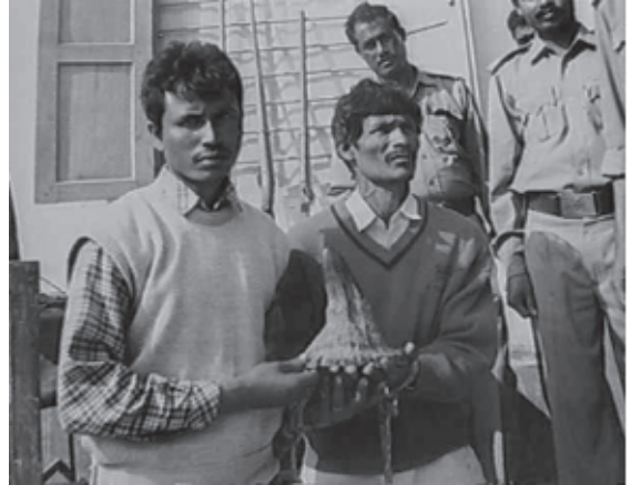
Poachers with a rhino horn arrested by the anti-poaching staff of Pabitora Wildlife Service.