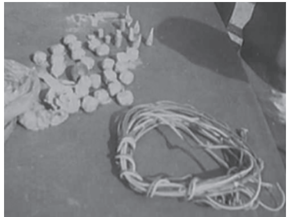
Electric wire and gunpowder used to kill rhinos, recovered from poachers by Pabitora anti-poaching staff.